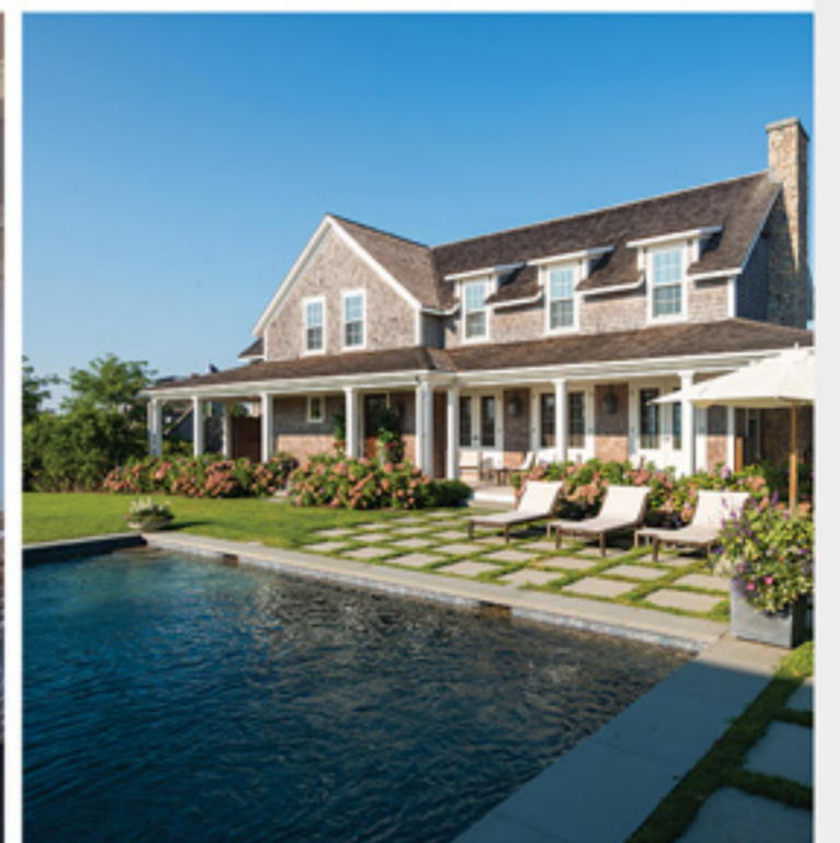
SQUAM 79 Squam Road