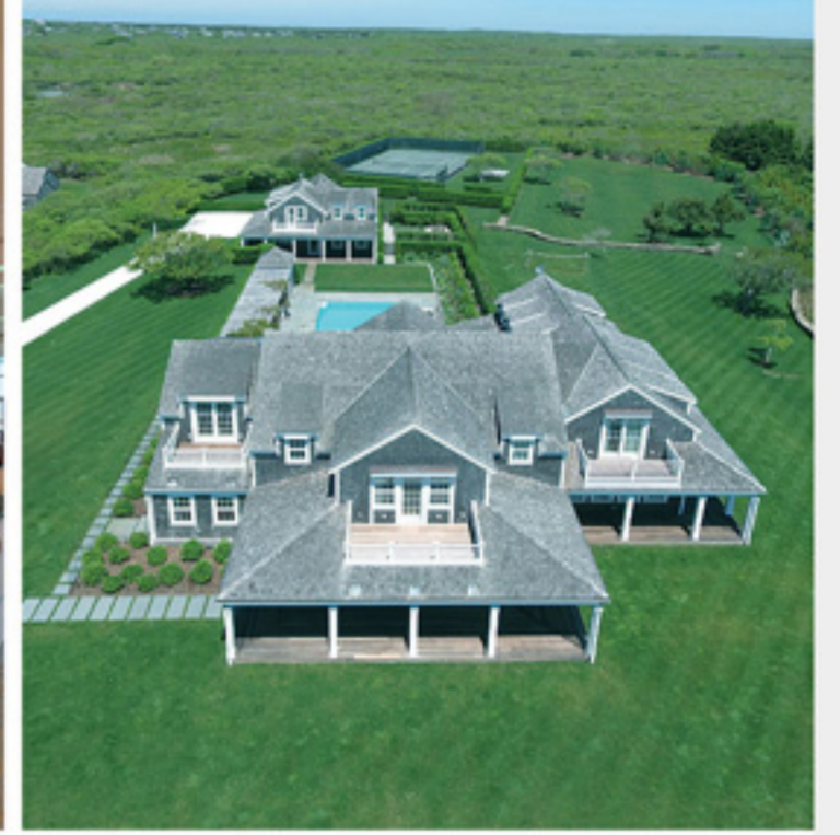
SCONSET 91 Low Beach Road