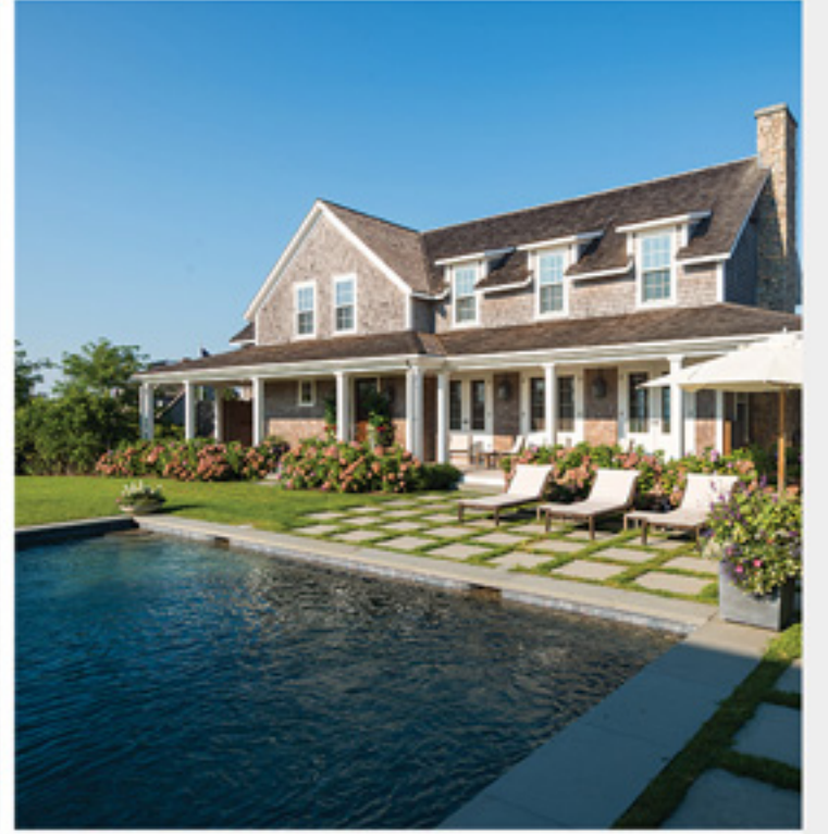
SQUAM 79 Squam Road