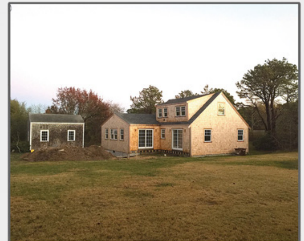
HUMMOCK POND 11 Hawthorne Lane $1,395,000