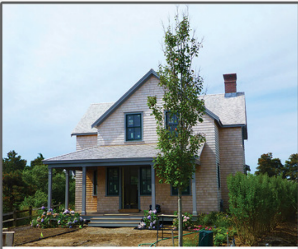
SOUTH OF TOWN 7 Finback Lane $2,095,000