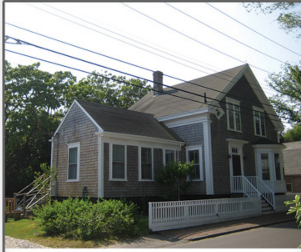
TOWN 7 Gardner Street $1,995,000