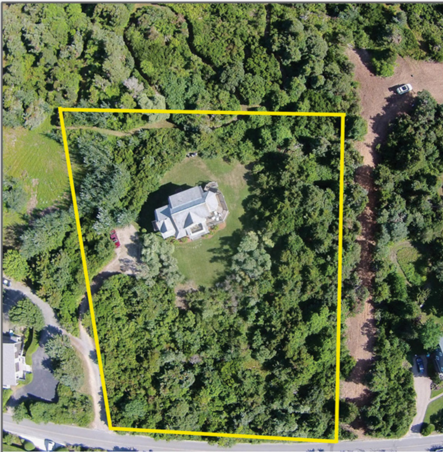
MONOMOY 65 Monomoy Road