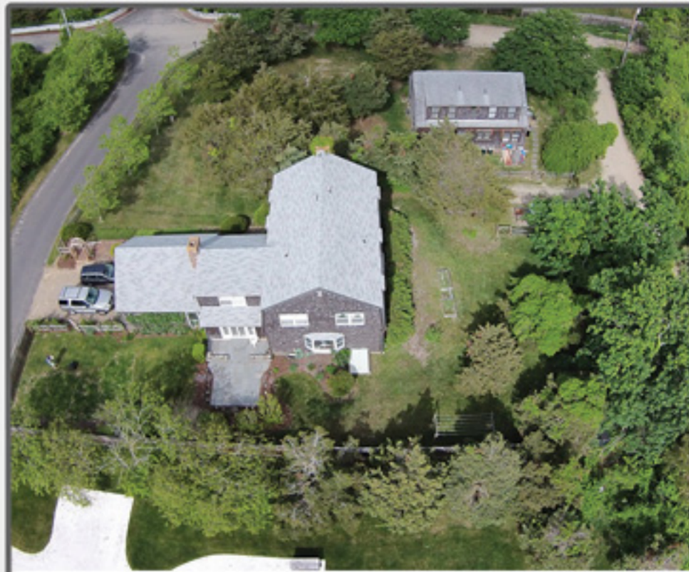
MID ISLAND 37 Cato Lane $1,750,000