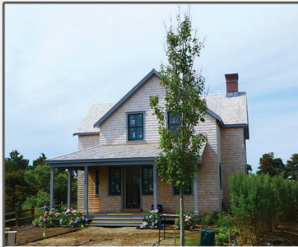
SOUTH OF TOWN 7 Finback Lane $2,095,000