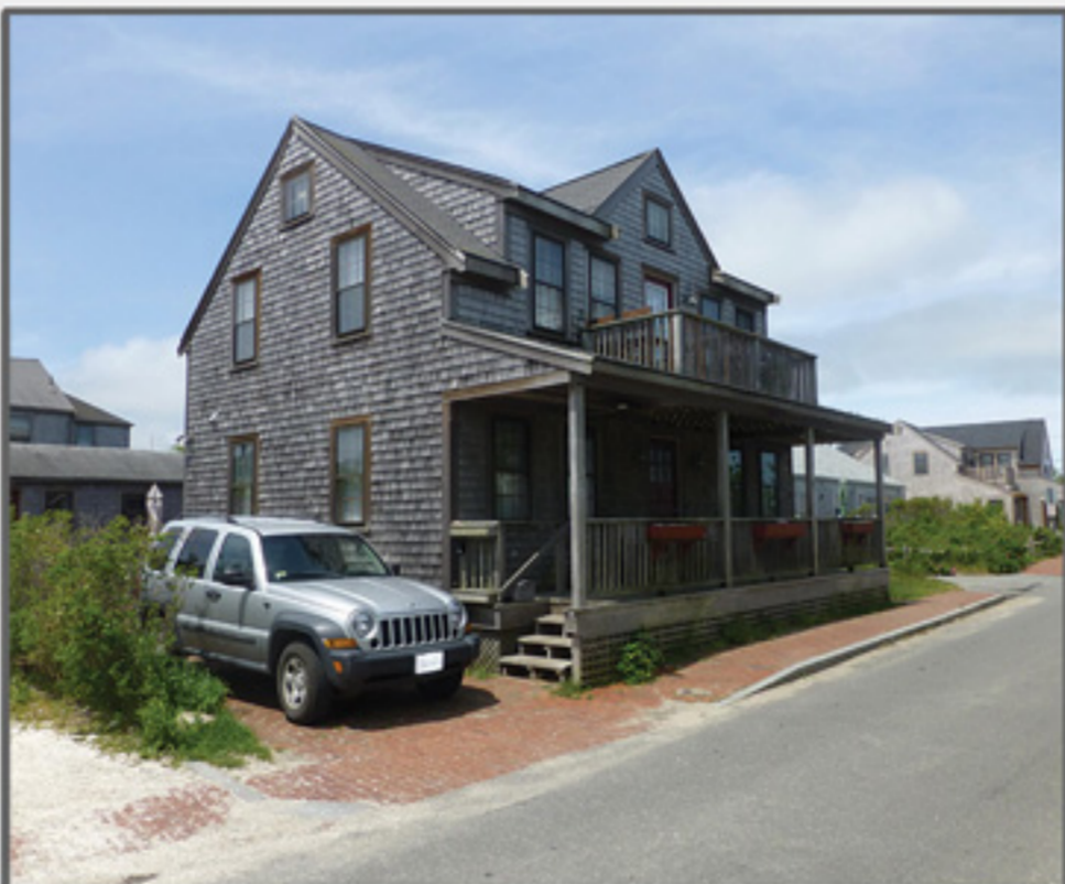
TOWN 89A Washington Street #1 $1,395,000