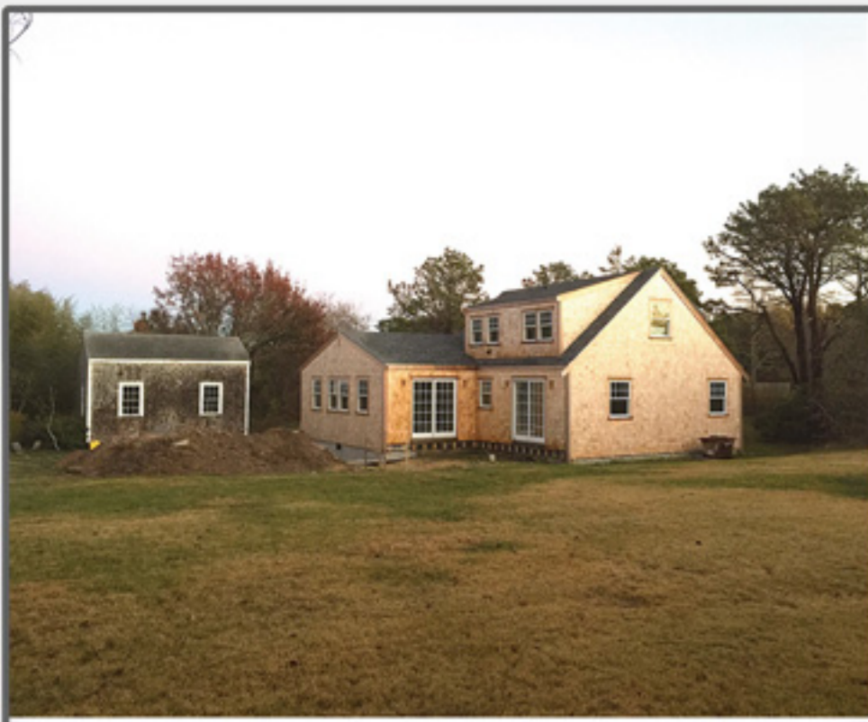
HUMMOCK POND 11 Hawthorne $1,395,000