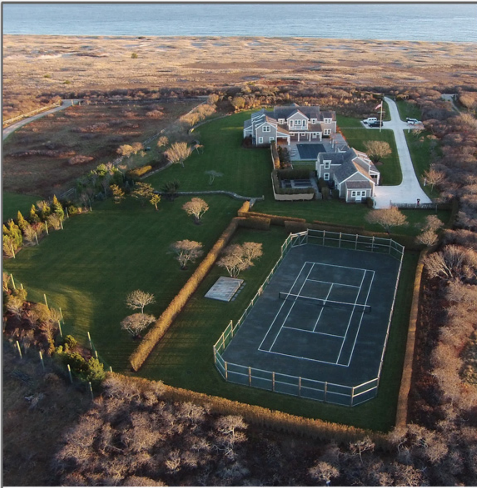
SCONSET 91 Low Beach