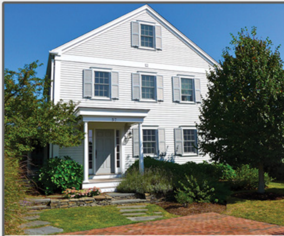
NAUSHOP 57 Goldfinch Drive $1,349,000