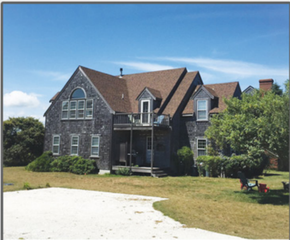
SCONSET 52 Sankaty Road $1,950,000