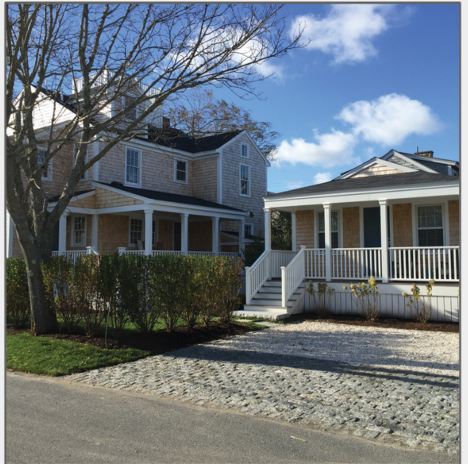
BRANT POINT 45 Easton Street