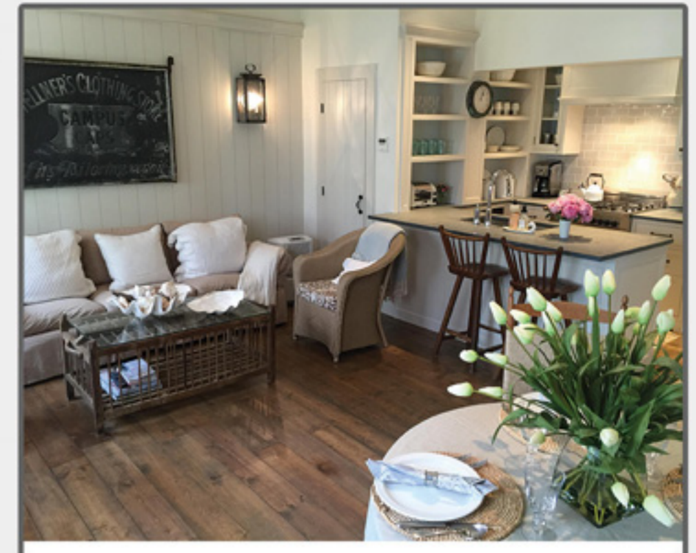
TOWN 14 Still Dock #1 $1,295,000