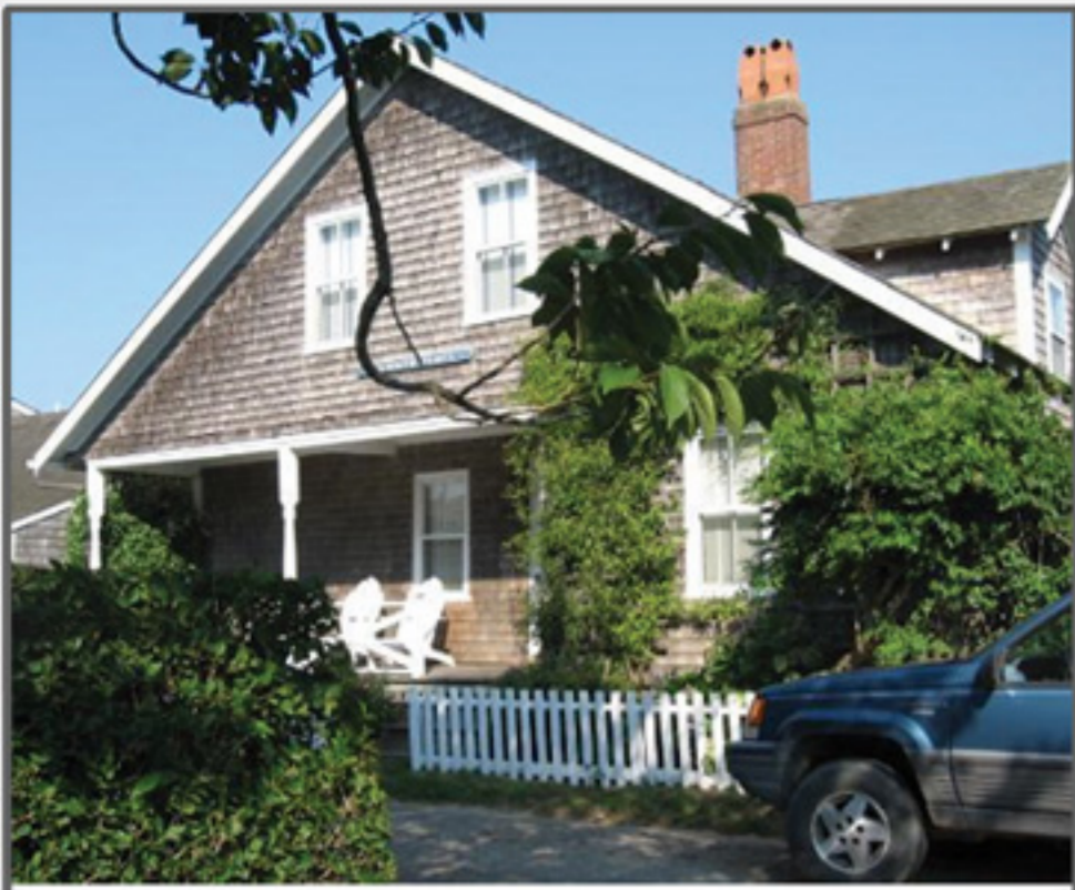
SCONSET 21 Broadway Street $2,250,000