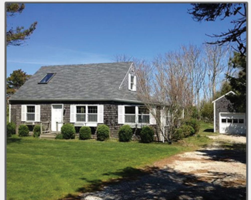
HUMMOCK POND 11 Hawthorne $1,395,000