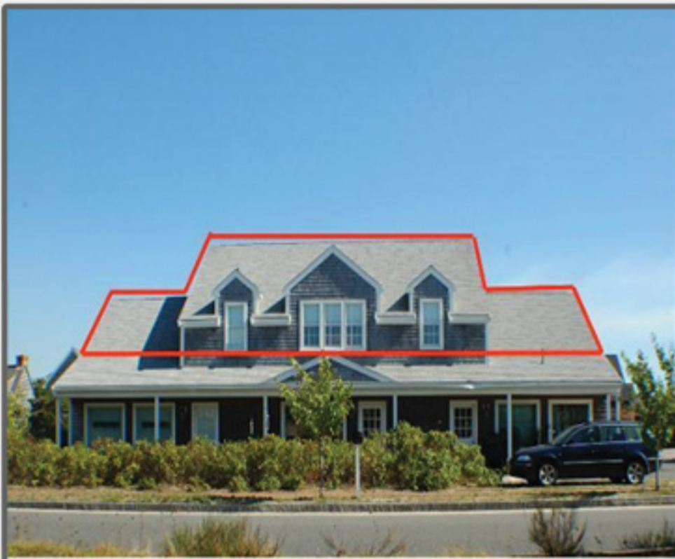
MID ISLAND 14 Amelia Drive #3 $775,000