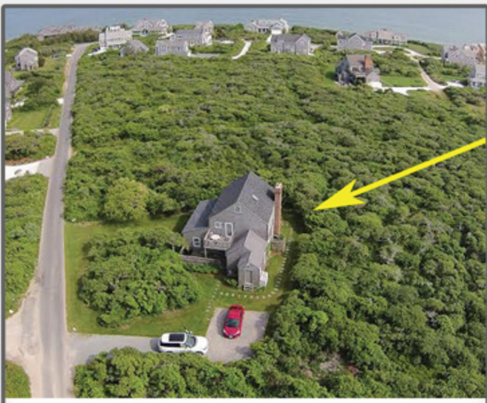
TOM NEVERS 15 Old Tom Nevers $1,450,000