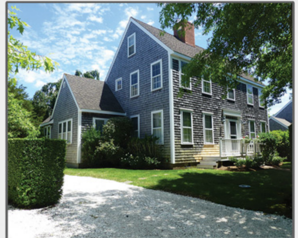
NASHAQUISSET 17 Washaman Avenue $1,450,000