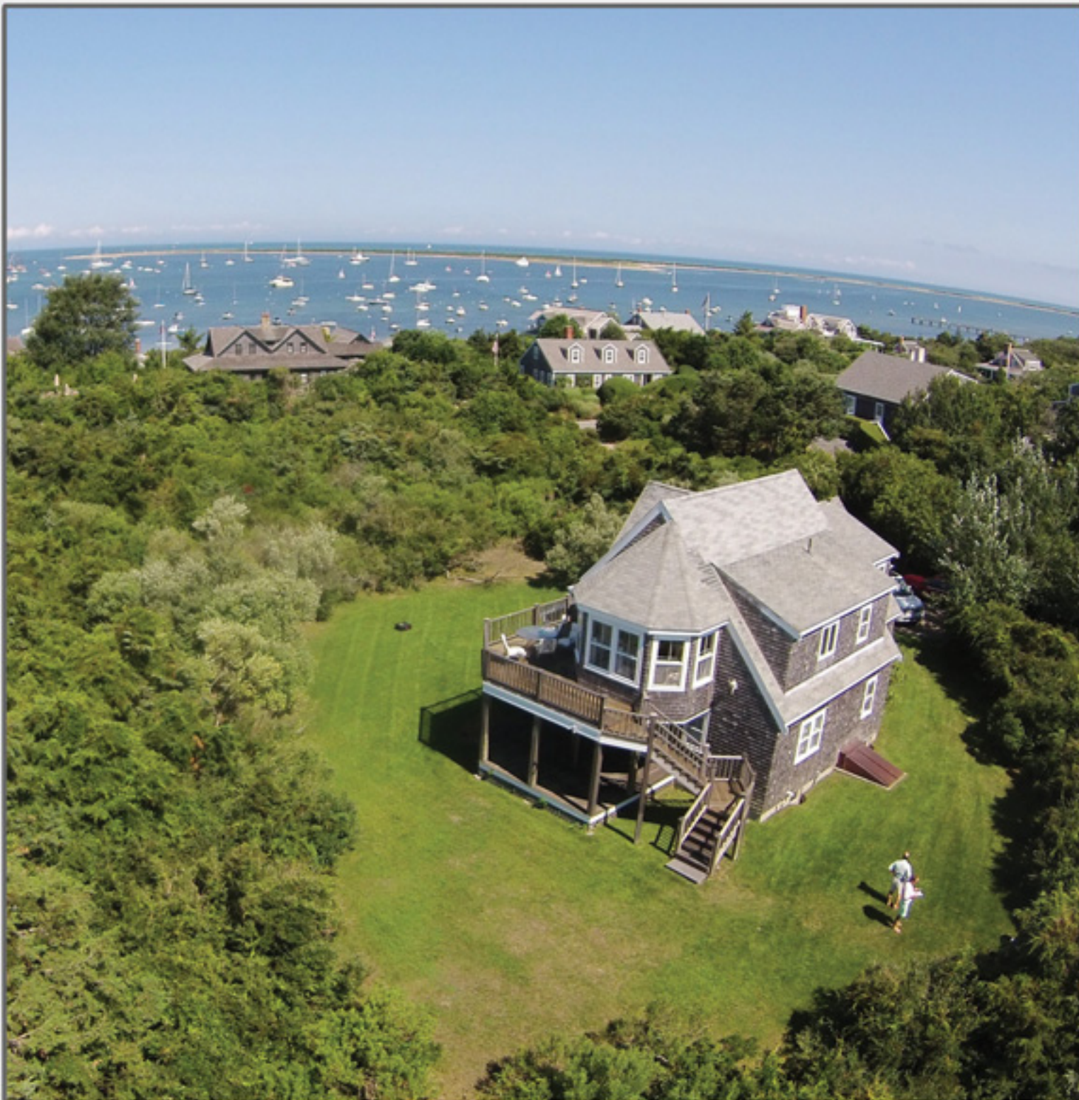
MONOMOY 65 Monomoy Road