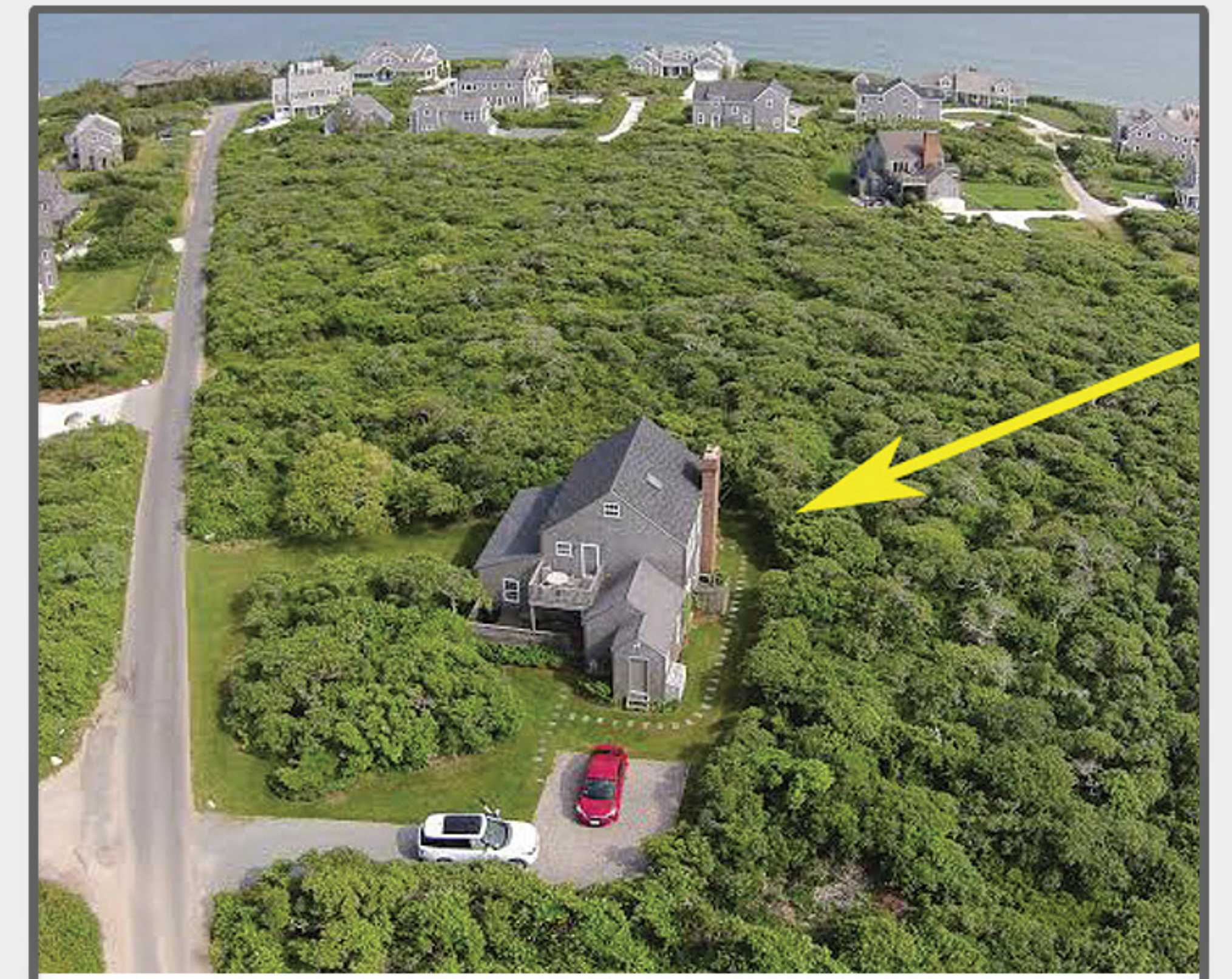
TOM NEVERS 15 Old Tom Nevers Road $1,450,000