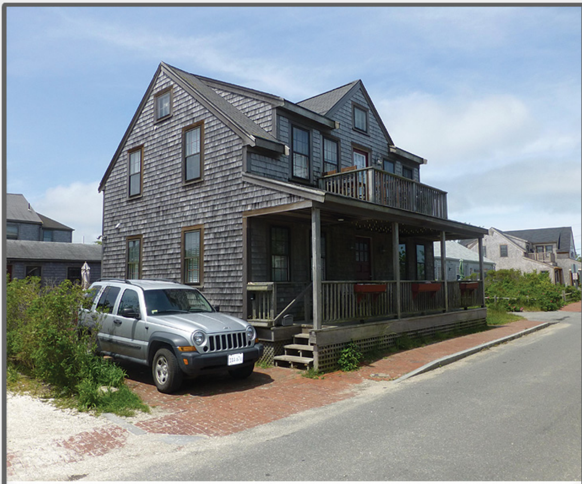
TOWN 89A Washington Street #1 $1,395,000