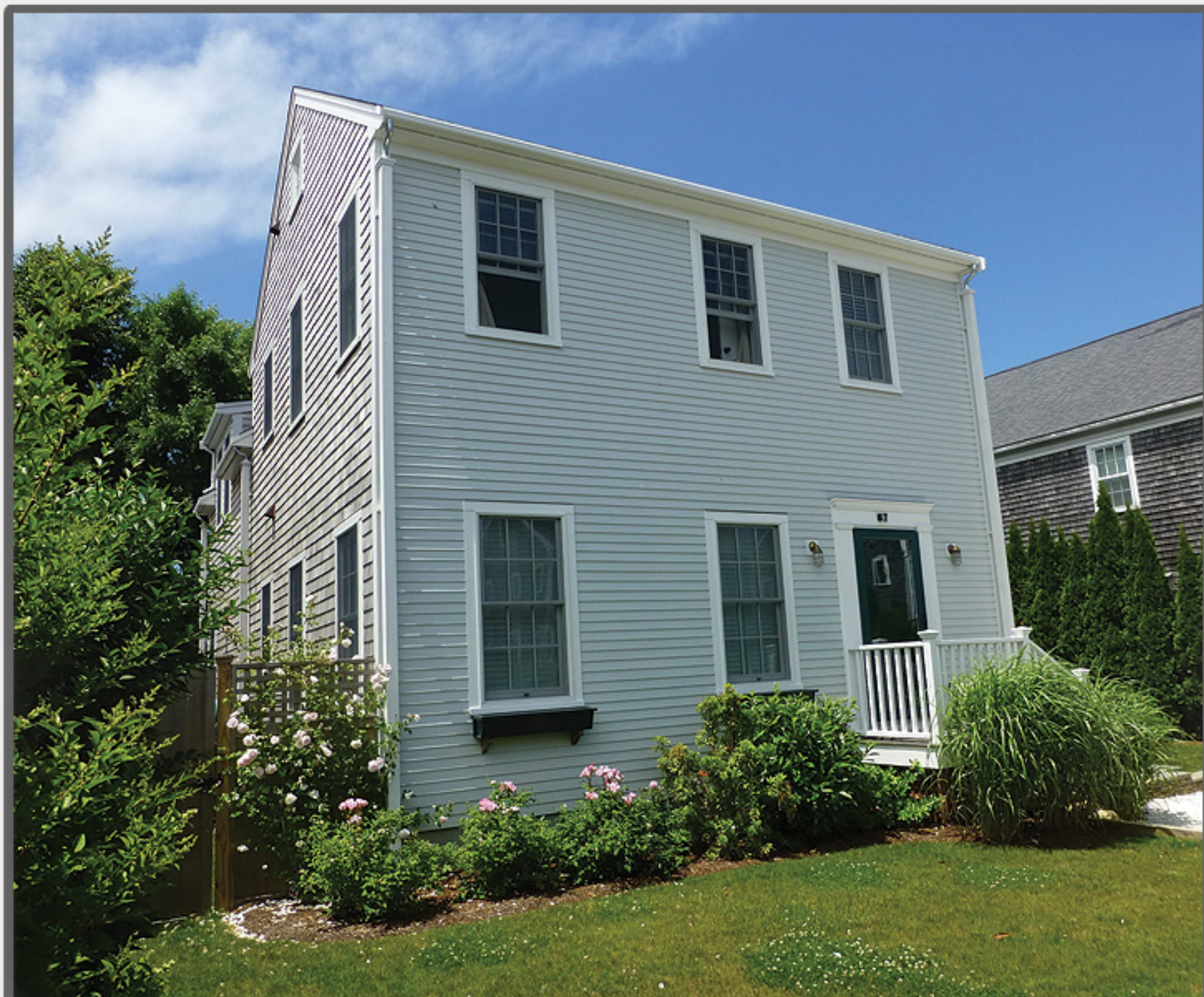
NAUSHOP 87 Goldfinch Drive $1,275,000