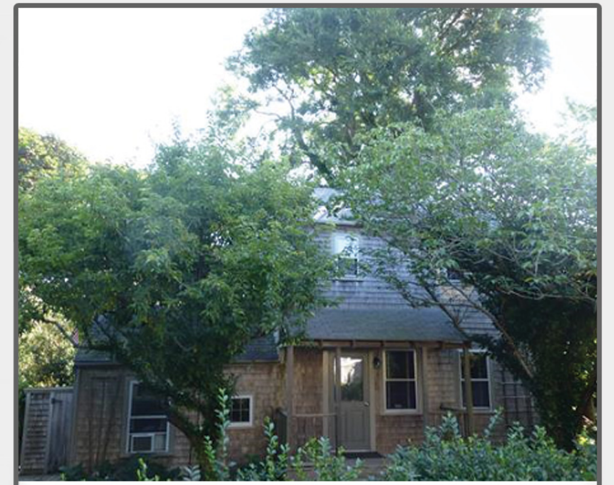
TOWN 13A West Dover Street $585,000