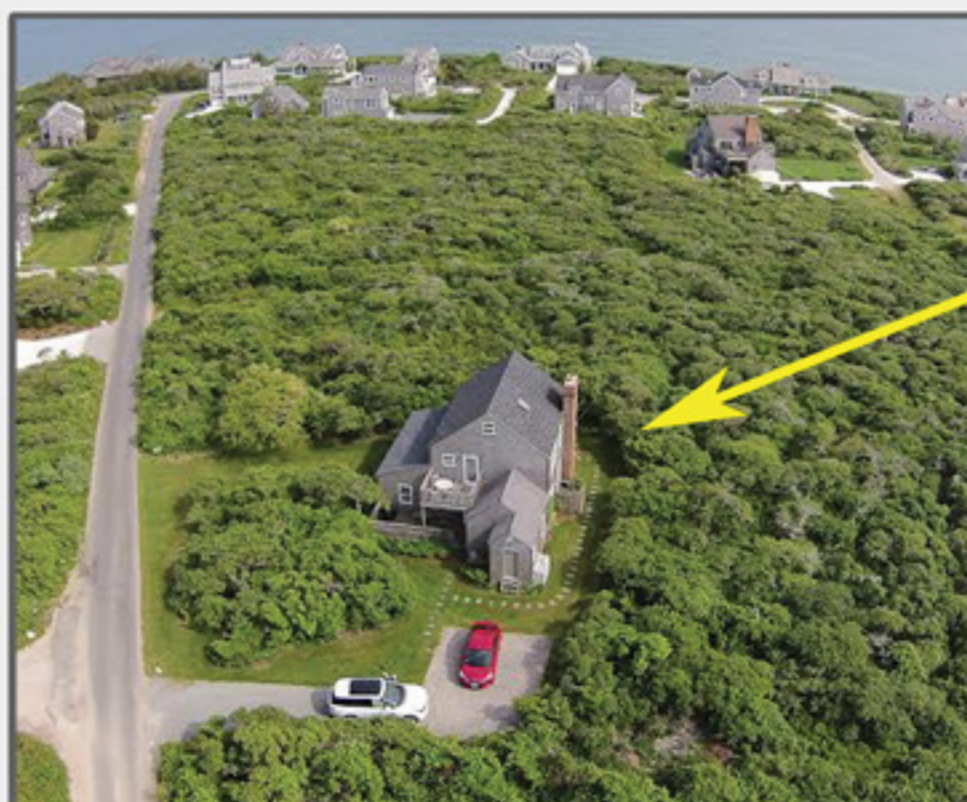
TOM NEVERS 15 Old Tom Nevers Road $1,450,000