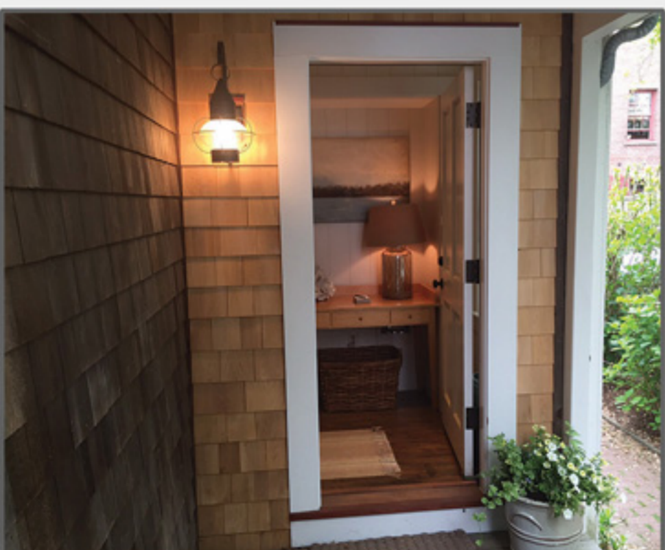
TOWN 14 Still Dock #1 $1,500,000