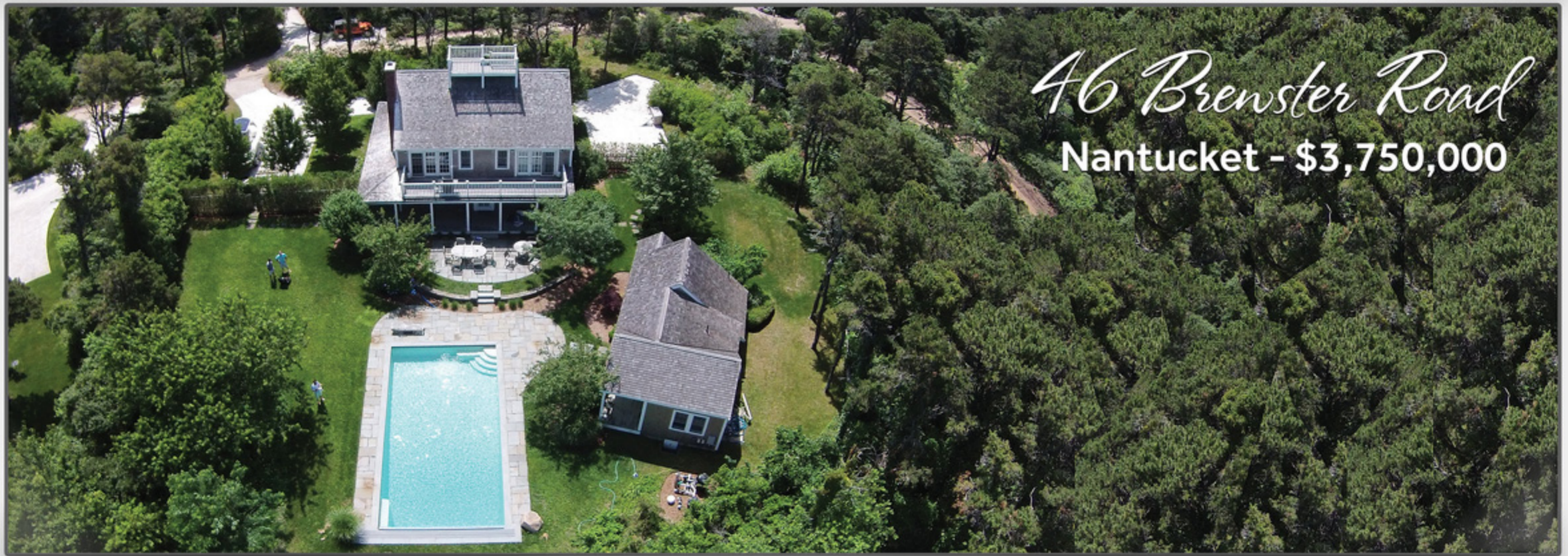
46 Brewster Road Nantucket - $3,750,000