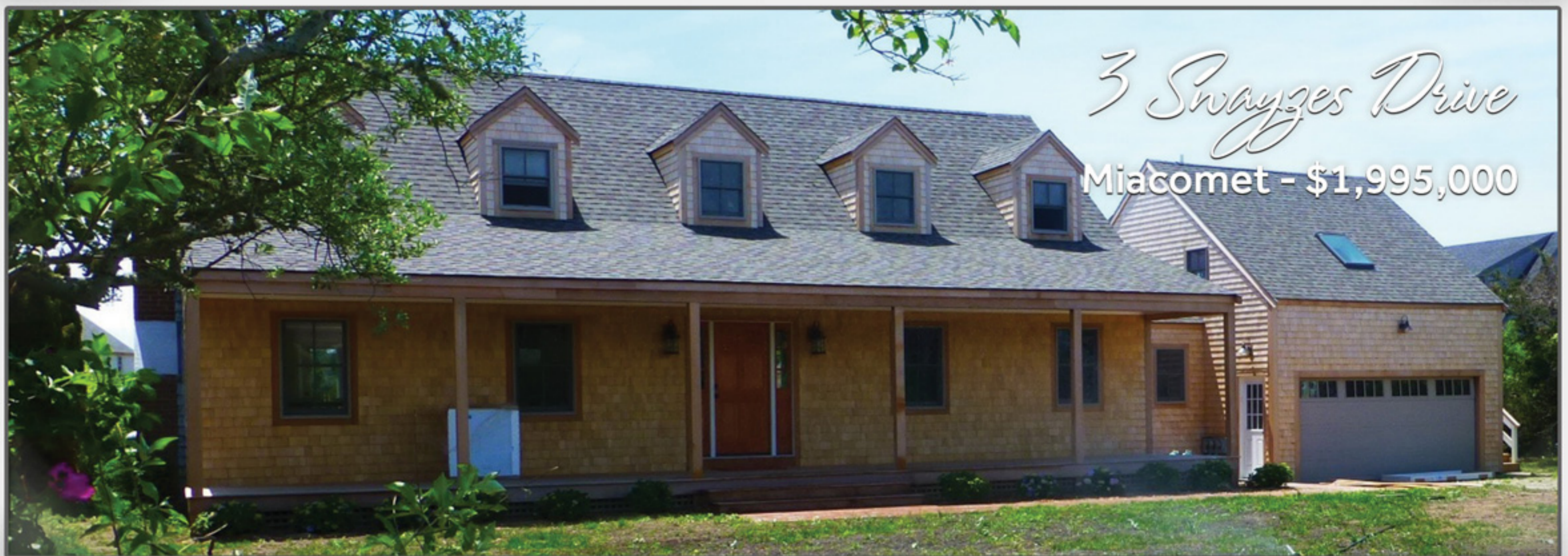
3 Swayzes Drive Miacomet - $1,995,000