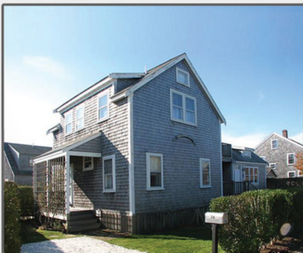
BRANT POINT 36 Walsh Street