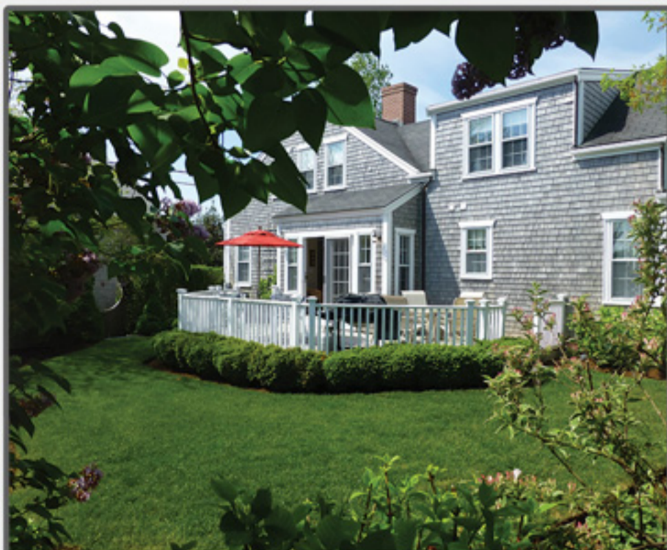
TOWN 5 E. Dover Street $1,850,000