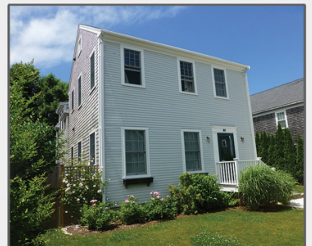
NAUSHOP 87 Goldfinch Drive $1,450,000