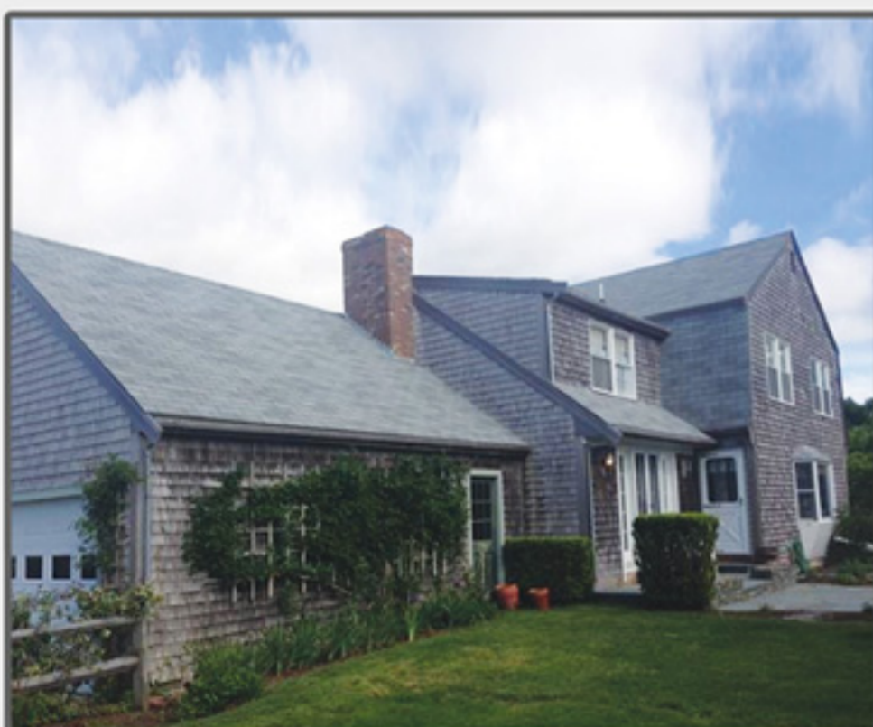
MID ISLAND 37 Cato Lane