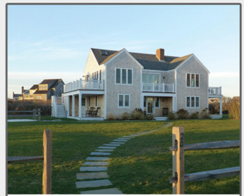
TOM NEVERS 20 Wanoma Way