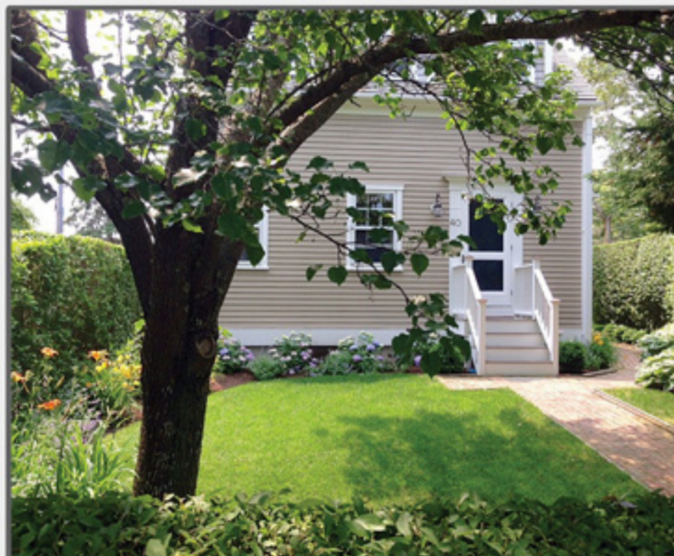
TOWN 40 Vestal Street $1,765,000