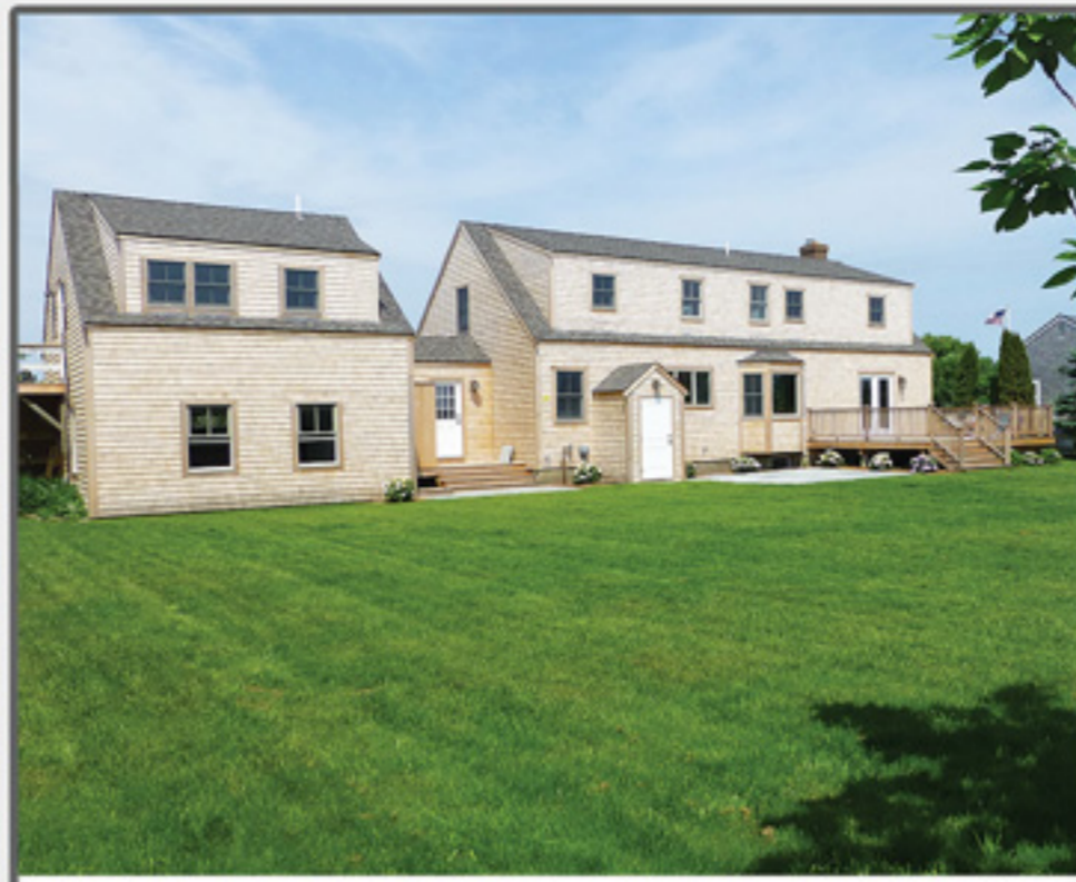
MIACOMET 3 Swayzes Drive $1,995,000