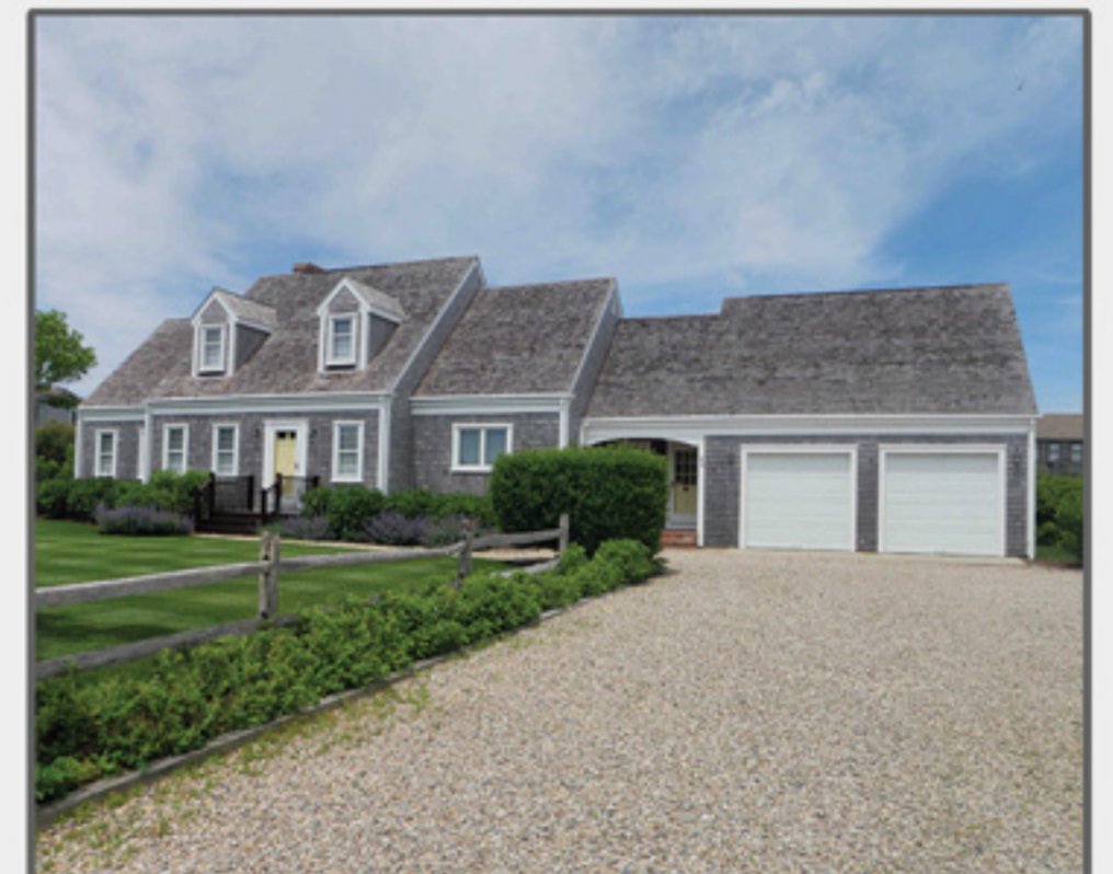
MADAKET 17 Long Pond Drive $1,625,000