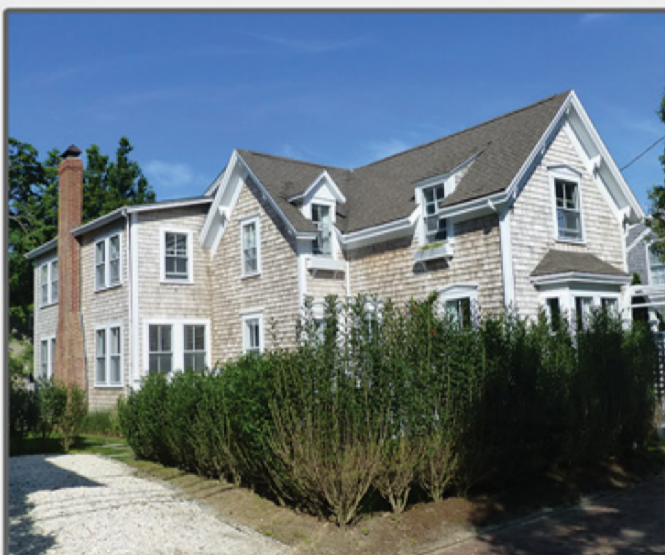
CLIFF 34 Cliff Road