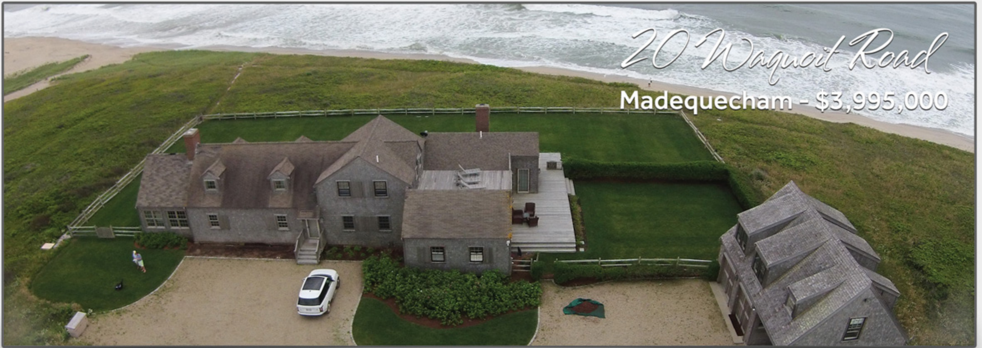
20 Waquoit Road Madequecham - $3,995,000