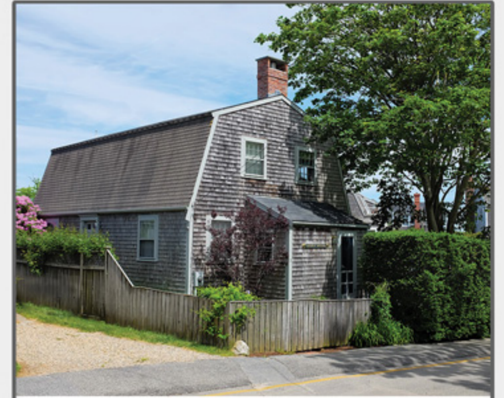
SCONSET 1 Gully Road $1,199,000