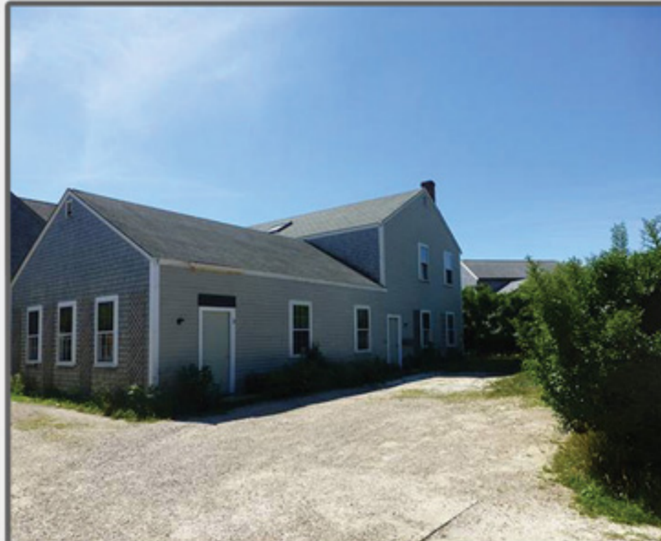
MID ISLAND 9 Teasdale Circle 3 & 4 $950,000