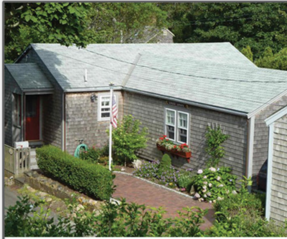
TOWN 10 Warren Street #2 $1,285,000