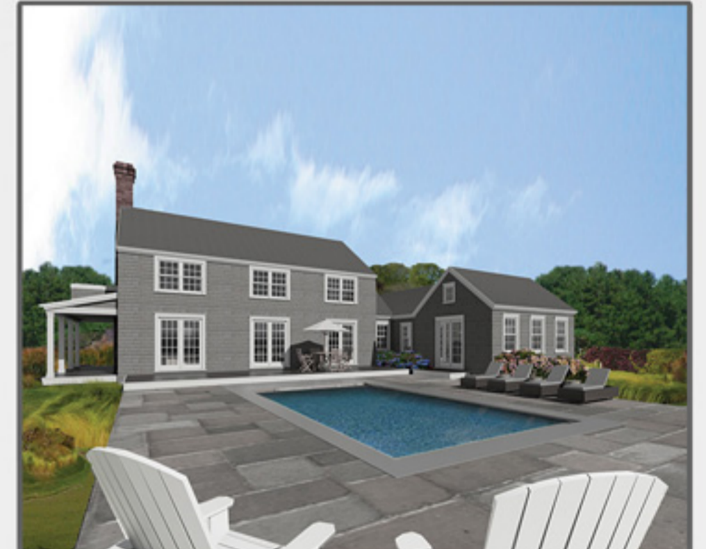
WEST OF TOWN 12 Oak Hollow Lane $950,000