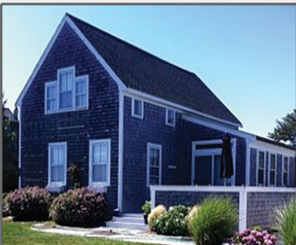
MADAKET 240 Madaket Road $899,999