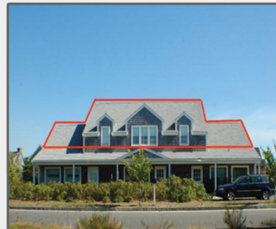
MID ISLAND 14 Amelia Drive #3 $775,000