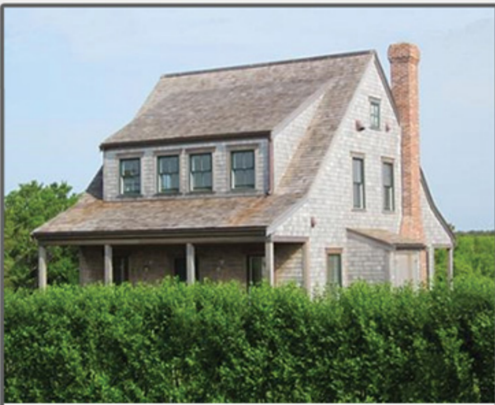
CISCO 111 Hummock Pond Road $1,049,000