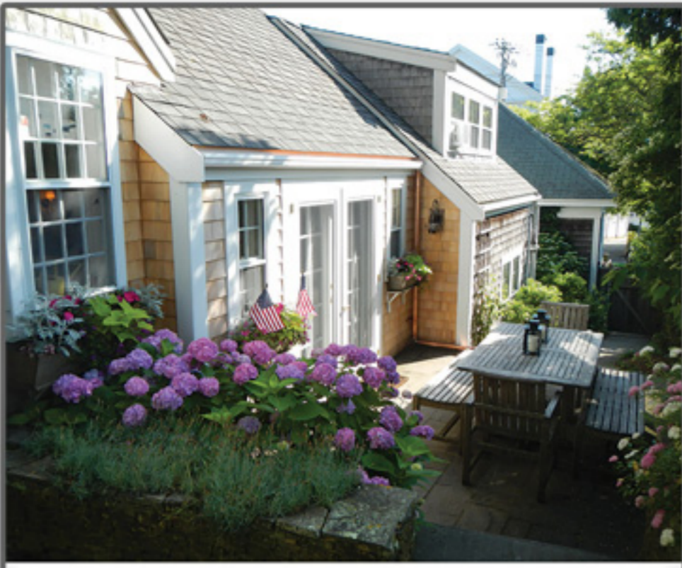
TOWN 67 Orange Street $1,290,000