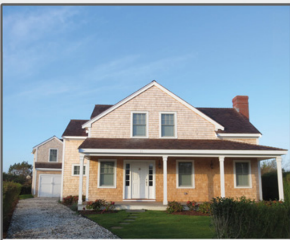
HUMMOCK POND 11 Aurora Way