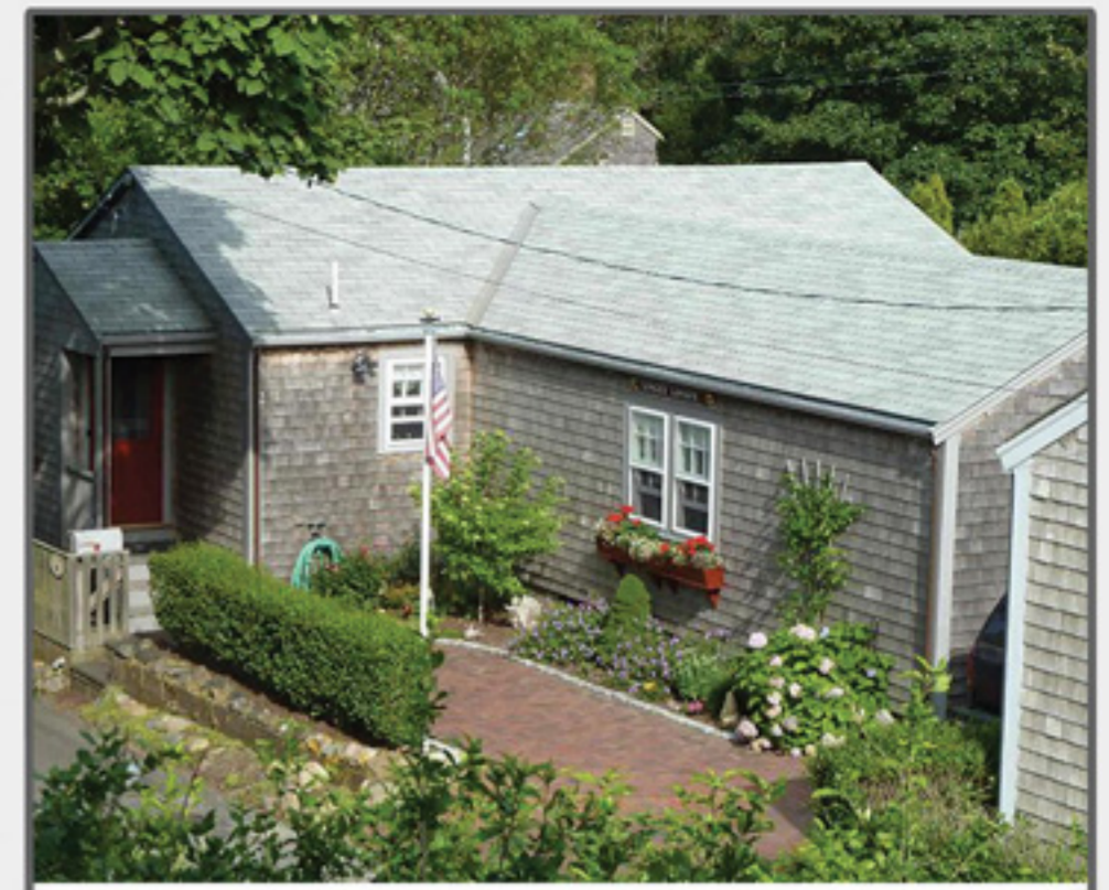
TOWN 10 Warren Street #2 $NEED PRICE