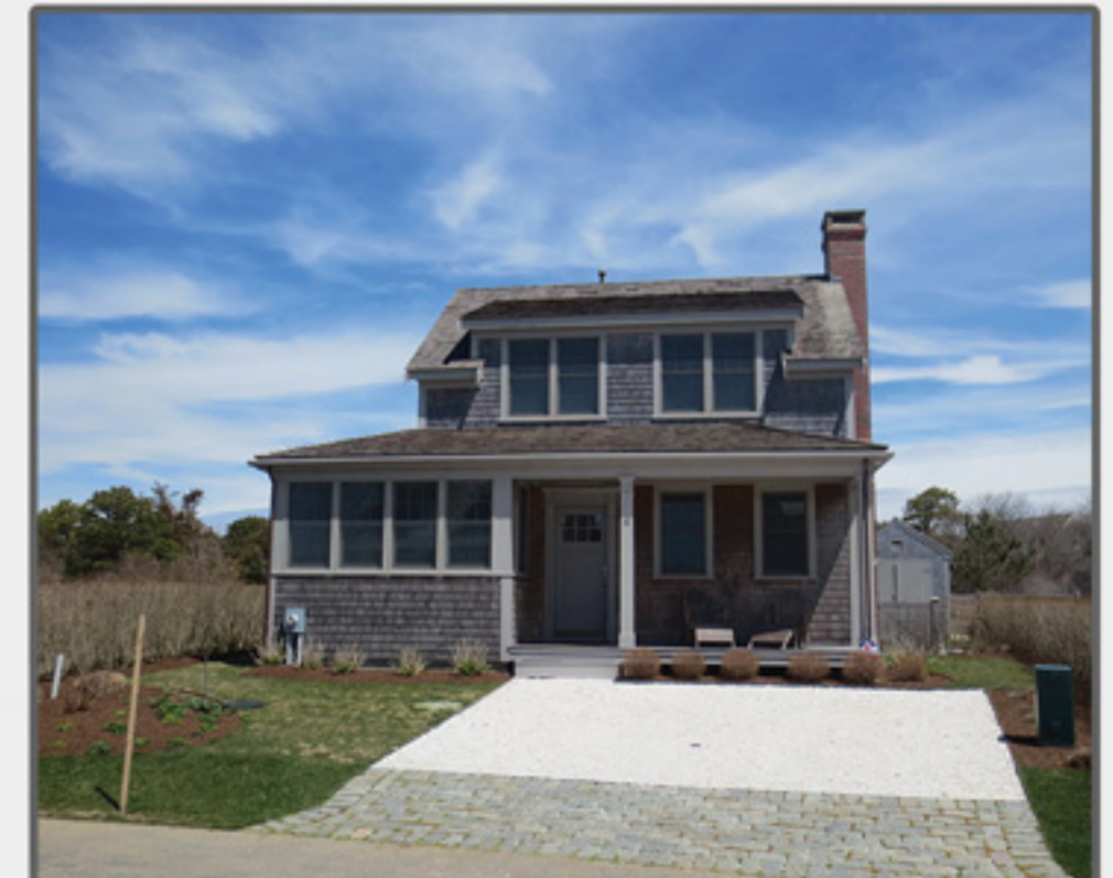
SOUTH OF TOWN 3 Finback Lane