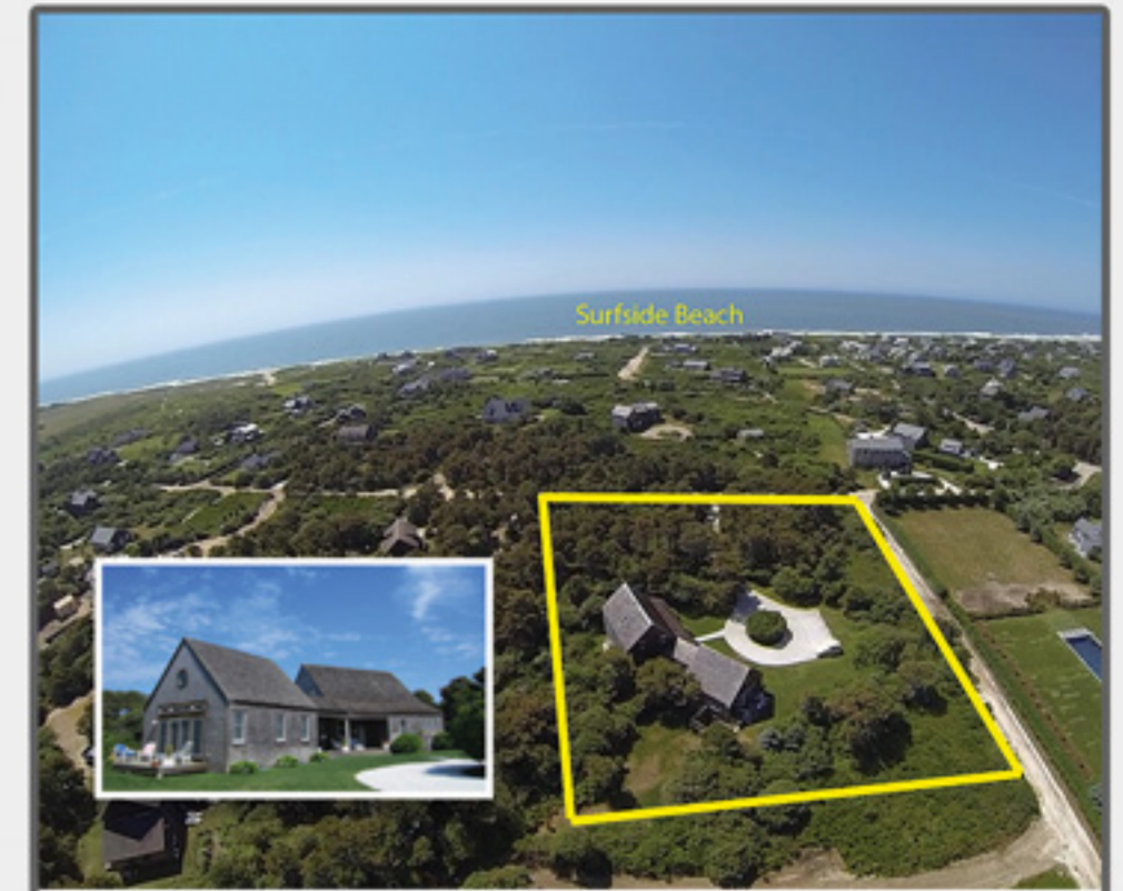
SURFSIDE 58 Pochick Avenue