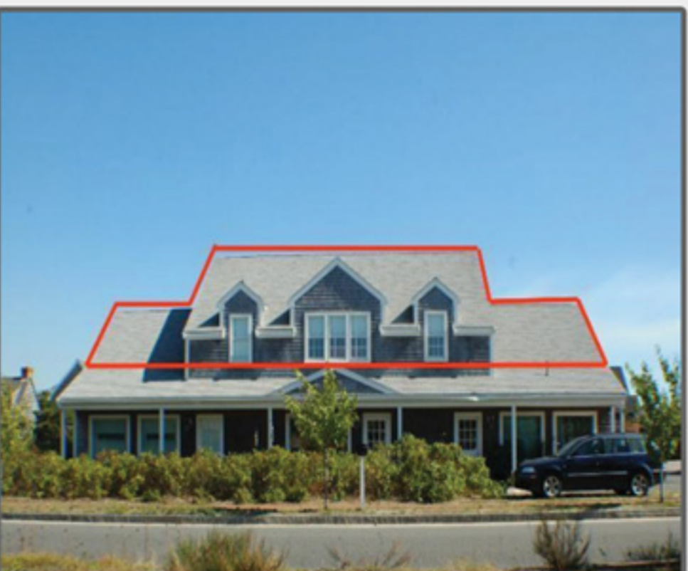
MID ISLAND 14 Amelia Drive $775,000