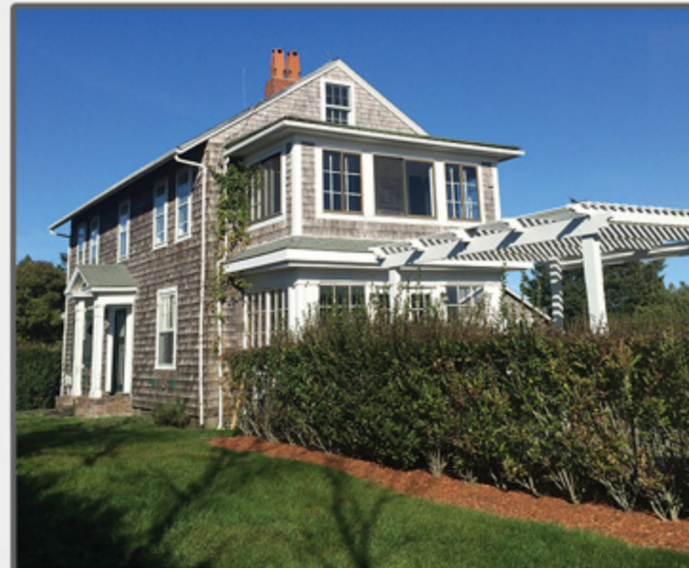
SCONSET 4 Black Fish Lane