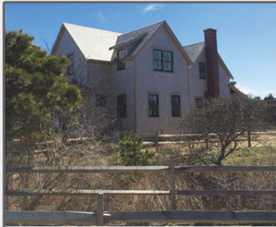
SOUTH OF TOWN 12 Finback Lane