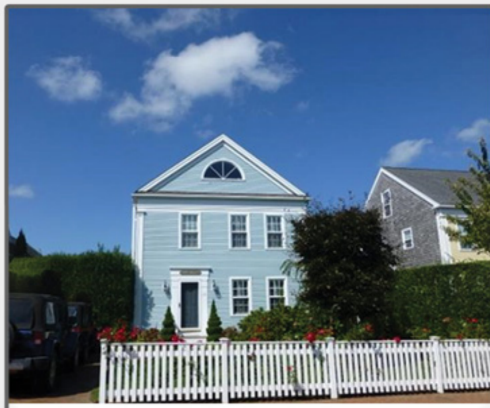
NAUSHOP 16 Killdeer Lane $1,325,000