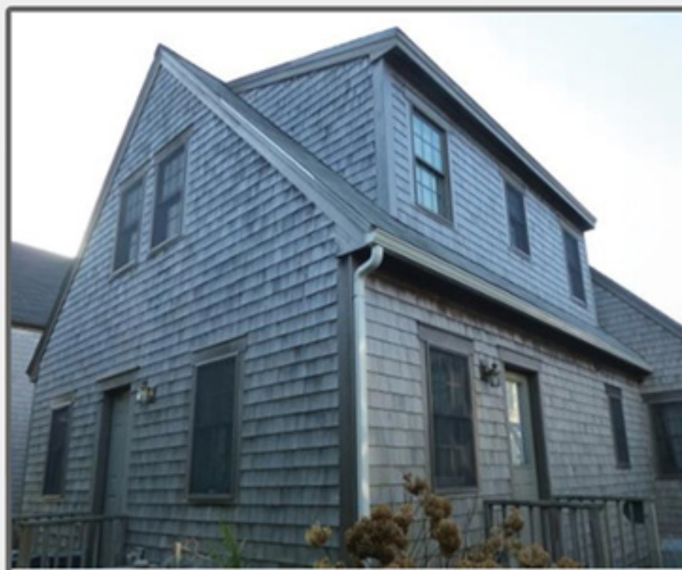
MID ISLAND 5 Mary Ann Drive