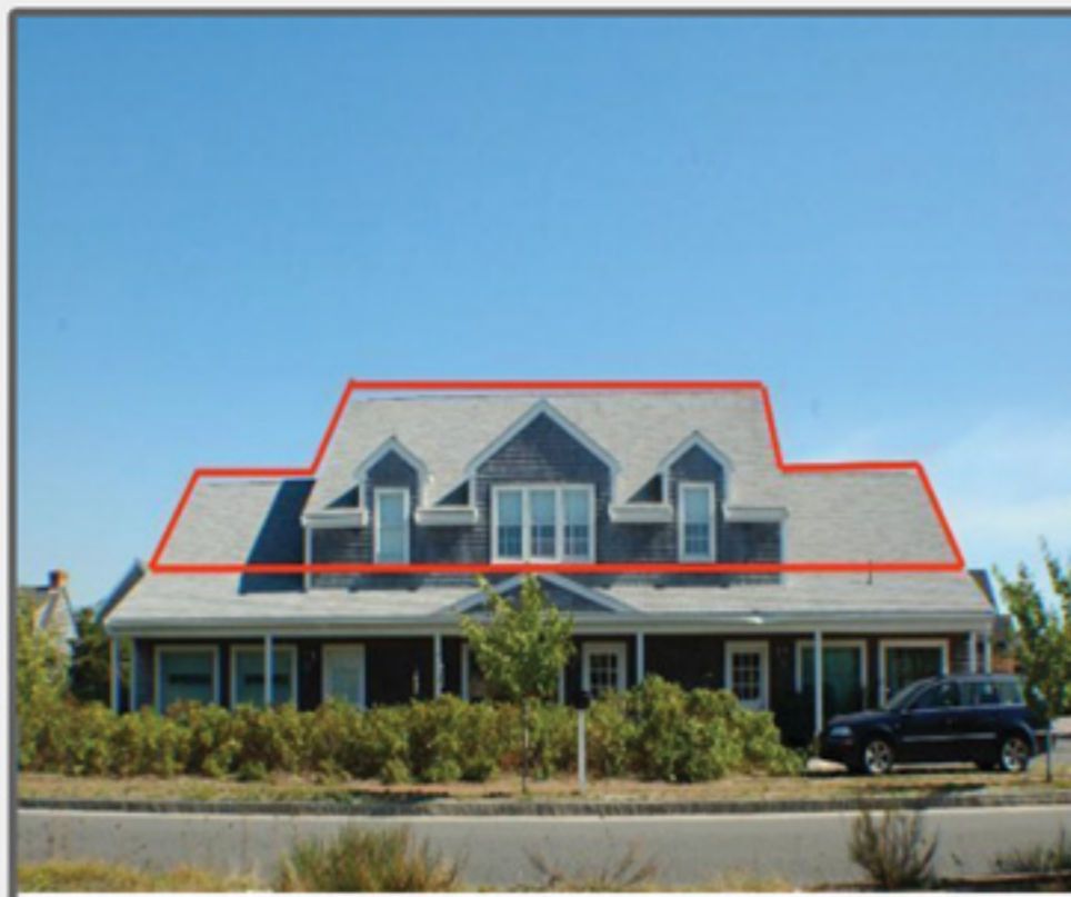
MID ISLAND 14 Amelia Drive