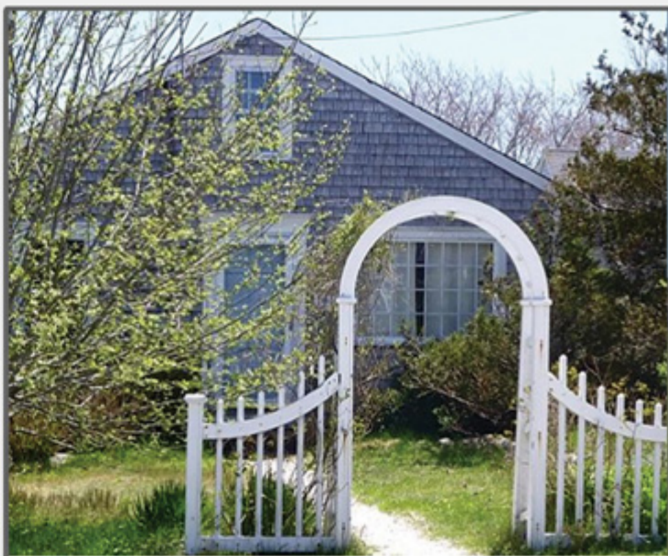
TOWN 10.5 Cherry Street