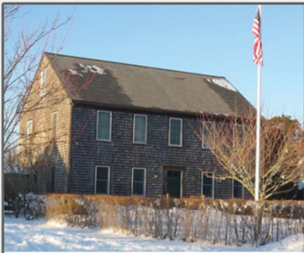
MID ISLAND 28 Equator Drive