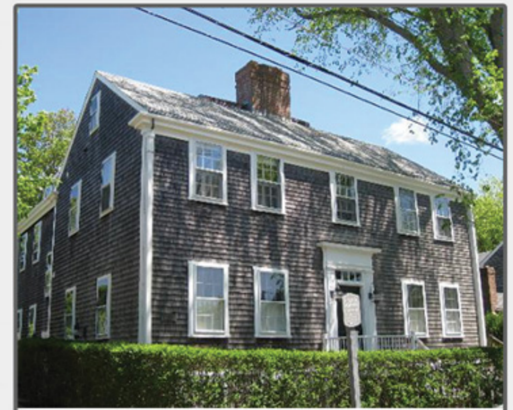
TOWN 23 West Chester Street #6