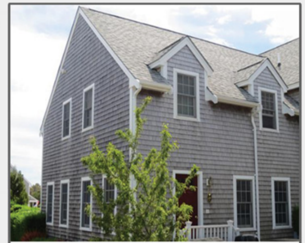
MID ISLAND 20 A Park Circle