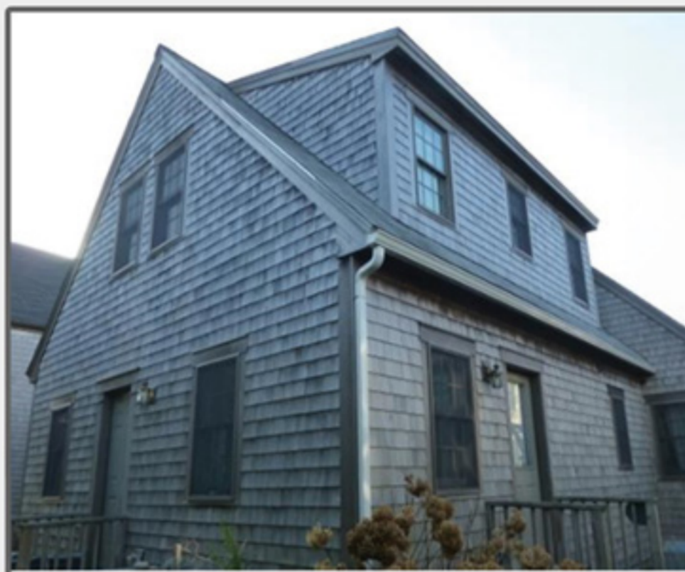
MID ISLAND 5 Mary Ann Drive