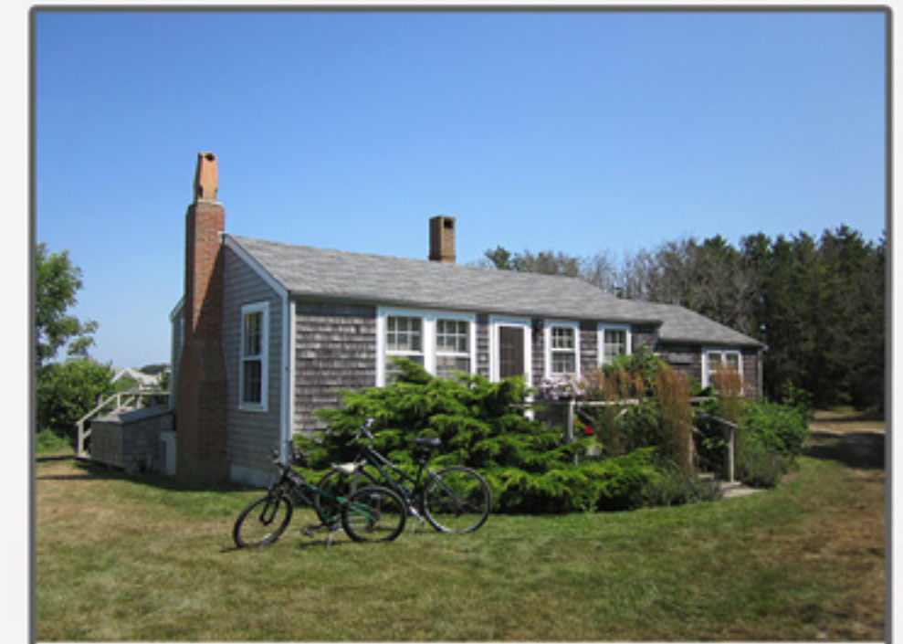
MADAKET 17 Ames Ave 3 bed. / 1.5 baths Weekly Rental: $3,200 - $4,000