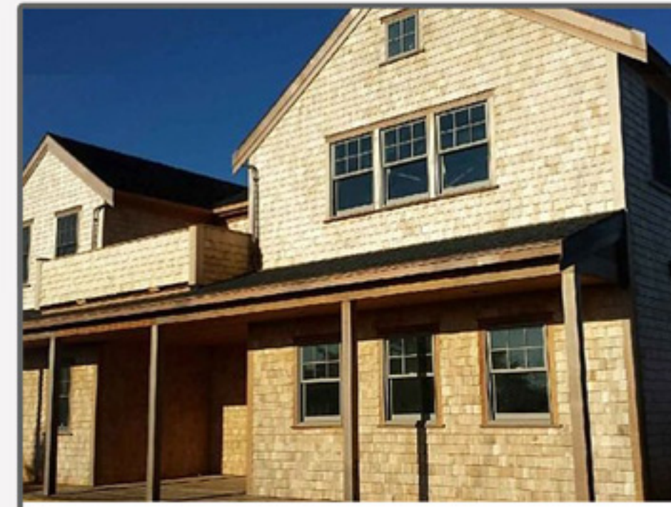
CISCO 13 Swayze's Drive 5 bed. / 5.5 baths Weekly Rental: $6,500 - $12,000