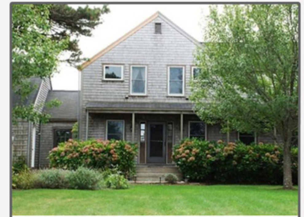
CISCO 12 Hawthorne Lane 4 bed. / 3 baths Weekly Rental: $4,500 - $7,000