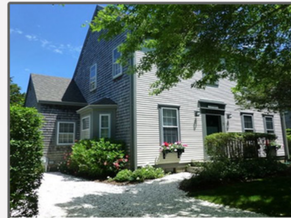
NASHAQUISSET 21 Washaman 3 bed. / 3.5 baths Weekly Rental: $4,220 - $5,480