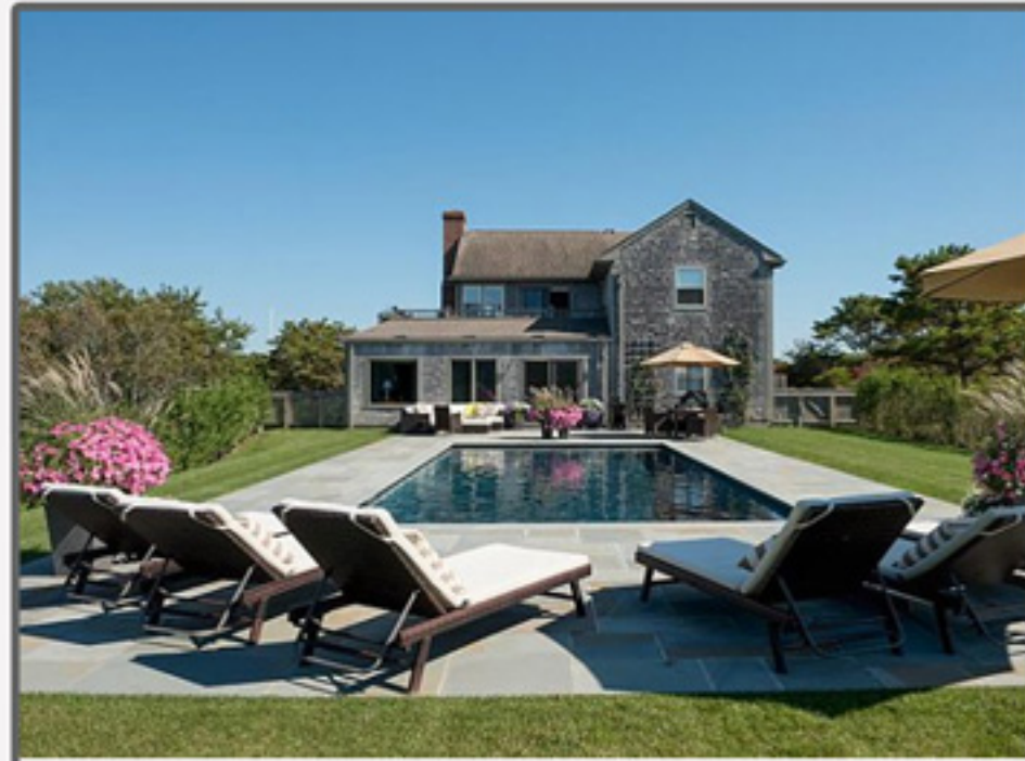
DIONIS 19 Bishops Rise 4 bed. / 3.5 baths Weekly Rental: $8,500 - $14,500