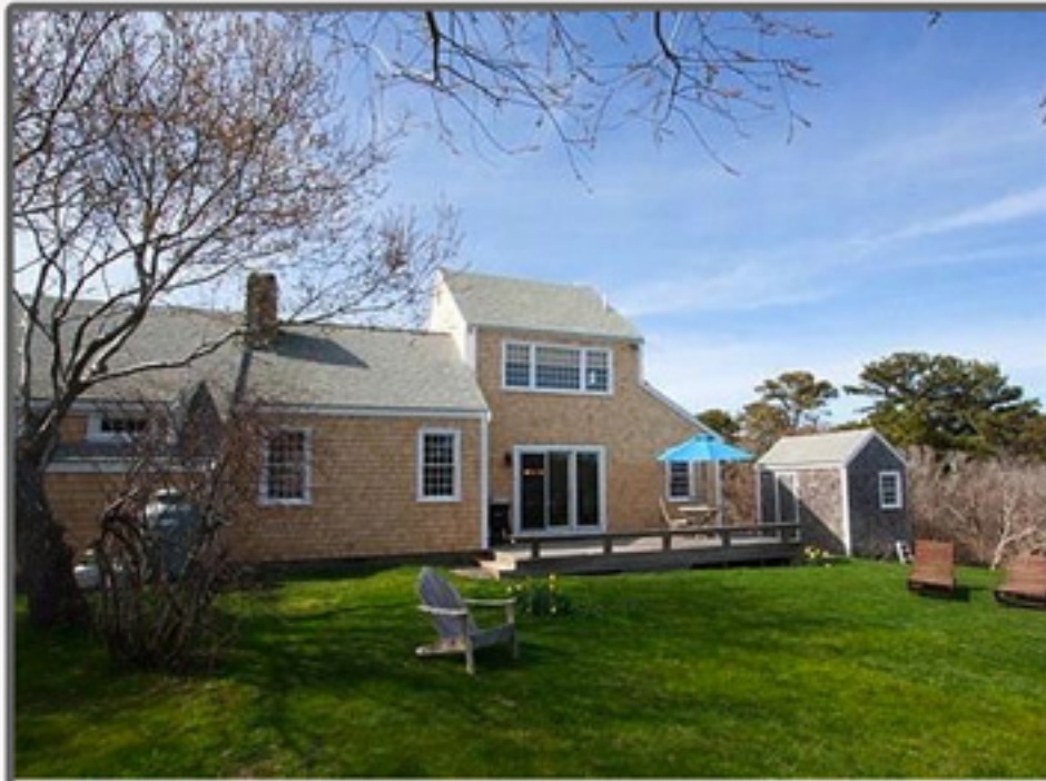
SURFSIDE 11 Okorwaw Ave 4 bed. / 2 baths Weekly Rental: $9,000 - $14,000