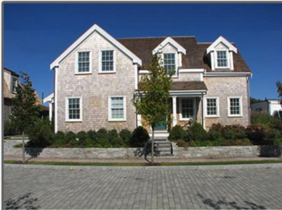
TOWN 12 Ginky Lane 5 bed. / 5.5 baths Weekly Rental: $7,500 - $12,500