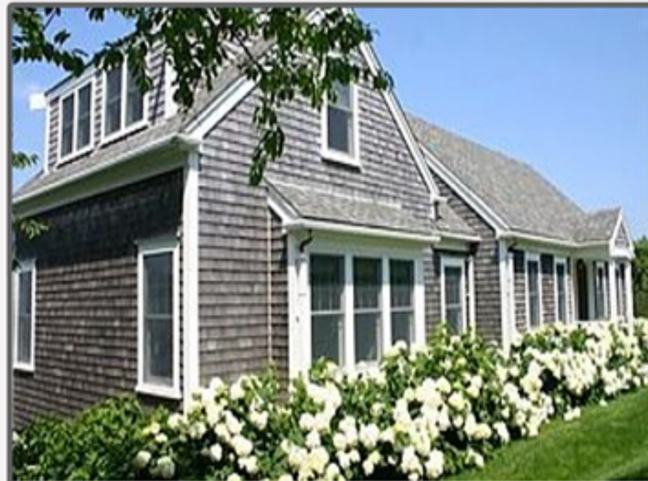
CLIFF 30 Pilgrim Road 4 bed. / 4 baths Weekly Rental: $8,000 - $15,000