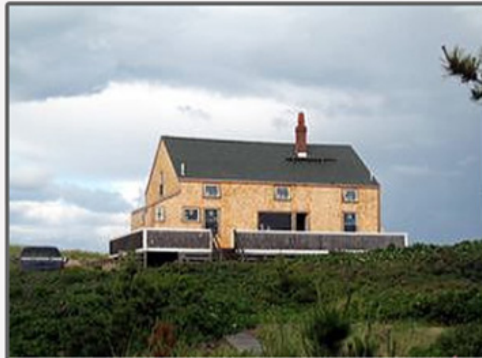
WAUWINET 145 Wauwinet Road 4 bed. / 2.5 bath 2 half Weekly Rental: $7,500