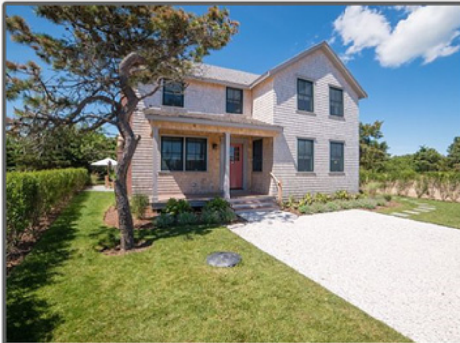
MIACOMET 15 Finback Lane 4 bed. / 4.5 baths Weekly Rental: $8,500