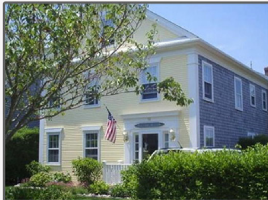
NAUSHOP 14 Goldfinch Drive 3 bed. / 2.5 baths Weekly Rental: $5,000 - $5,500