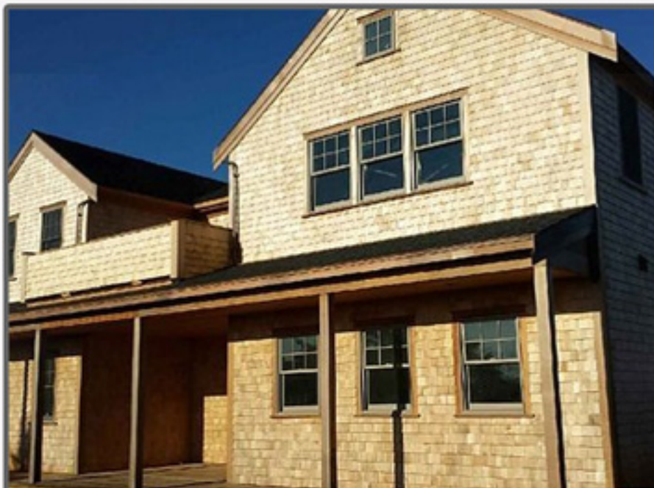
CISCO 13 Swayze's Drive 5 bed. / 5.5 baths Weekly Rental: $6,500 - $12,000