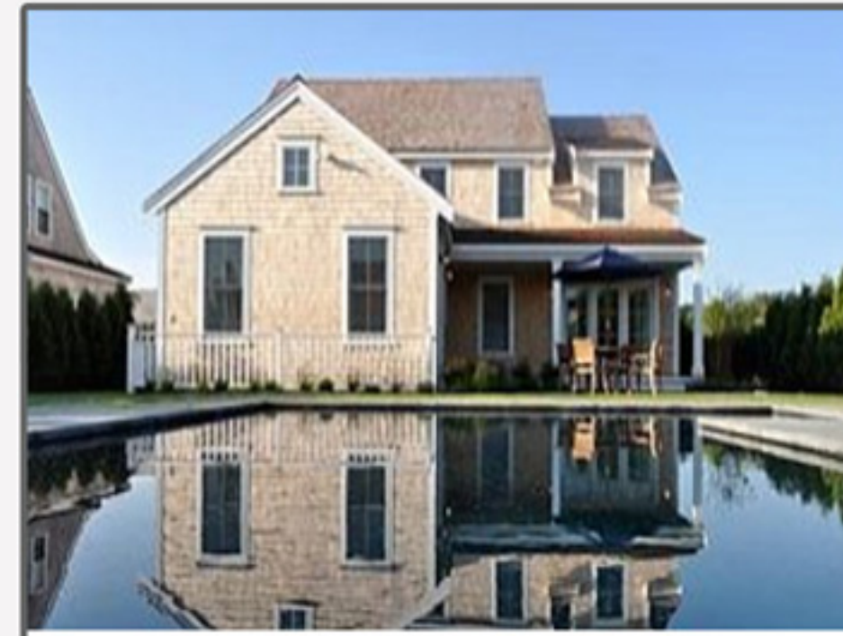
TOWN 18 Madaket Road/11 Hedgebury 6 bed. / 6.5 baths Weekly Rental: $12,500 - $25,000