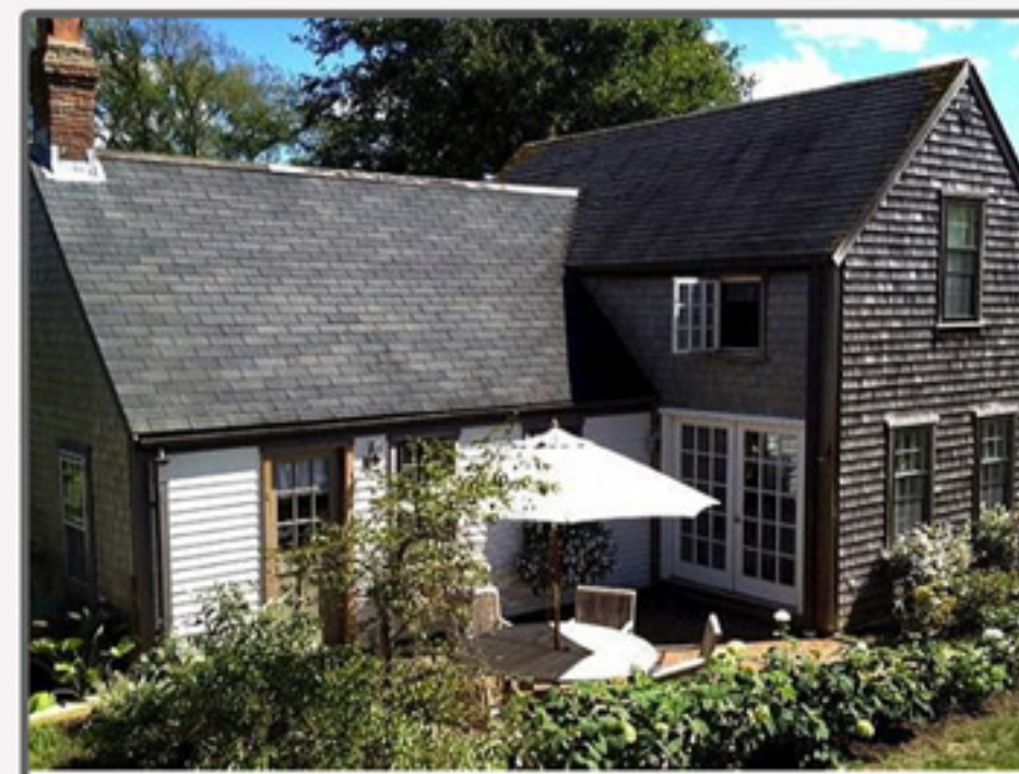
TOWN 6 West York 3 bed. / 2 baths Weekly Rental: $4,000 - $5,500