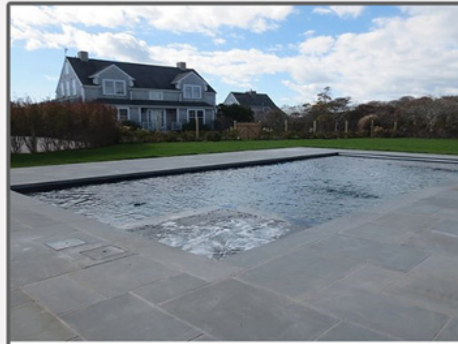
EAST OF TOWN 39 Wigwam Road 4 bed. / 4.5 baths Weekly Rental: $13,500