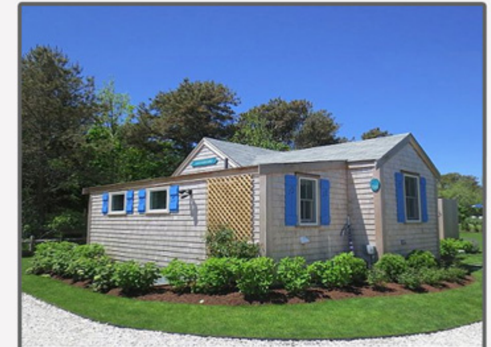
SURFSIDE 73a Hooper Farm Road 3 bed. / 2 baths Weekly Rental: $3,000 - $5,000