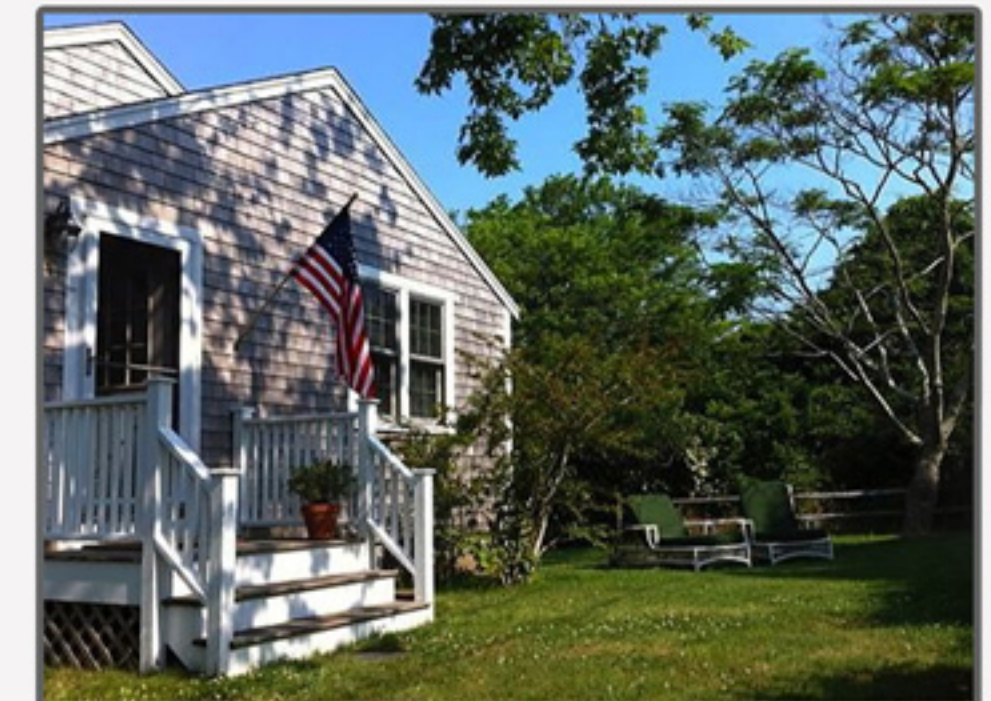
WEST OF TOWN 11 Roberts Lane 2 bed. / 1 baths Weekly Rental: $2,400 - $2,500