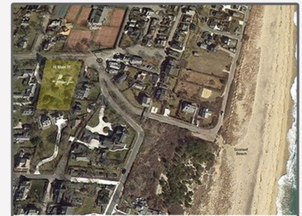
SCONSET 16 Main Street 4 bed. / 3 baths Weekly Rental: $4,000 - $6,500