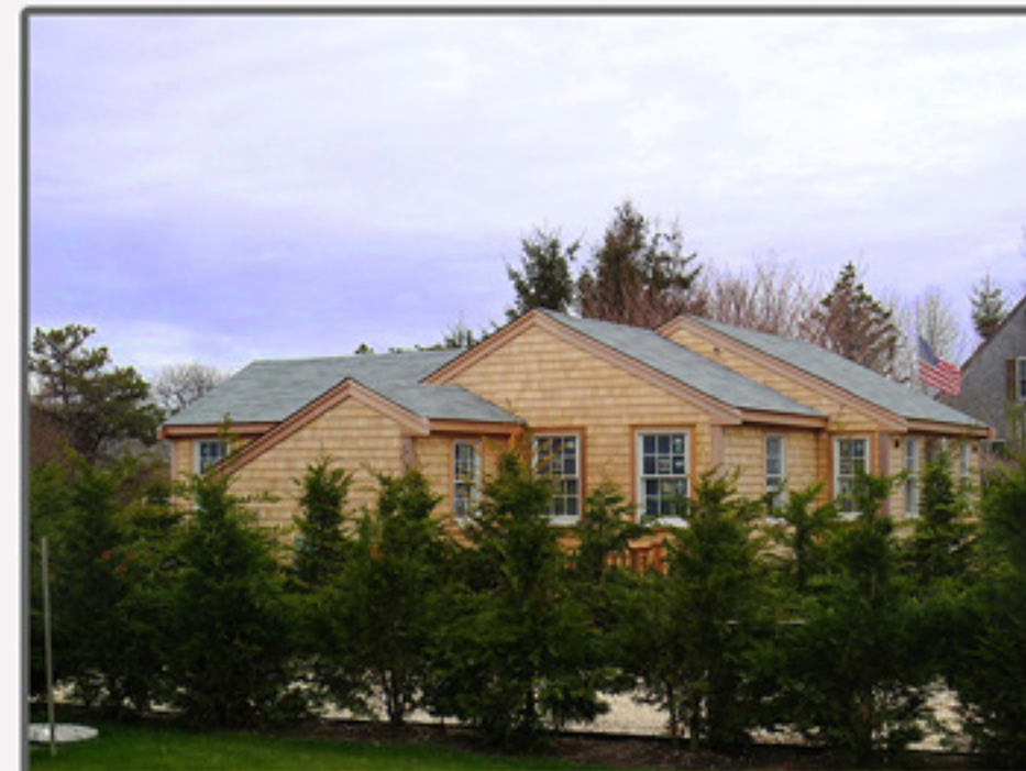
SURFSIDE 73a-front Hooper Farm Road 3 bed. / 3 baths Weekly Rental: $3,000 - $5,000