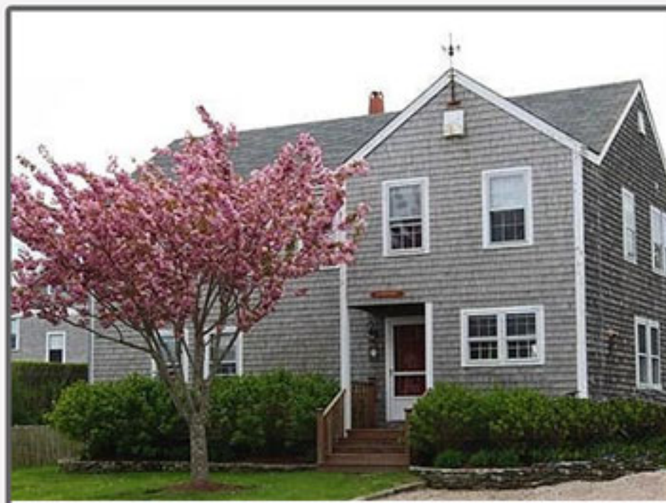
BRANT POINT 4 Swain Street 4 bed. / 3 baths Weekly Rental: $5,800 - $7,500