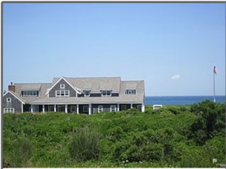
DIONIS 7 N. Swift Rock Road 3 bed. / 3.5 baths Weekly Rental: $17,000