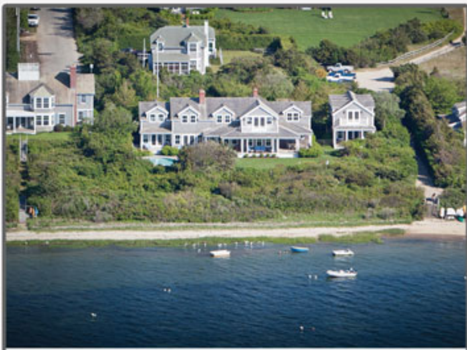
MONOMOY 48 Monomoy Road 6 bed. / 7.5 baths Weekly Rental: $50,000