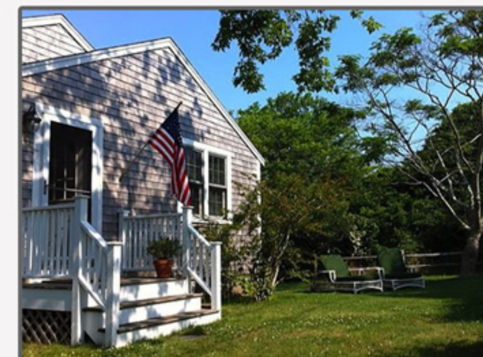
WEST OF TOWN 11 Roberts Lane 2 bed. / 1 baths Weekly Rental: $2,400 - $2,500