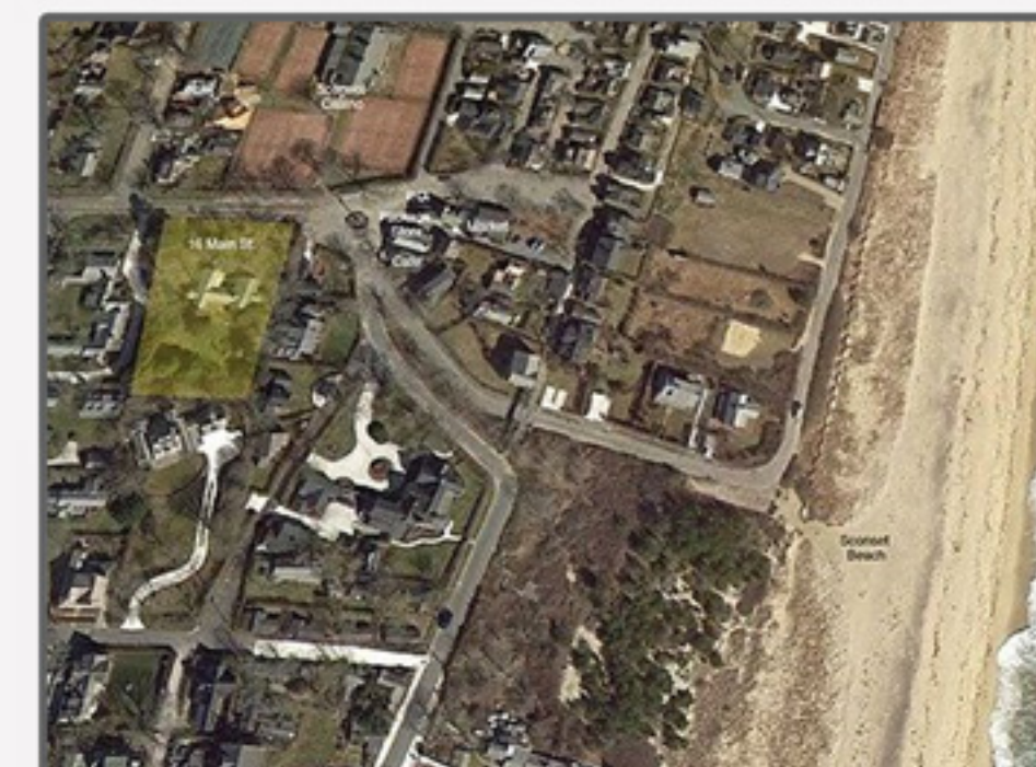
SCONSET 16 Main Street 4 bed. / 3 baths Weekly Rental: $4,000 - $6,500