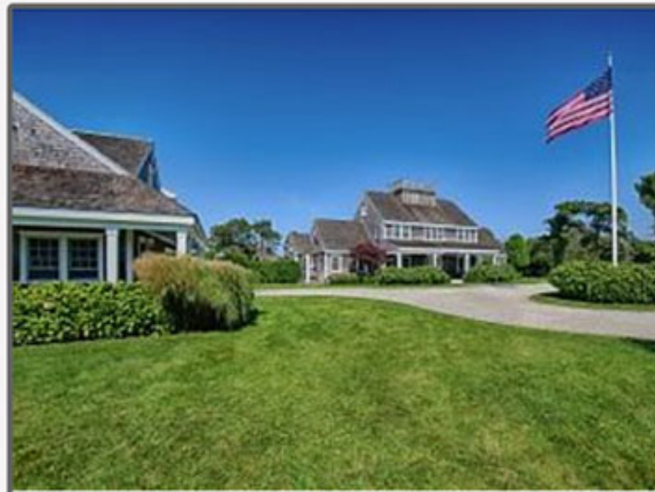
SURFSIDE 6 Pochick Ave 5 bed. / 4.5 baths Weekly Rental: $15,000 - $22,500