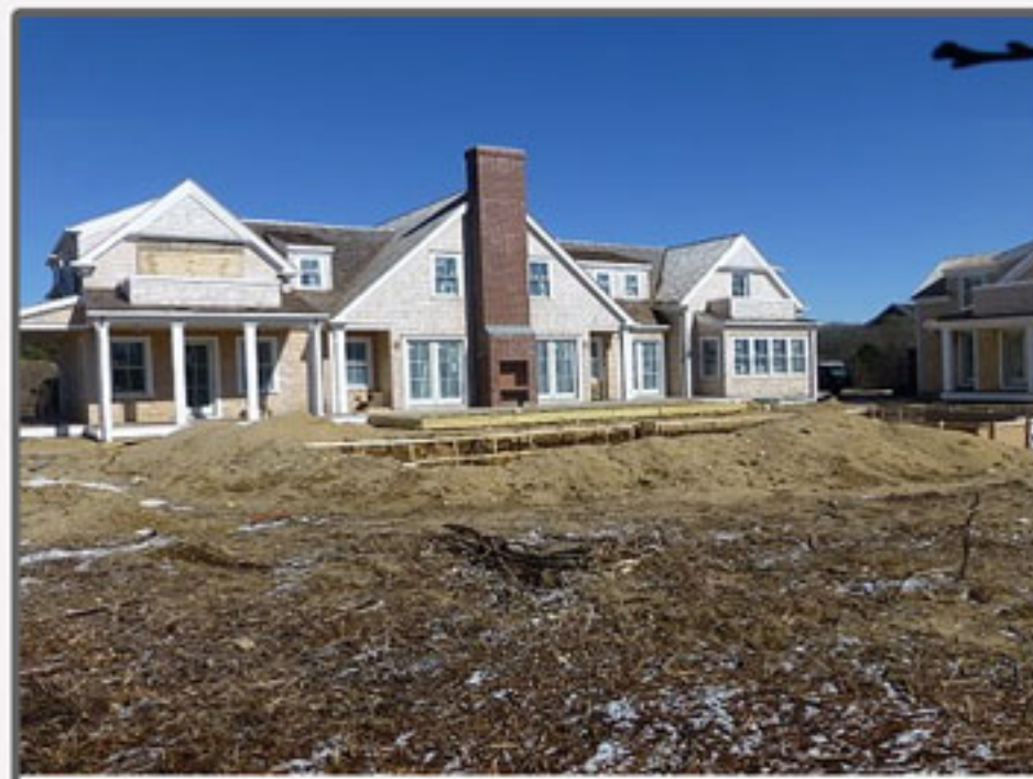
SURFSIDE 21 Woodbine 7 bed. / 6.5 baths Weekly Rental: $17,500 - $27,500