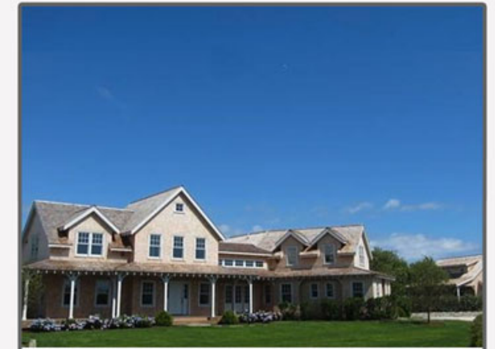
CLIFF 14 Old Westmoor Farm 6 bed. / 5.5 baths Weekly Rental: $10,000 - $30,000