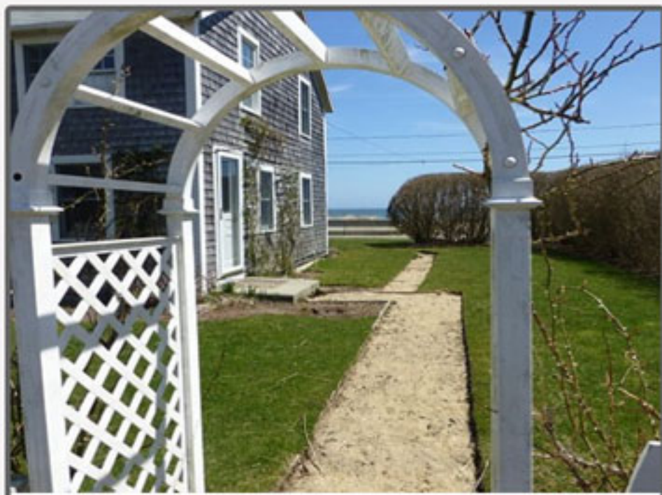
SCONSET 34 Codfish Park 5 bed. / 2.5 baths Weekly Rental: $7,000 - $7,500