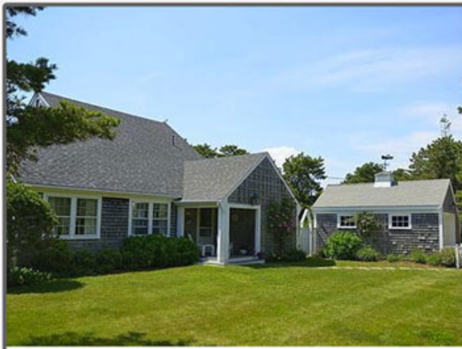
SURFSIDE 14 Clifford Street 4 bed. / 3 baths Weekly Rental: $5,000 - $7,500