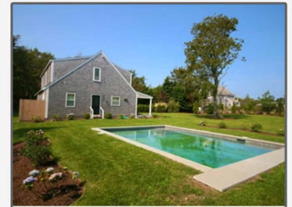
CISCO 6 Oak Hollow Lane 4 bed. / 3 baths Weekly Rental: $12,000