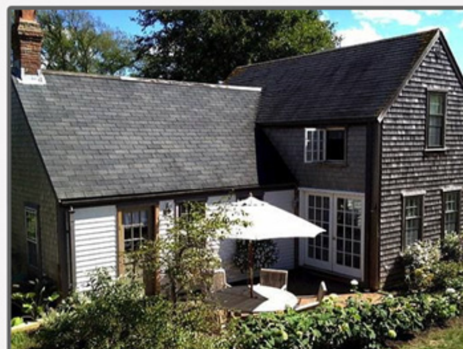
TOWN 6 West York 3 bed. / 2 baths Weekly Rental: $4,000 - $5,500