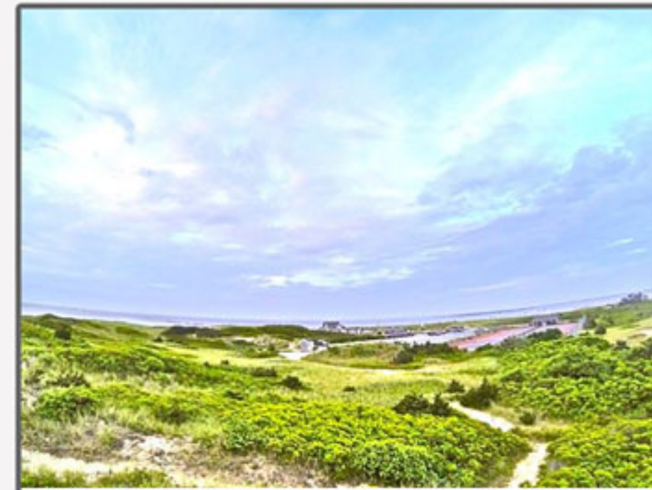
BRANT POINT 33 Jefferson Ave 8 bed. / 8.5 baths Weekly Rental: $10,000 - $45,000