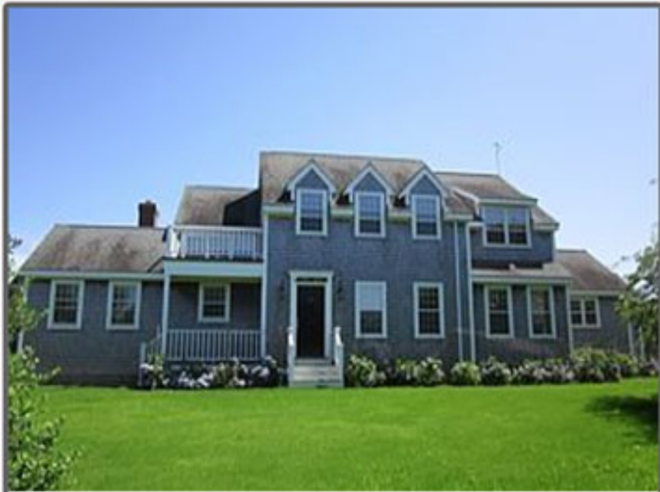
CISCO 4 Wamasquid Place 6 bed. / 4.5 baths Weekly Rental: $15,000