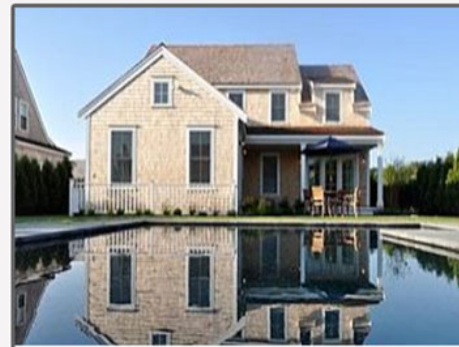
TOWN 18 Madaket Road/11 Hedgebury 6 bed. / 6.5 baths Weekly Rental: $12,500 - $25,000