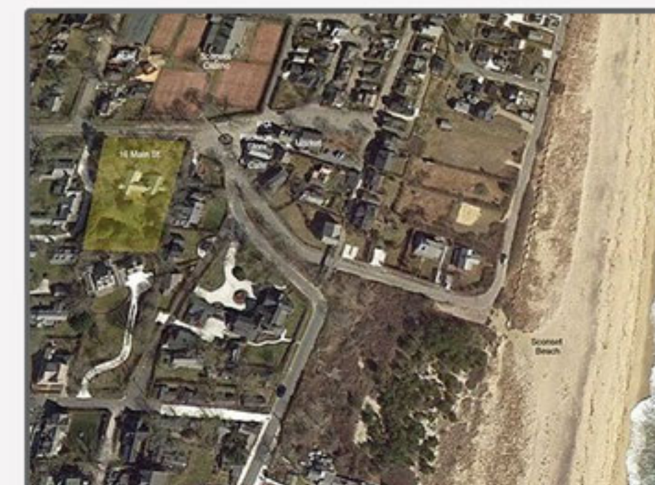
SCONSET 16 Main Street 4 bed. / 3 baths Weekly Rental: $4,000 - $6,500