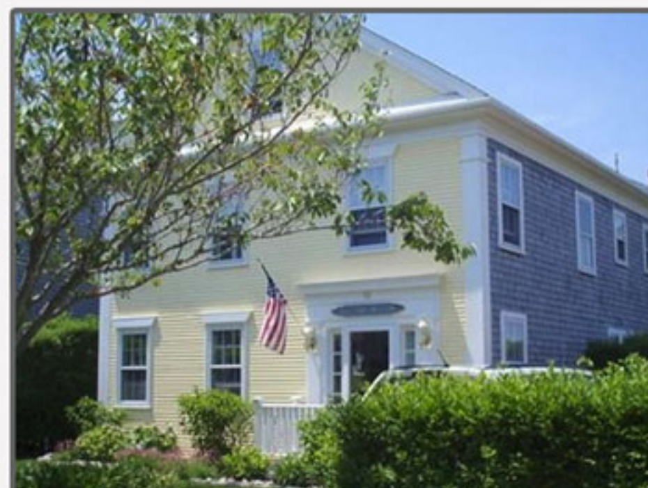
NAUSHOP 14 Goldfinch Drive 3 bed. / 2.5 baths Weekly Rental: $3,500 - $5,000