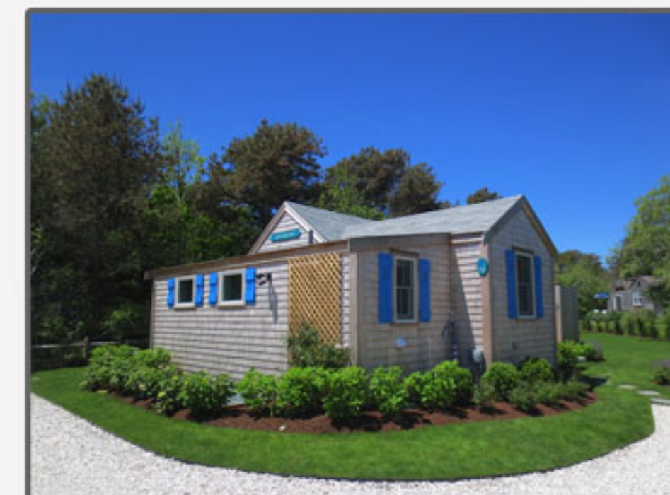
SURFSIDE 73a Hooper Farm Road 3 bed. / 2 baths Weekly Rental: $3,000 - $5,000