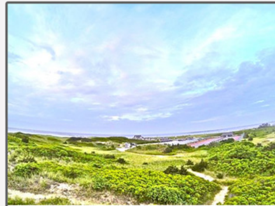
BRANT POINT 33 Jefferson Ave 8 bed. / 8.5 baths Weekly Rental: $10,000 - $45,000