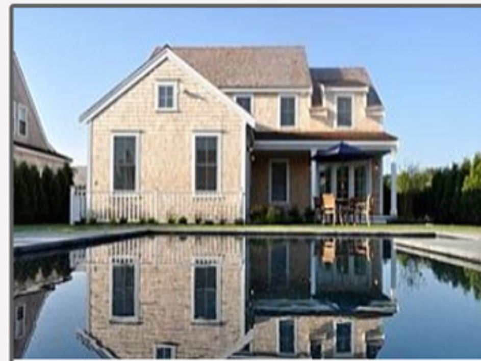
TOWN 18 Madaket Road/11 Hedgebury 6 bed. / 6.5 baths Weekly Rental: $12,500 - $25,000