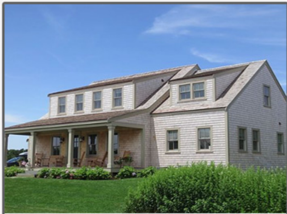
CISCO 19 Nanahumacke Lane 4 bed. / 4.5 baths Weekly Rental: $8,000 - $13,000