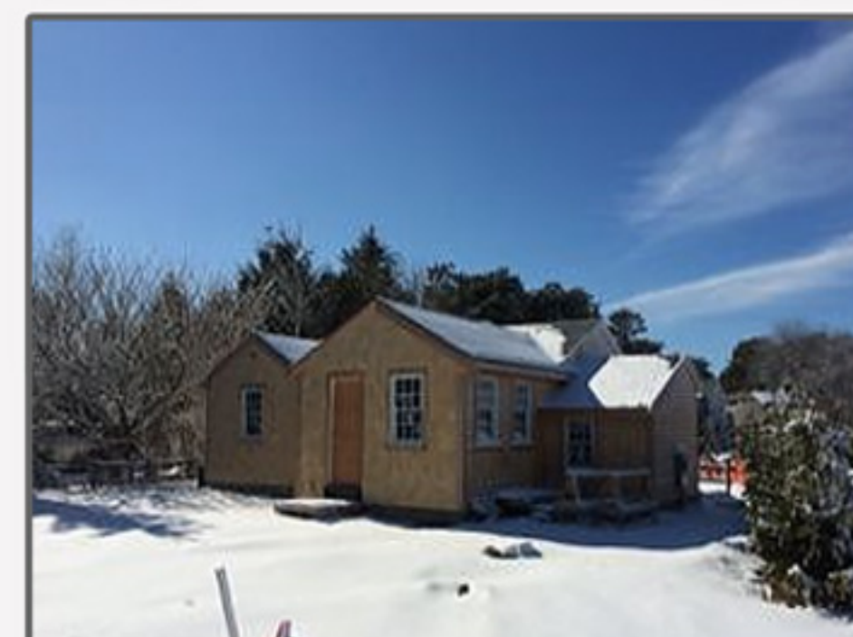
SURFSIDE 73a-front Hooper Farm Road 3 bed. / 3 baths Weekly Rental: $2,000