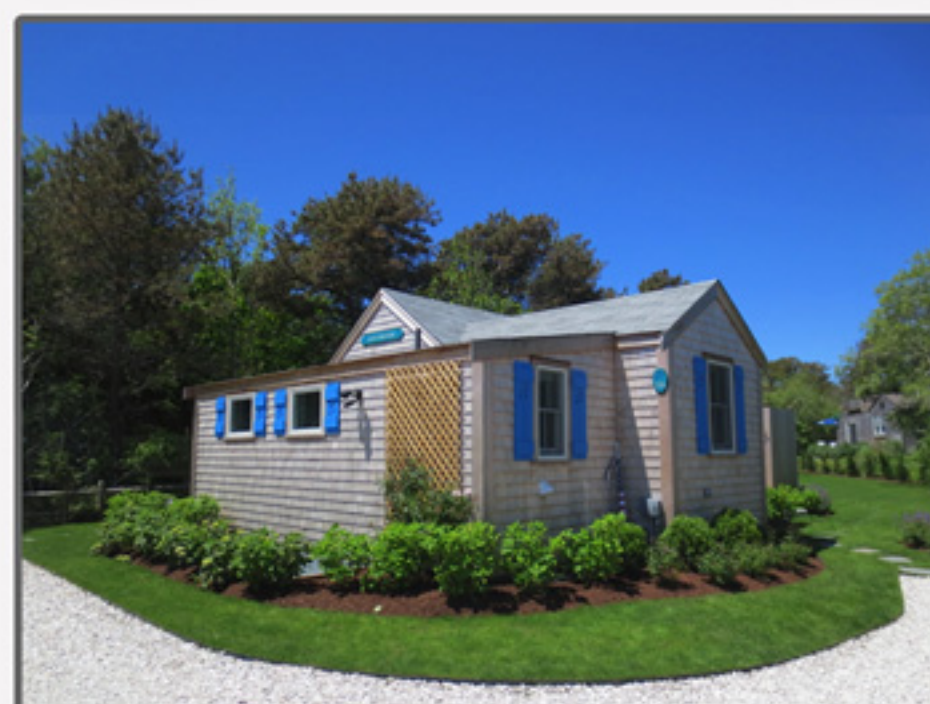
SURFSIDE 73a Hooper Farm Road 3 bed. / 2 baths Weekly Rental: $2,000 - $4,500