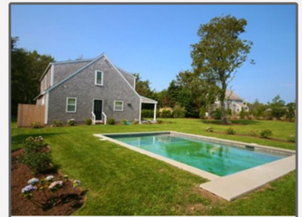
CISCO 6 Oak Hollow Lane 4 bed. / 3 baths Weekly Rental: $12,000