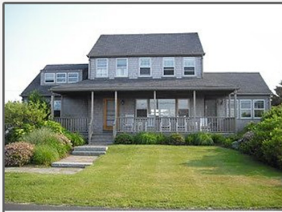
TOWN 12 Hulbert Avenue 5 bed. / 2 baths Weekly Rental: $7,500