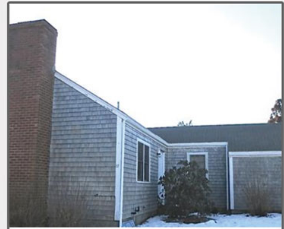
WEST OF TOWN 27a Meadow View Drive $550,000