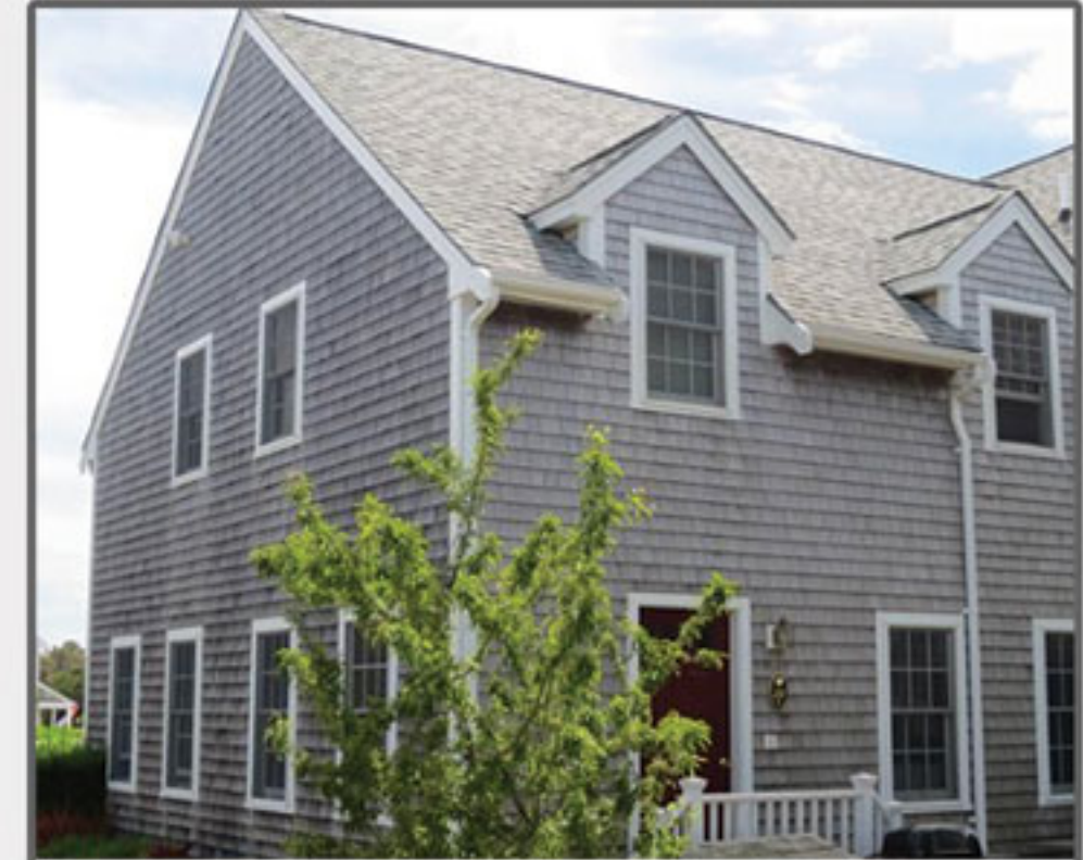
MID ISLAND 20 A Park Circle $479,900