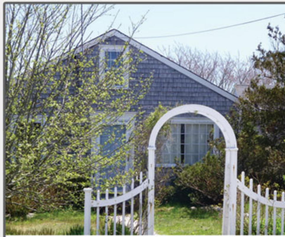
TOWN 10.5 Cherry Street $695,000