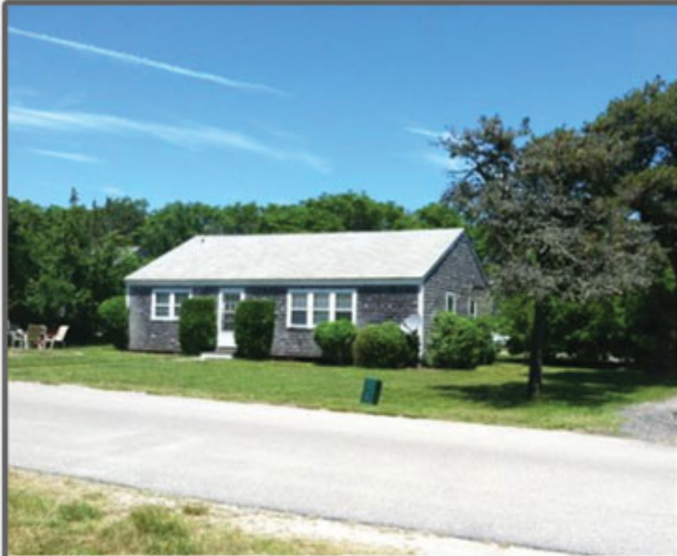
WEST OF TOWN Mid Island $549,000