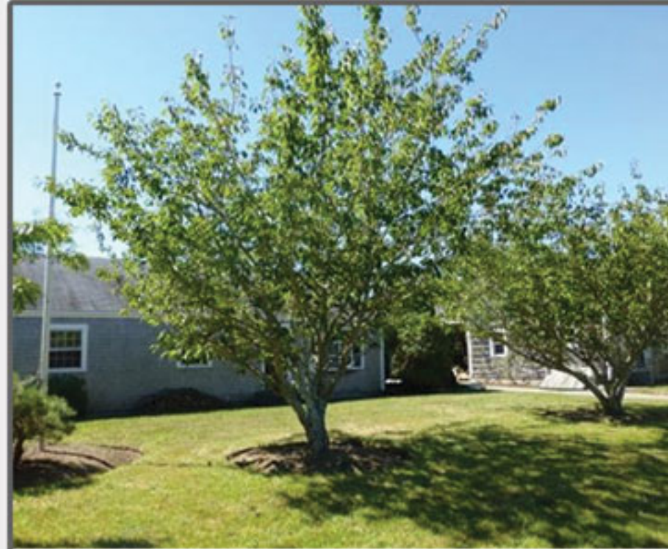
MID ISLAND 1 Thurstons Way $599,000