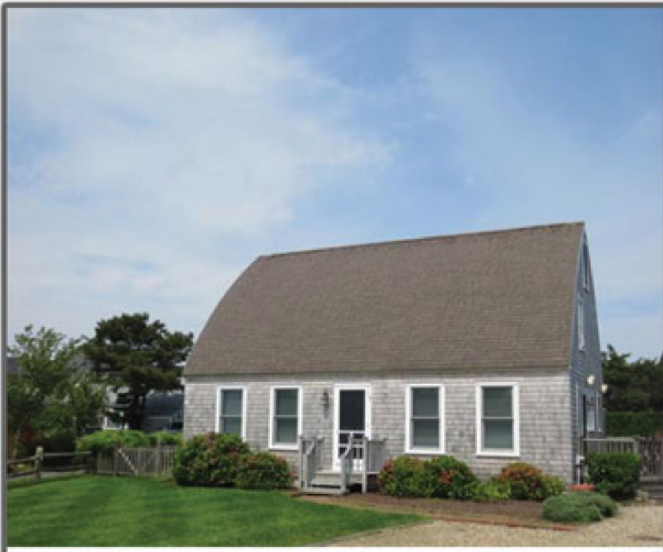
MIACOMET 5B Green Meadows Lane $749,000