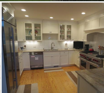
11 Aurora Way • Hummock Pond