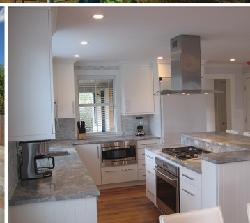
9 Finback Lane • South Of Town