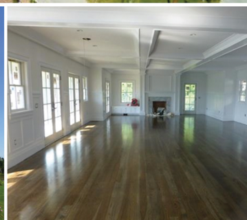
20 Giny Lane • Town