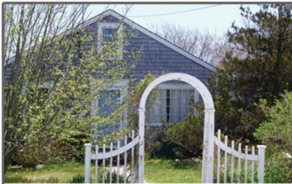
TOWN 10.5 Cherry Street $695,000