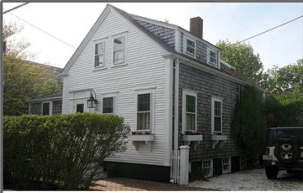
TOWN 3 West Dover Street $1,495,000