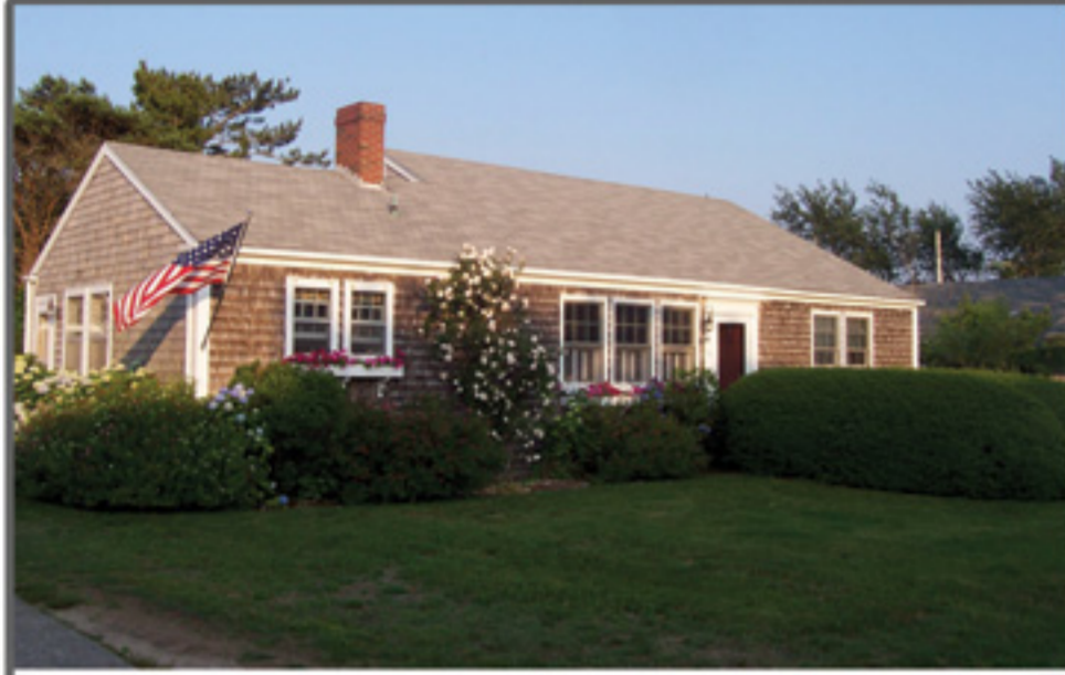
CLIFF 3 Delaney $1,295,000