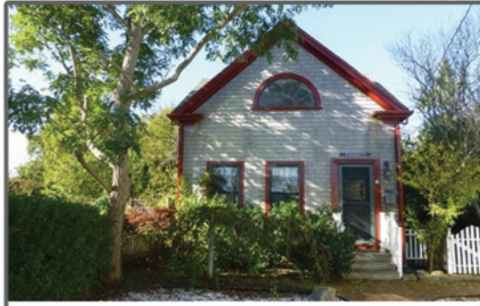
TOWN 3 Cottage Court $1,450,000