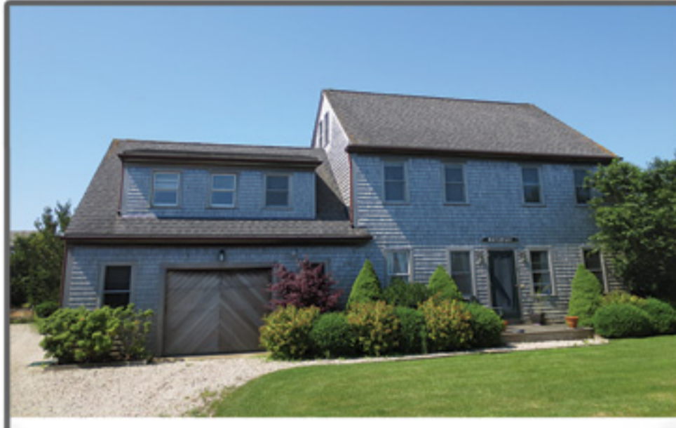
MIACOMET 11 Swayze Drive $945,000