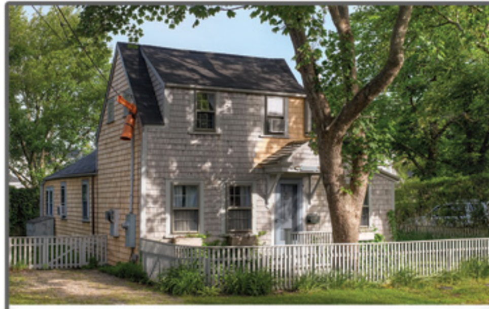
TOWN 1 Joy Street $845,000