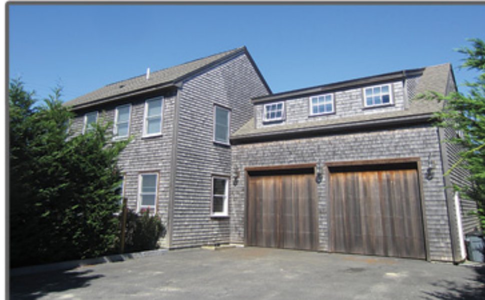
MID ISLAND 2 Cynthia Lane $759,000