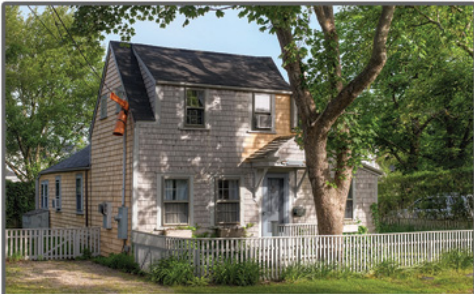
TOWN 1 Joy Street $845,000