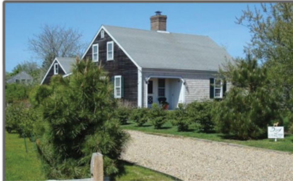
HUMMOCK POND 52 Meadow View Drive $1,150,000