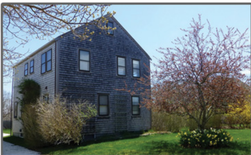
TOM NEVERS 20 Arlington Street $675,000