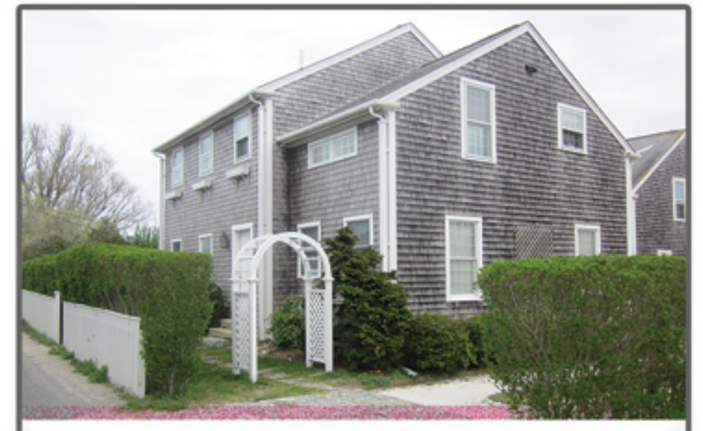
TOWN 6.5 Cherry Street $1,395,000