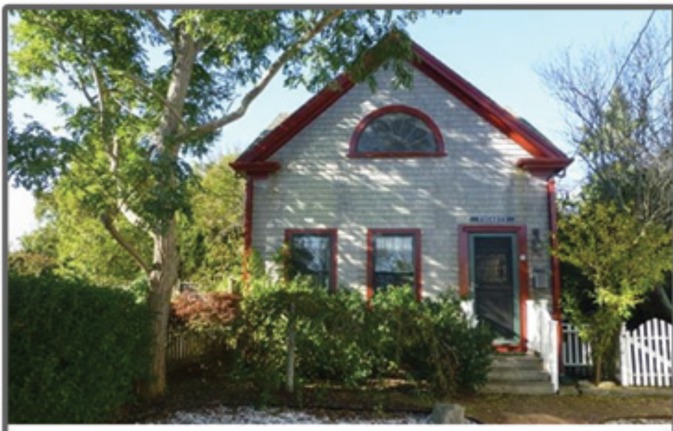
TOWN 3 Cottage Court $1,450,000