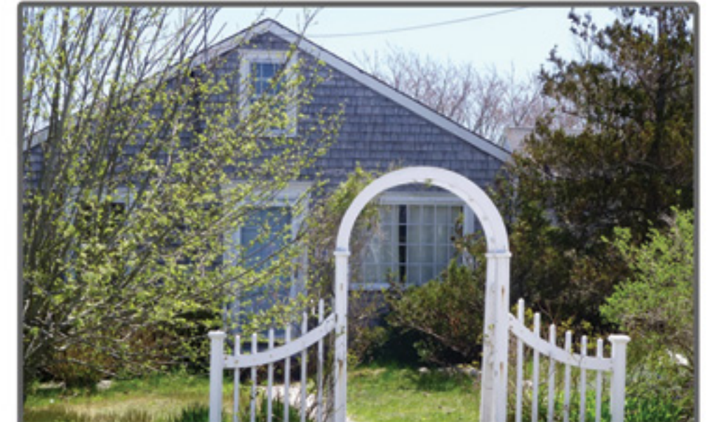
TOWN 10.5 Cherry Street $695,000