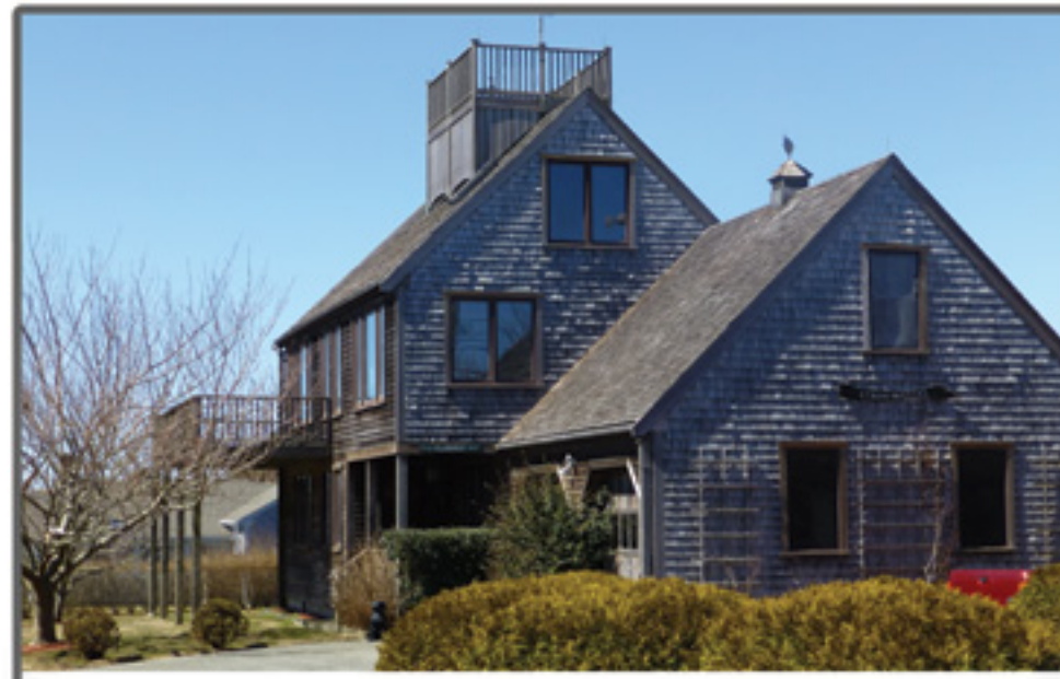
SCONSET 44 Sankaty Road $1,395,000