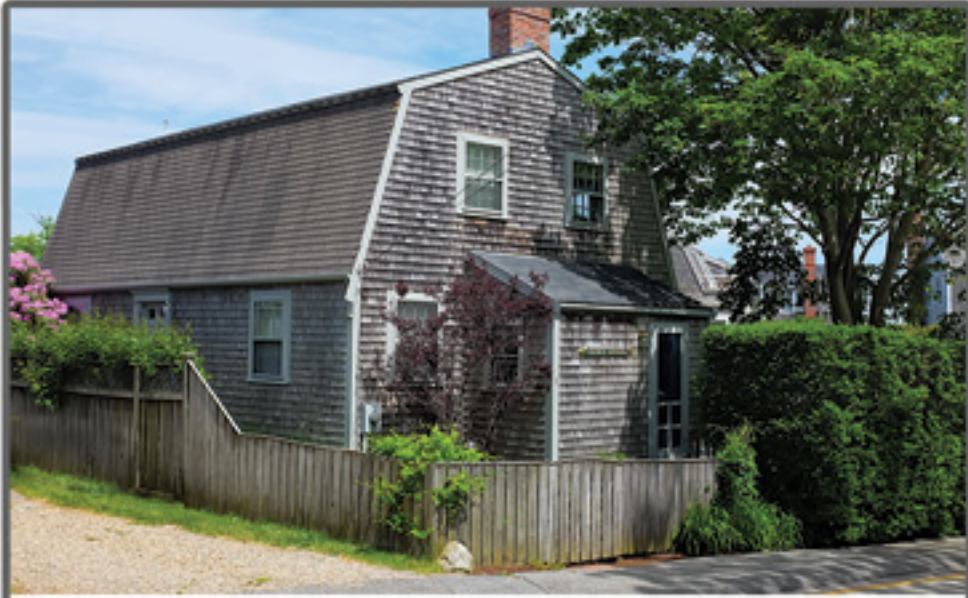
SCONSET 1 Gully Road $1,199,000