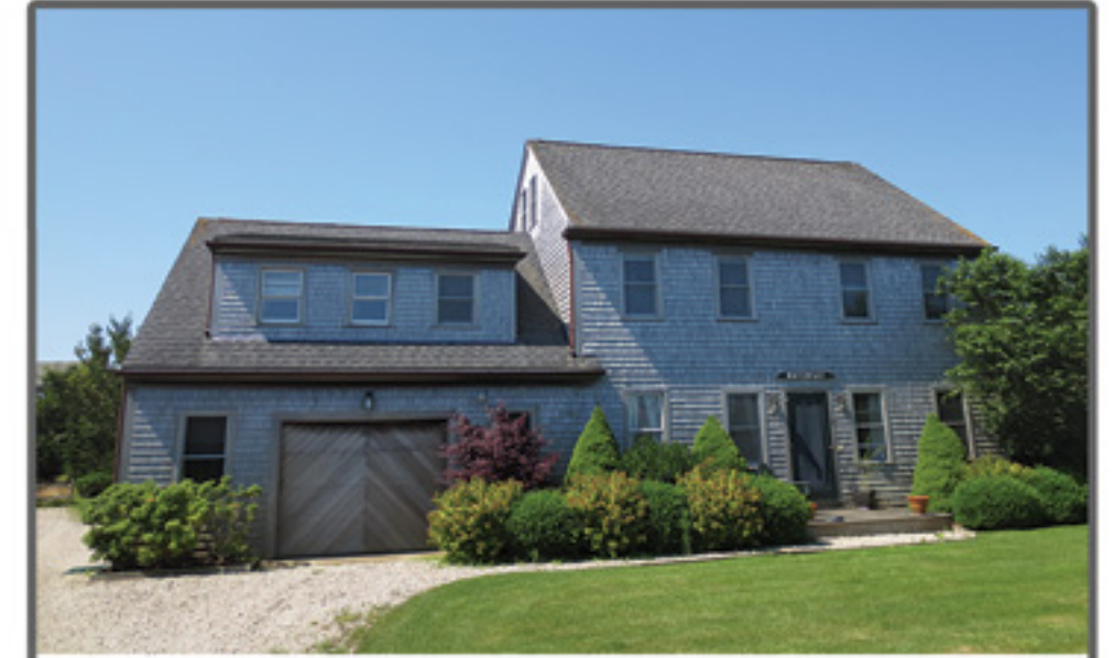
MIACOMET 11 Swayze Drive $945,000