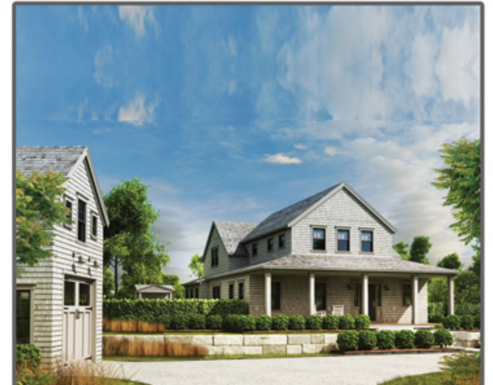
CLIFF 4 Old Westmoor Farm $4,995,000