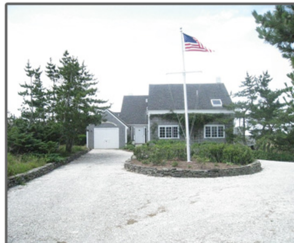
MADAKET 25 Starbuck Road $4,500,000