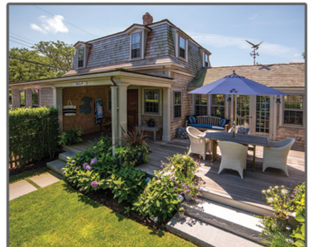
CLIFF 8 Mooers Avenue $3,495,000