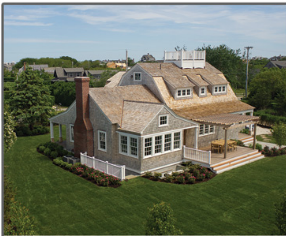
CLIFF 108 Cliff Road $4,695,000