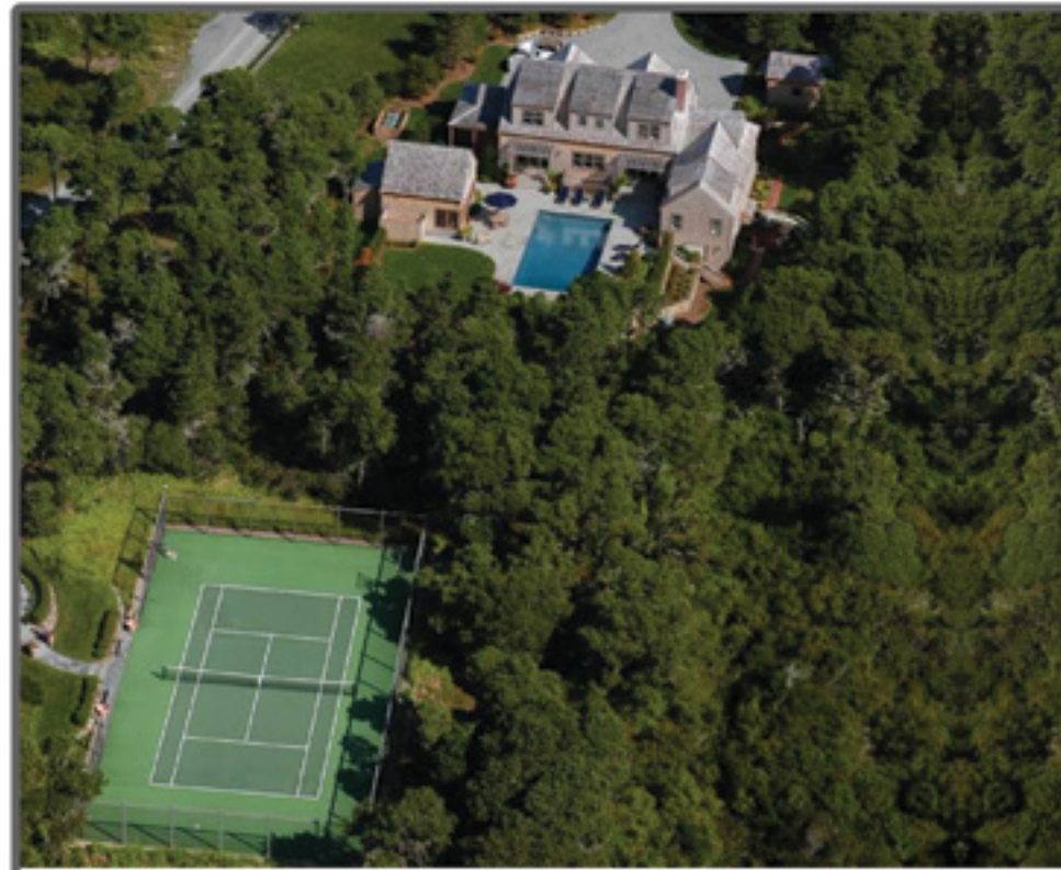
SURFSIDE 3 Pochick Avenue $5,695,000