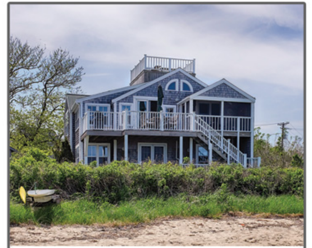
TOWN 26 Washington Street $5,895,000