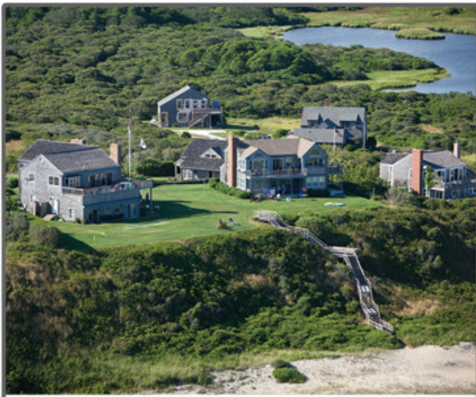
TOM NEVERS HEAD 1 & 3 Elliott's Way $11,990,000