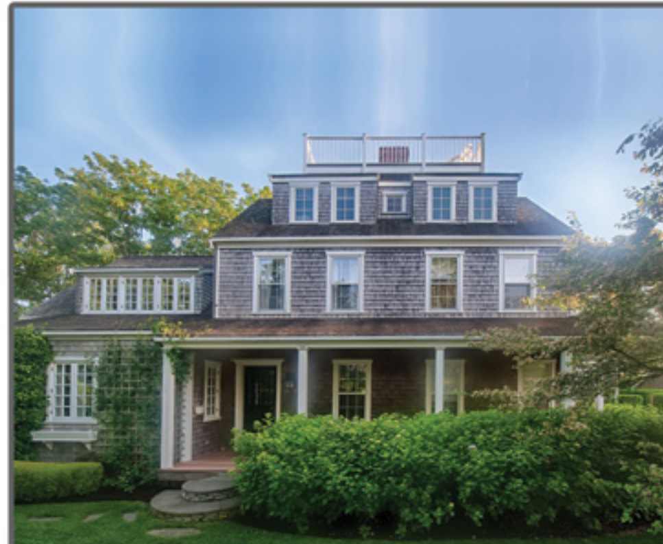
CLIFF 5 Kite Hill Lane $5,495,000