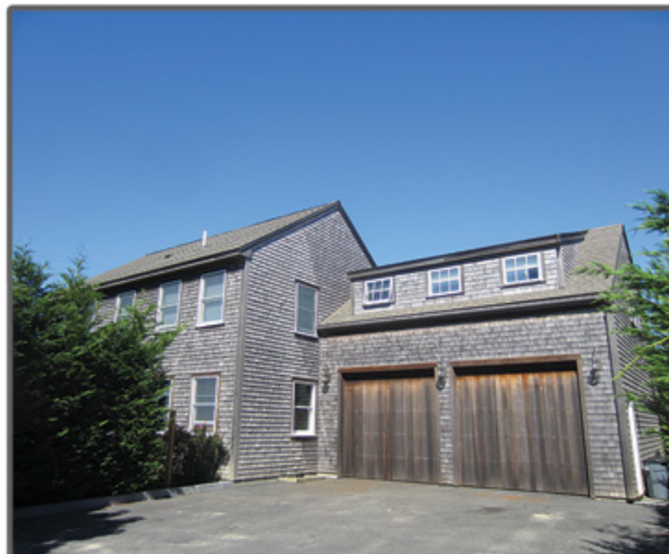
MID ISLAND 2 Cynthia Lane $759,000