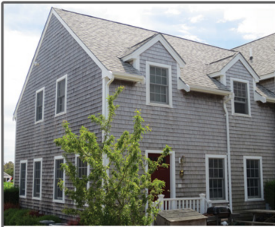
MID ISLAND 20a Park Circle $499,900