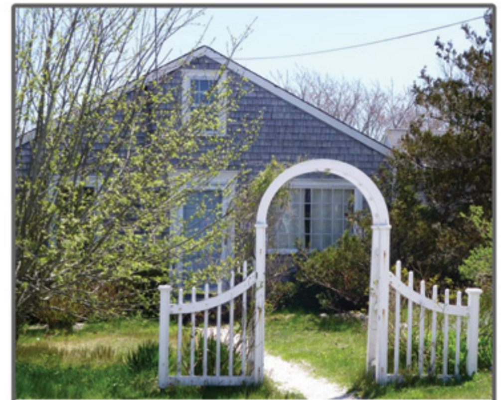
TOWN 10.5 Cherry Street $695,000