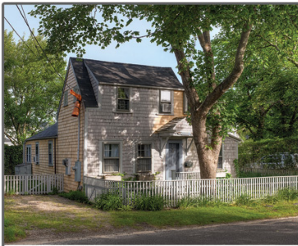
TOWN 1 Joy Street $845,000