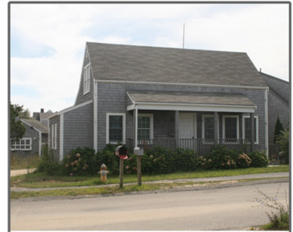
SURFSIDE 61 Surfside Road $499,000