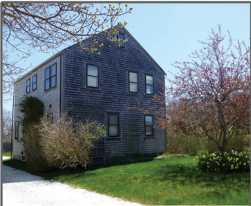
TOM NEVERS 20 Arlington Street $675,000