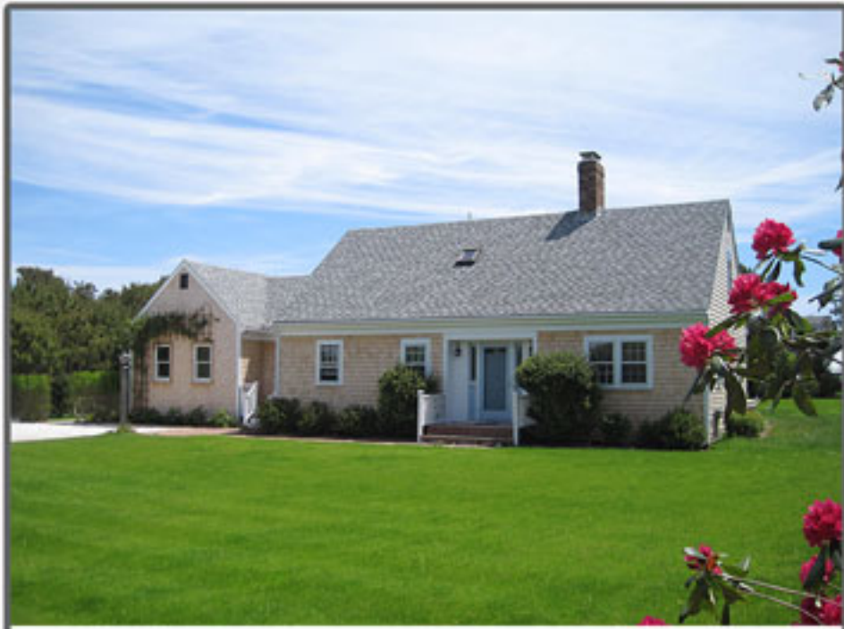
SURFSIDE 132 Surfside Road 4 bed. / 3.5 baths Weekly Rental: $5,000 - $7,500