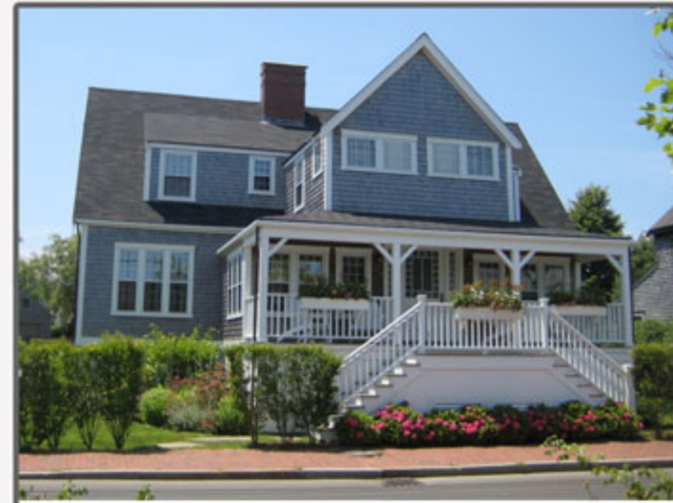
BRANT POINT 1 Dolphin Court 5 bed. / 5.5 baths Weekly Rental: $7,700 - $12,000