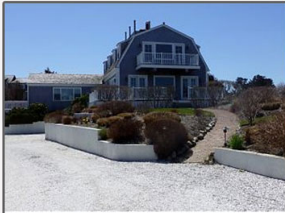
QUAISE 30 Bassett Road 3 bed. / 3.5 baths Weekly Rental: $7,000 - $7,500