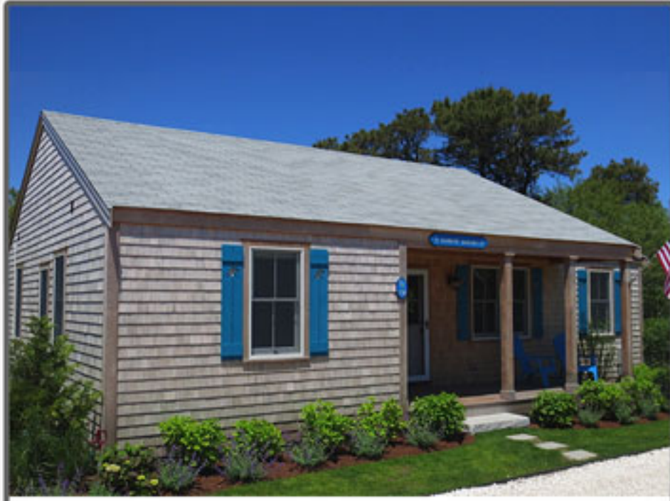
SURFSIDE 73b Hooper Farm Road 4 bed. / 2.5 baths Weekly Rental: $5,000