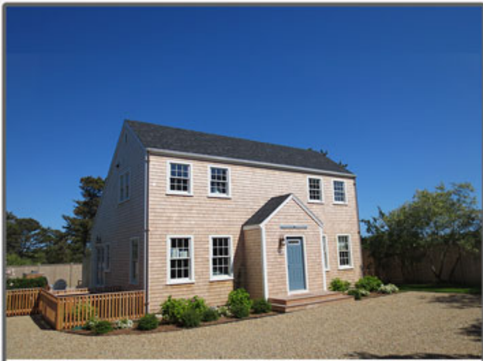
MID-ISLAND 38 Surfside Road 6 bed. / 3 baths Weekly Rental: $5,200 - $6,500