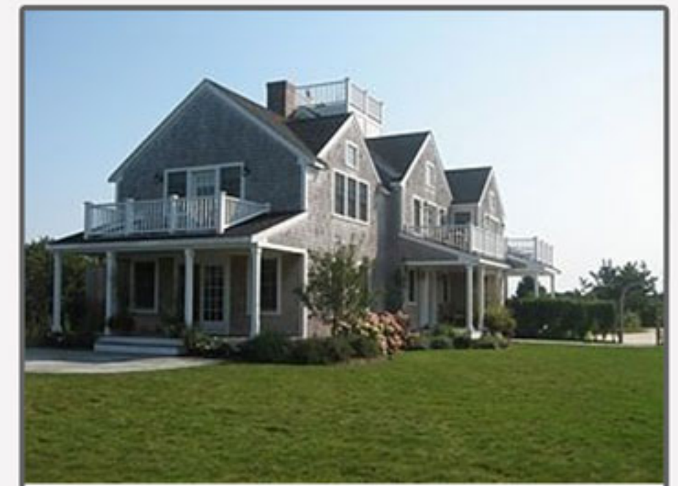
SURFSIDE 12 Pequot St 4 bed. / 5 baths Weekly Rental: $10,000