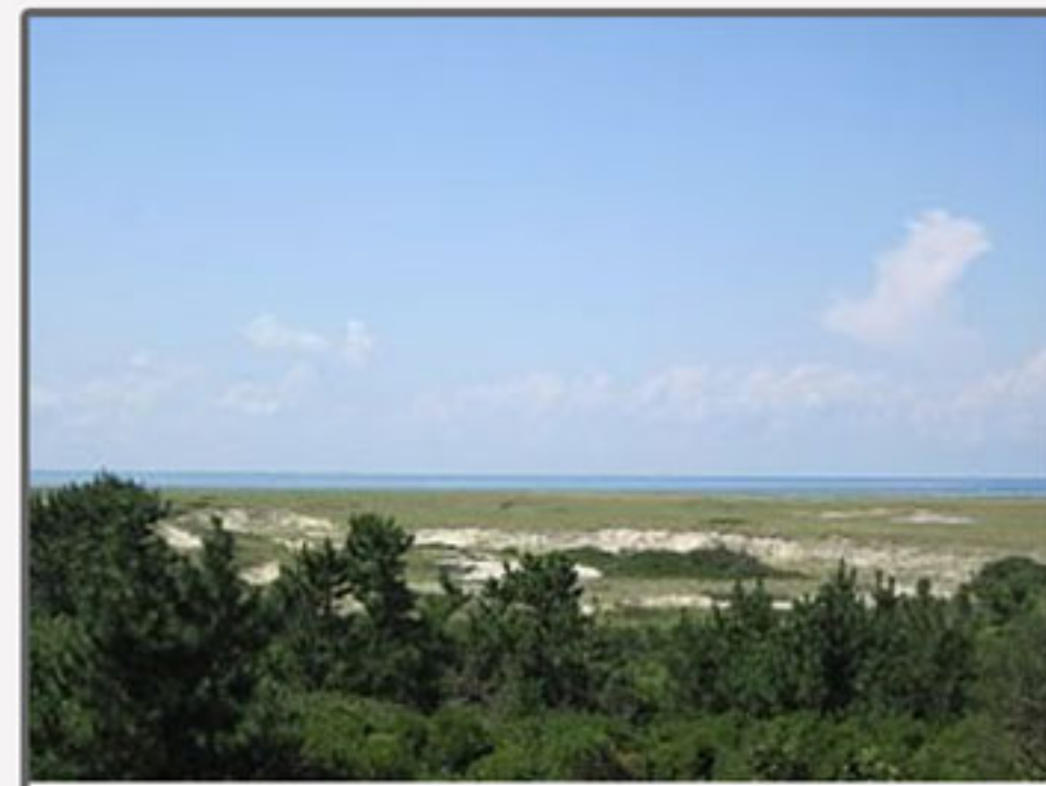
DIONIS 4 Lavendar Lane 6 bed. / 3.5 baths Weekly Rental: $10,000 - $12,000