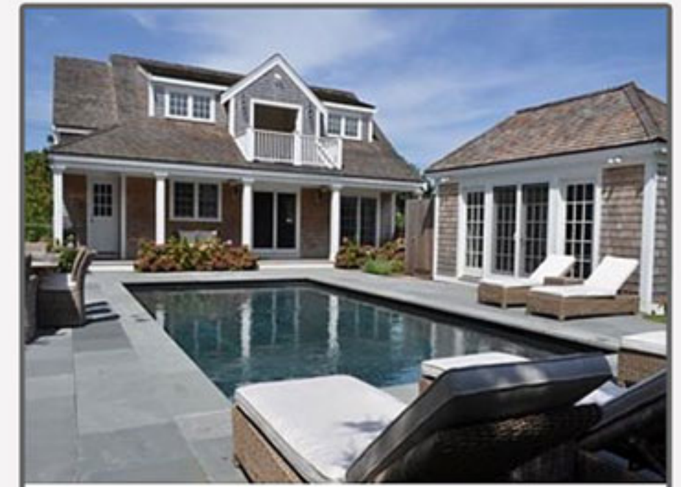
TOWN 15 Hedgebury/20a Madaket 4 bed. / 4.5 baths Weekly Rental: $8,000 - $15,000