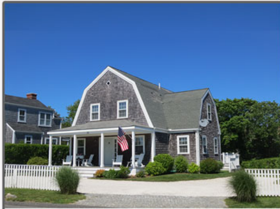
TOWN 62 Prospect Street 7 bed. / 4 baths Weekly Rental: $5,500 - $7,000