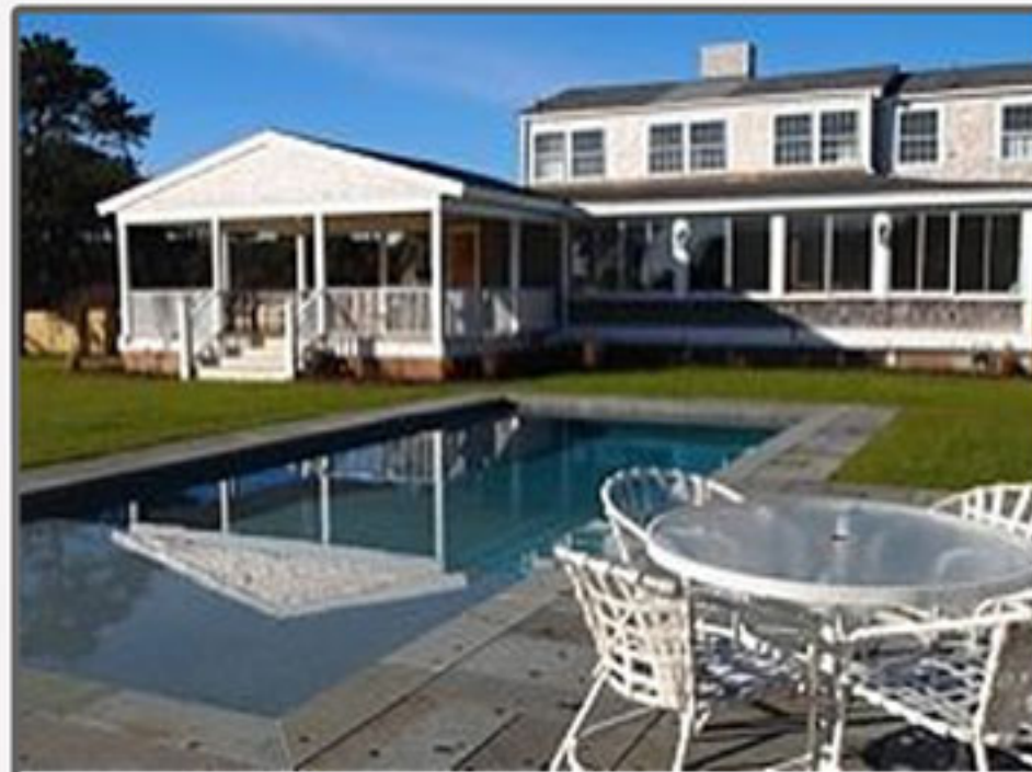
SURFSIDE 144 Surfside Road 8 bed. / 5 baths Weekly Rental: $14,000 - $22,000