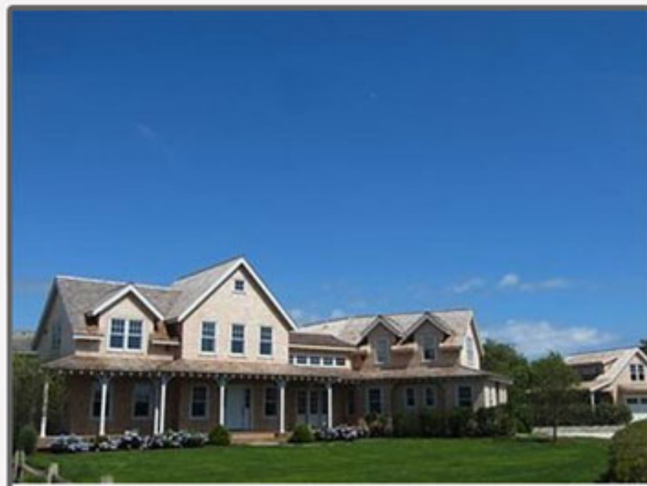
CLIFF 14 Old Westmoor Farm 6 bed. / 5.5 baths Weekly Rental: $30,000