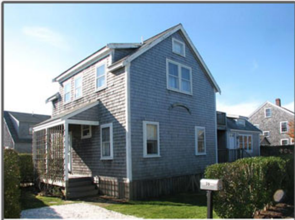
BRANT POINT 36 Walsh Street 4 bed. / 2.5 baths Weekly Rental: $6,000 - $7,000