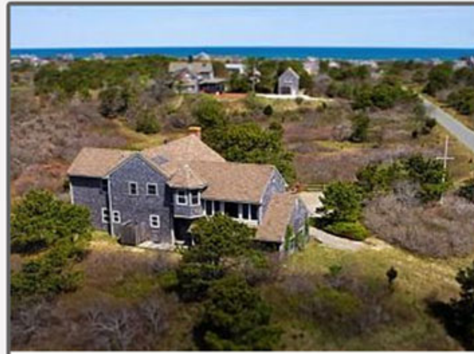
DIONIS 19 Bishops Rise 4 bed. / 3.5 baths Weekly Rental: $11,000 - $13,000