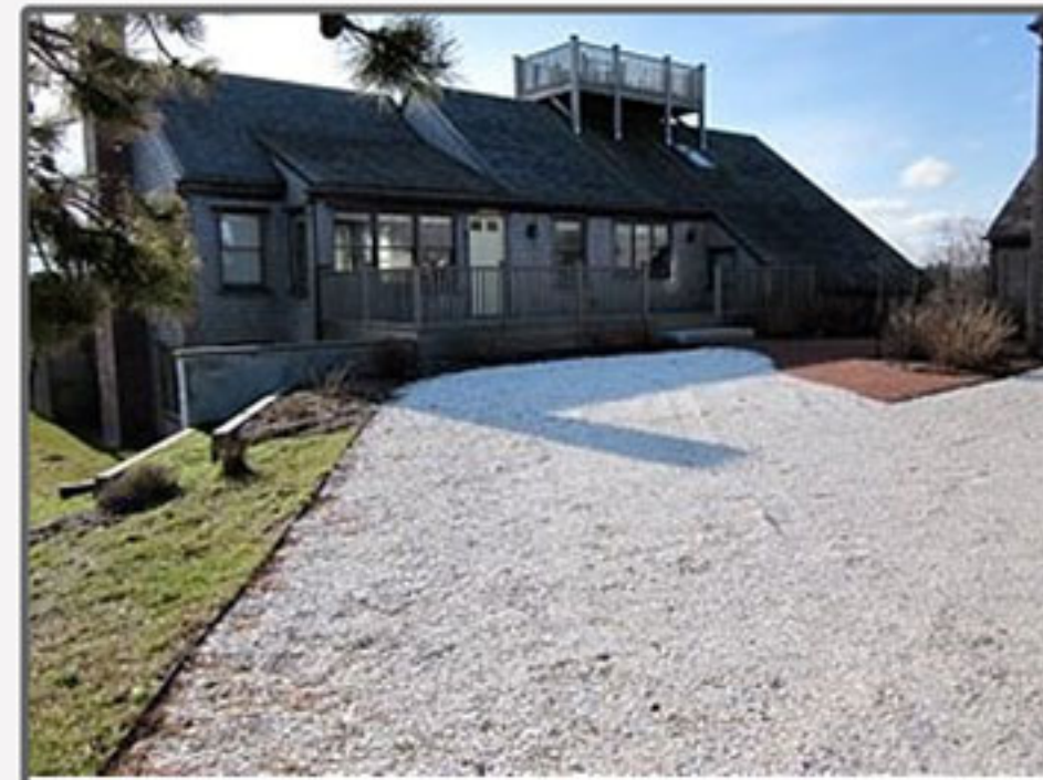
MADAKET 8 Midland Ave 6 bed. / 7 baths Weekly Rental: $8,500