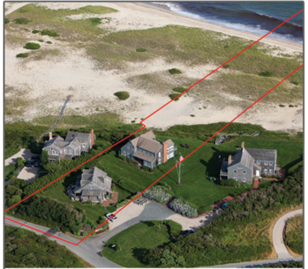
TOM NEVERS 3 Elliott's Way