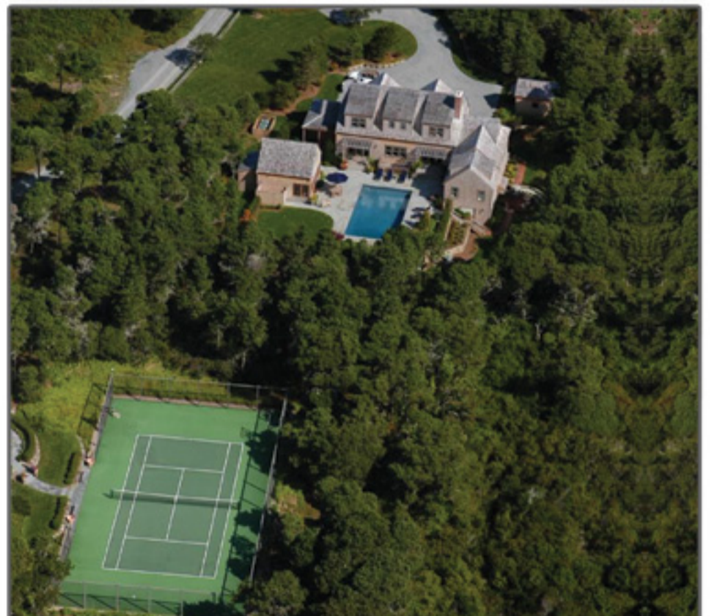
SURFSIDE 3 Pochick Avenue