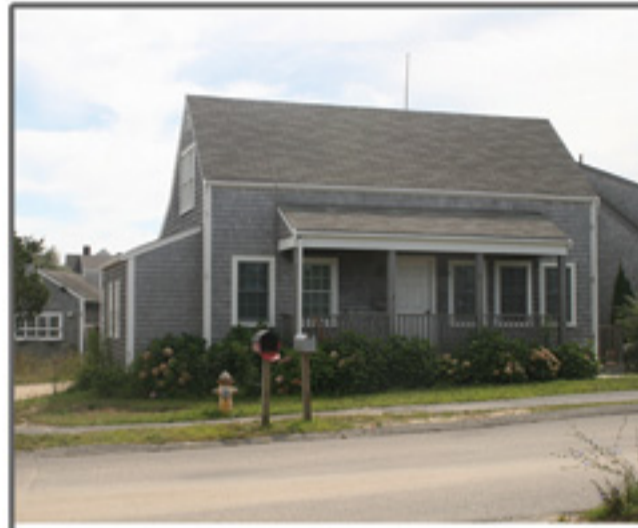
SURFSIDE 61 Surfside Road $499,000