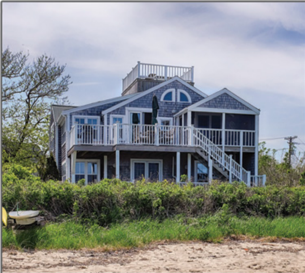
TOWN 26 Washington Street