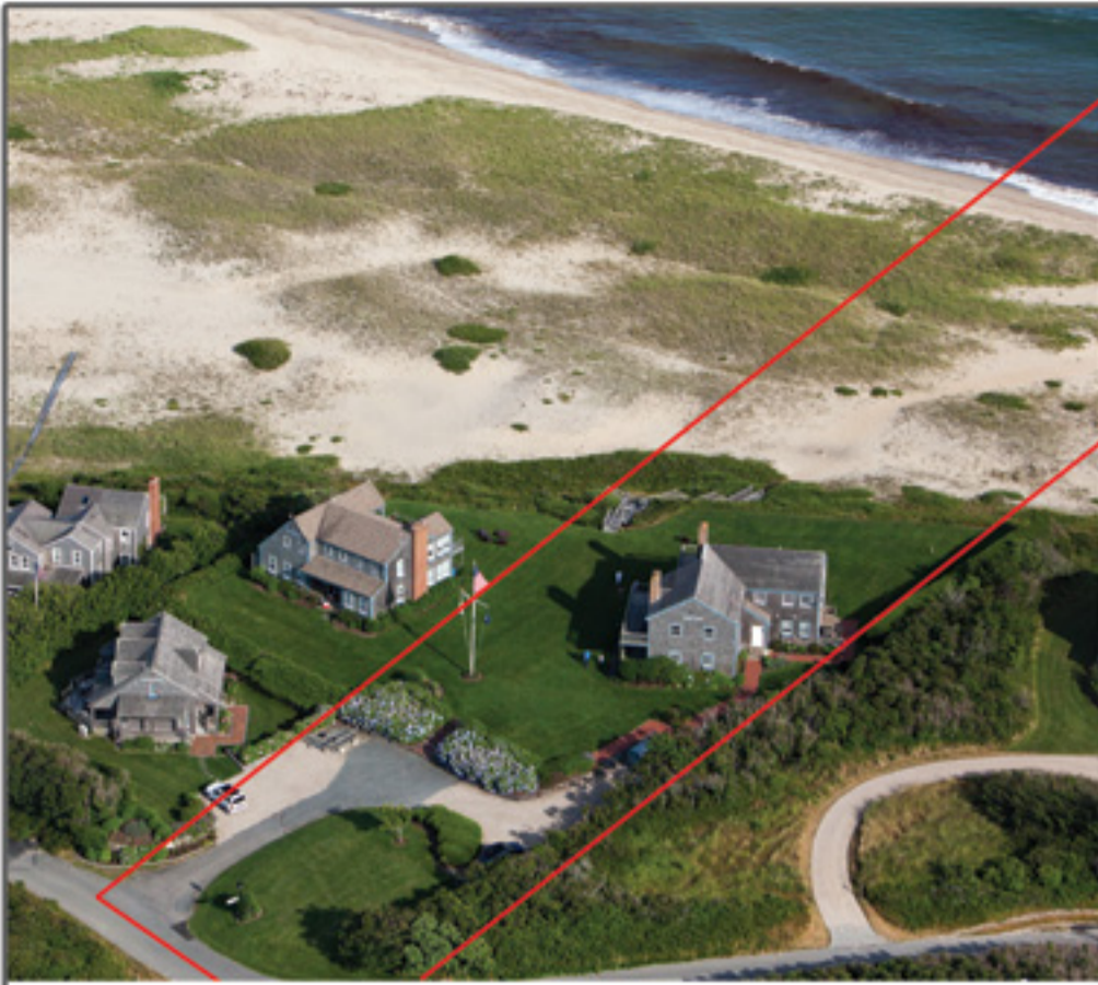
TOM NEVERS 1 Elliott's Way