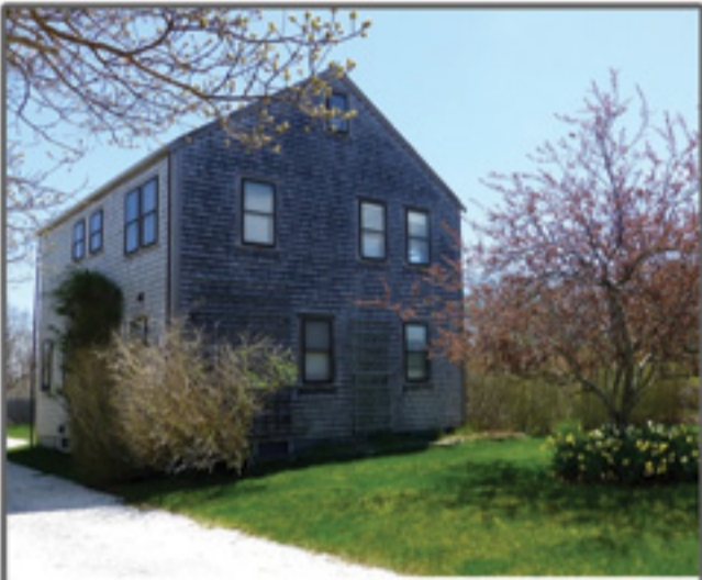
TOM NEVERS 20 Arlington Street $675,000