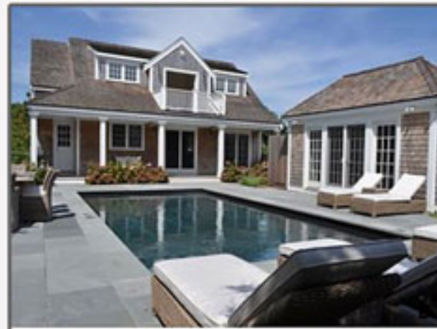
TOWN 15 Hedgebury/20a Madaket 4 bed. / 4.5 baths Weekly Rental: $8,000 - $15,000