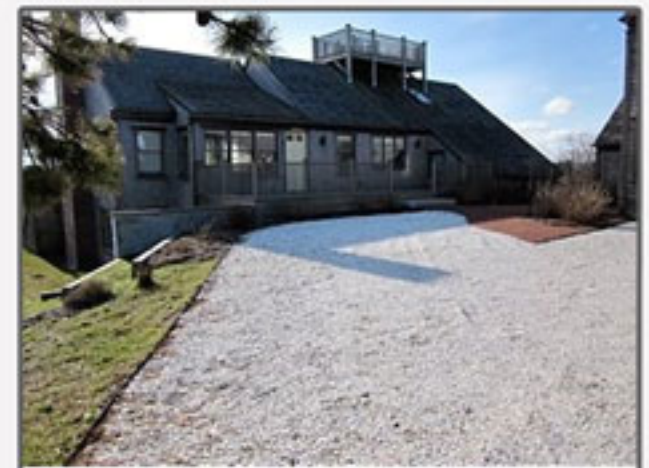
MADAKET 8 Midland Ave 6 bed. / 7 baths Weekly Rental: $8,500