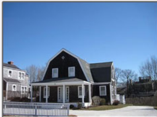
TOWN 62 Prospect Street 7 bed. / 4 baths Weekly Rental: $5,500 - $7,000