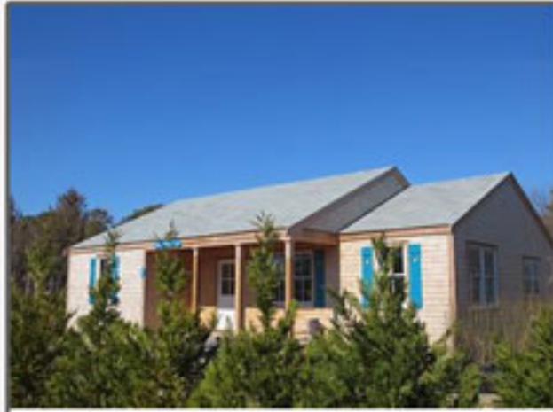
SURFSIDE 73b Hooper Farm Road 4 bed. / 2.5 baths Weekly Rental: $5,000