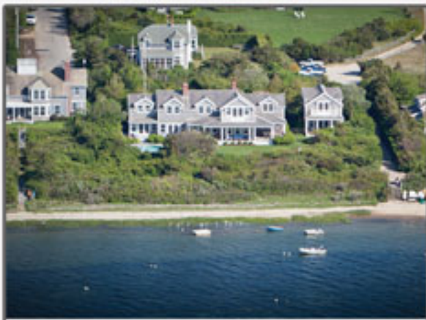
MONOMOY 48 Monomoy Road 6 bed. / 7.5 baths Weekly Rental: $30,000 - $50,000