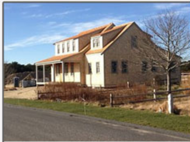
CISCO 19 Nanahumacke Lane 4 bed. / 4.5 baths Weekly Rental: $5,000 - $13,000