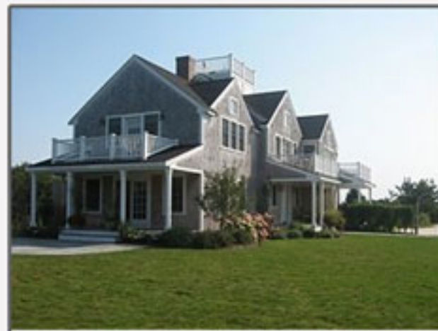
SURFSIDE 12 Pequot St 4 bed. / 5 baths Weekly Rental: $10,000