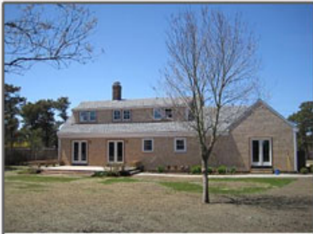
SURFSIDE 132 Surfside Road 4 bed. / 3.5 baths Weekly Rental: $5,000 - $7,500