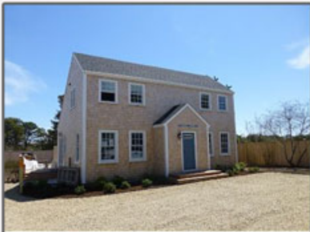
MID-ISLAND 38 Surfside Road 6 bed. / 3 baths Weekly Rental: $5,200 - $6,500