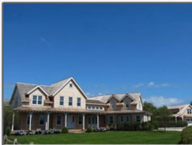
CLIFF 14 Old Westmoor Farm 6 bed. / 5.5 baths Weekly Rental: $30,000