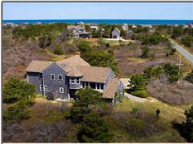
DIONIS 19 Bishops Rise 4 bed. / 3.5 baths Weekly Rental: $11,000 - $13,000