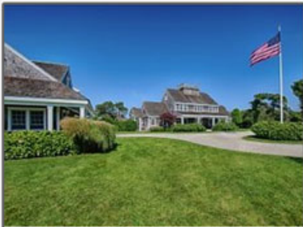
SURFSIDE 6 Pochick Ave 5 bed. / 4.5 baths Weekly Rental: $15,000 - $22,500