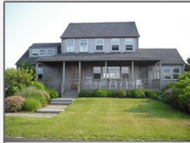
TOWN 12 Hulbert Avenue 5 bed. / 2 baths Weekly Rental: $7,500 - $8,500