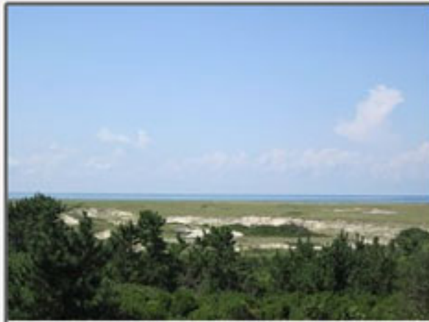
DIONIS 4 Lavendar Lane 6 bed. / 3.5 baths Weekly Rental: $10,000 - $12,000