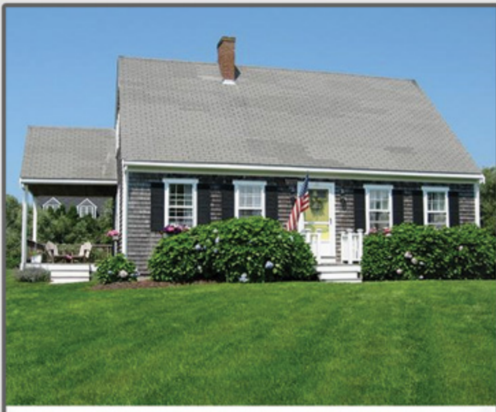
HUMMOCK POND 15 Meadow View Drive $1,125,000