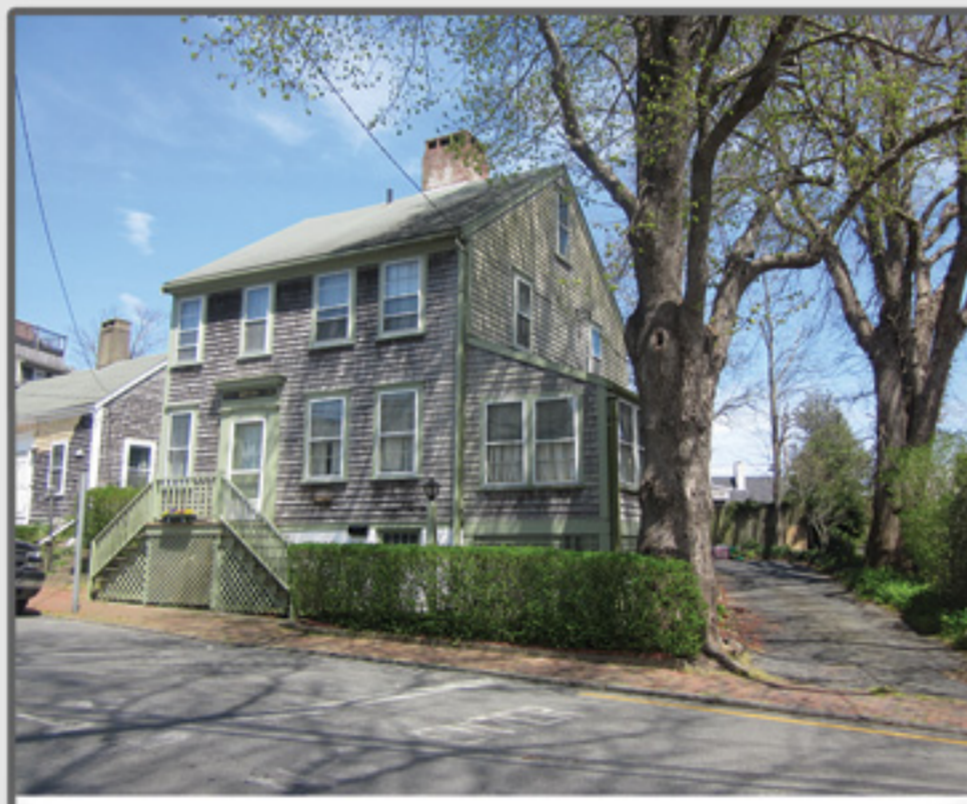
TOWN 65 Centre Street