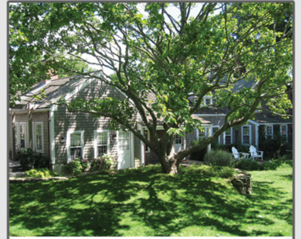
TOWN 3 Joy Street