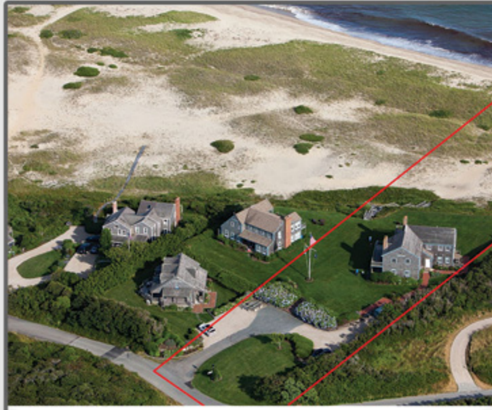
TOM NEVERS 1 Elliott's Way