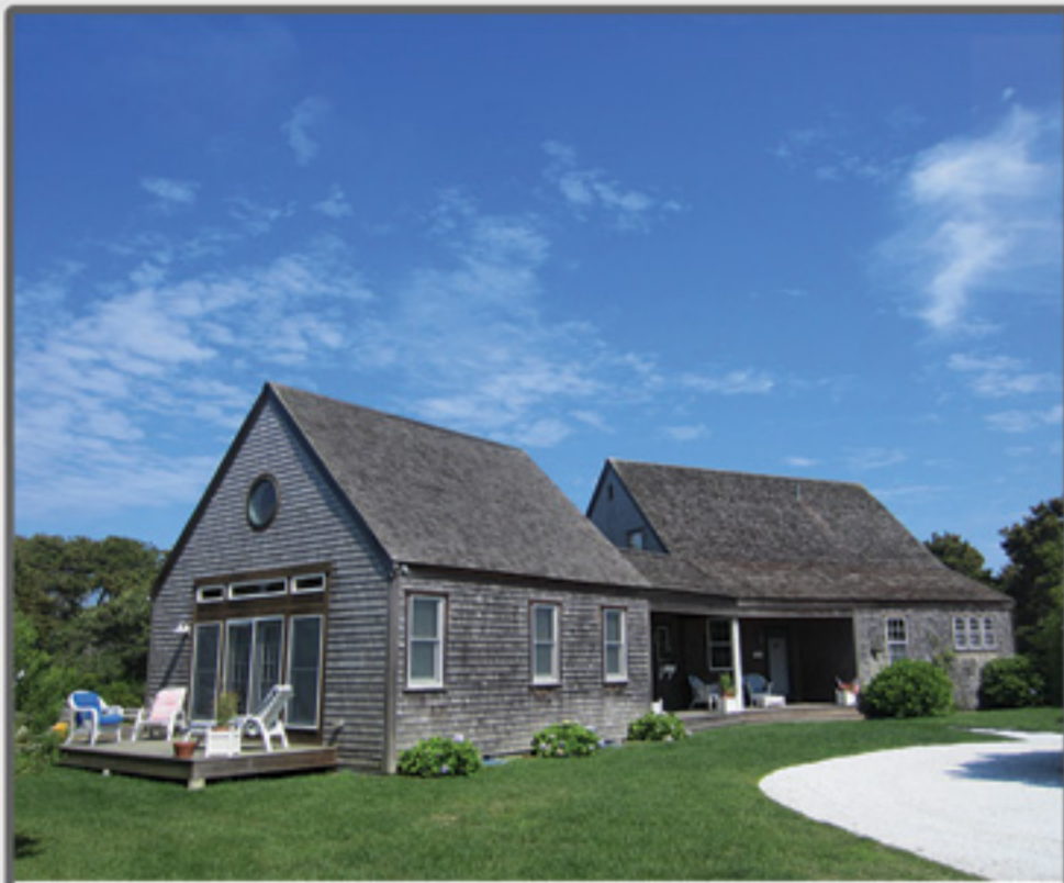
SURFSIDE 58 Pochick Avenue