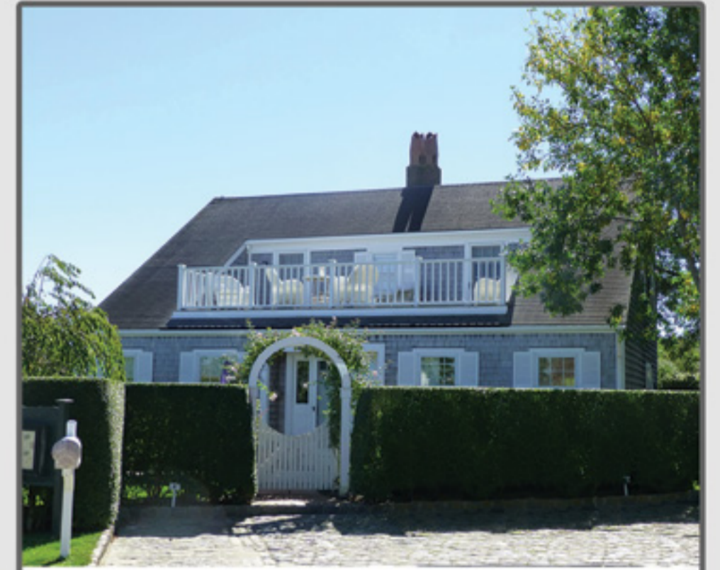
BRANT POINT 4 Stone Barn Way