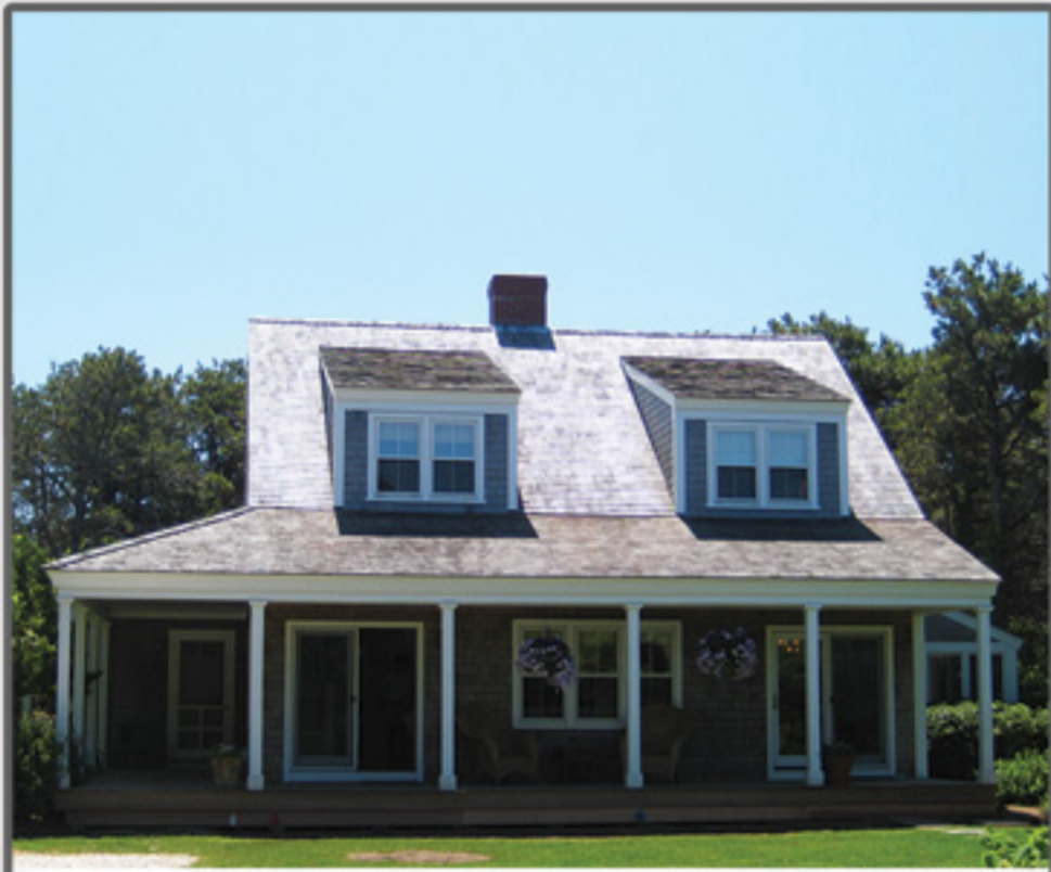
MONOMOY 29B Brewster Road