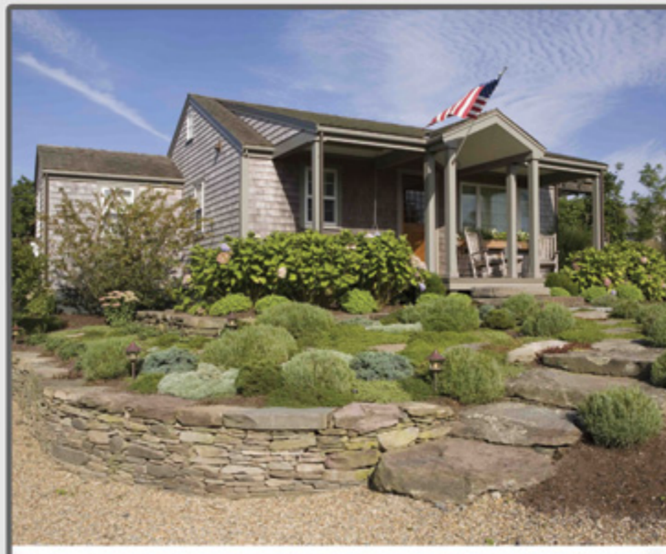
WEST OF TOWN 14 Dukes Road $1,079,000