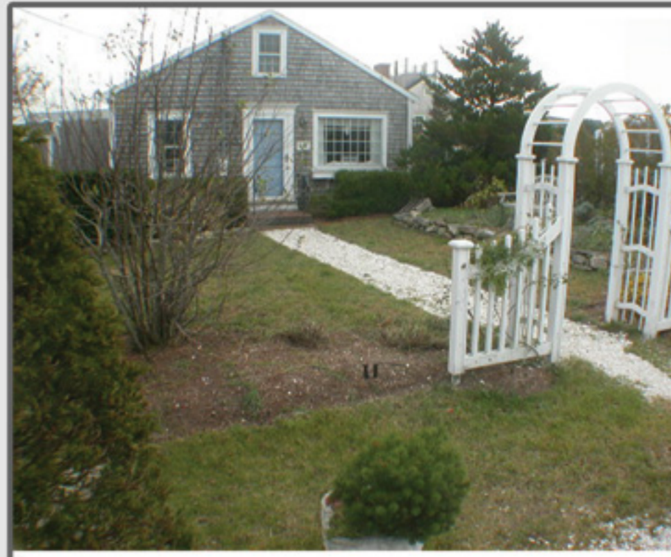
TOWN 10.5 Cherry Street $695,000