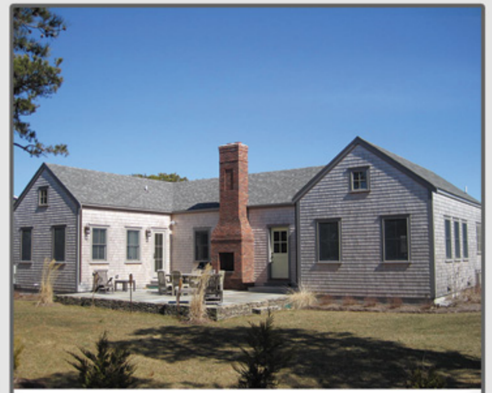
SURFSIDE 146 Surfside Road