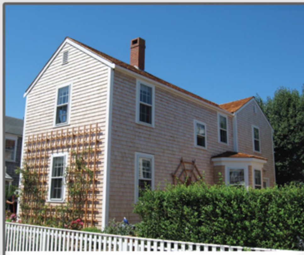
TOWN 3 Martin's Lane