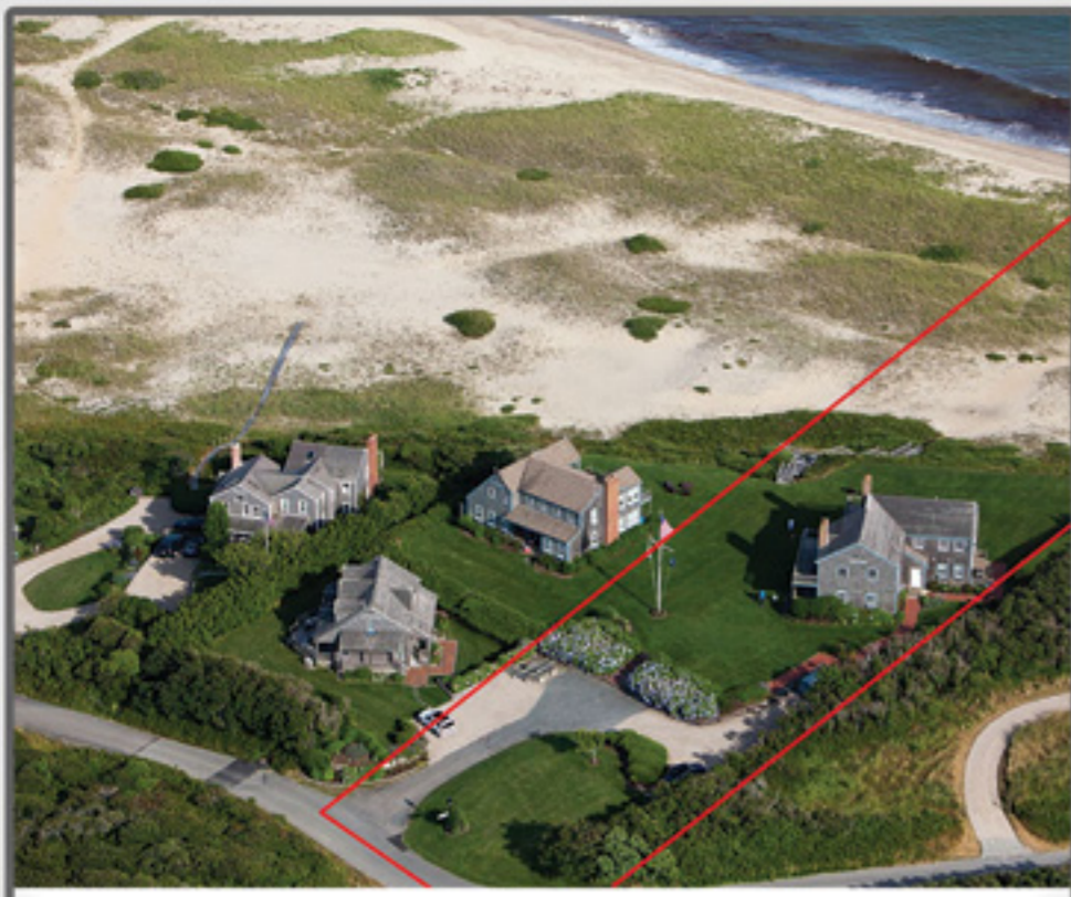
TOM NEVERS 1 Elliott's Way