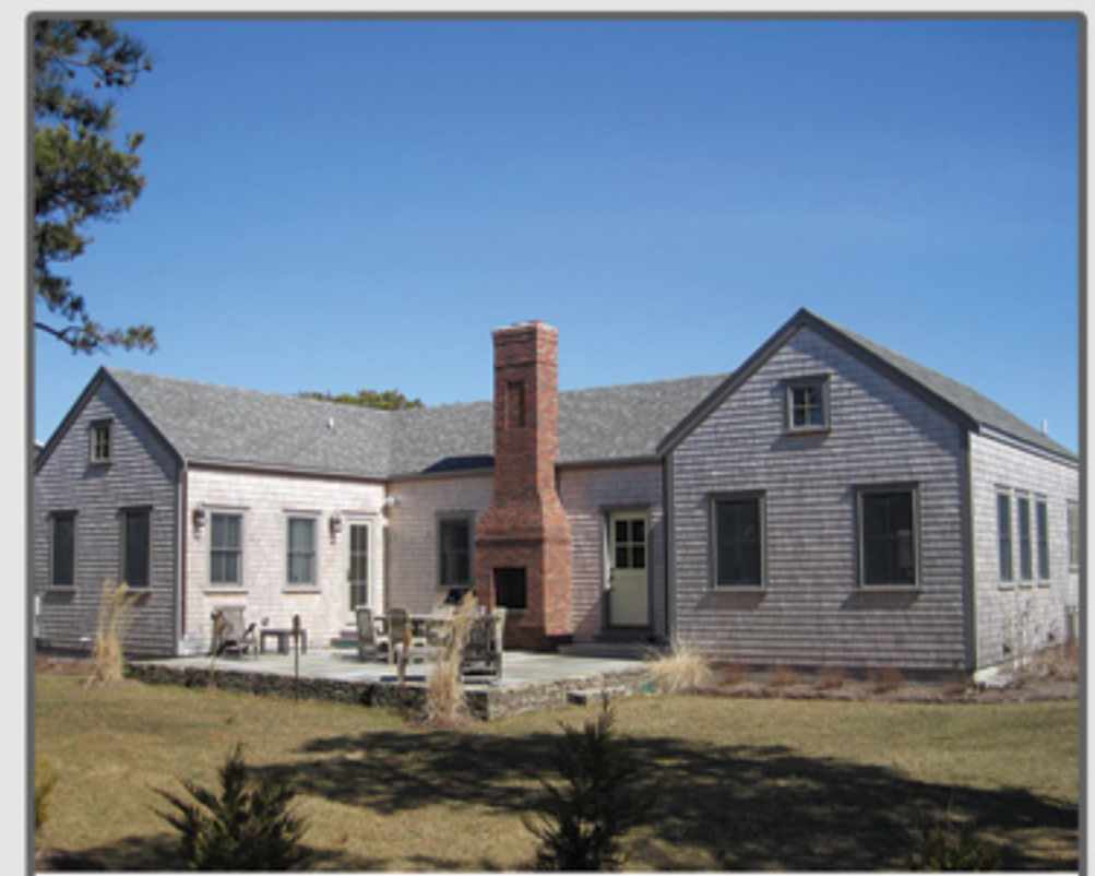
SURFSIDE 146 Surfside Road $1,875,000