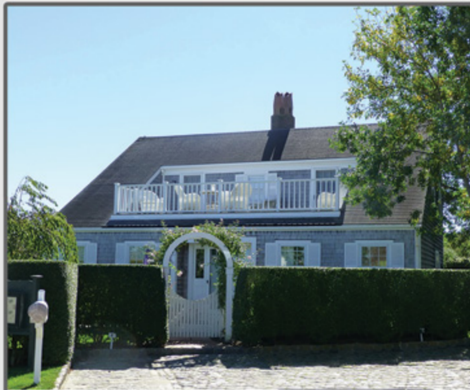
BRANT POINT 4 Stone Barn Way $2,260,000