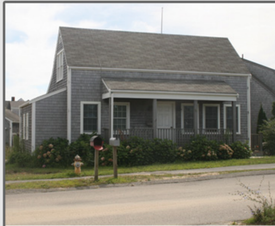
SURFSIDE 61 Surfside Road $499,000