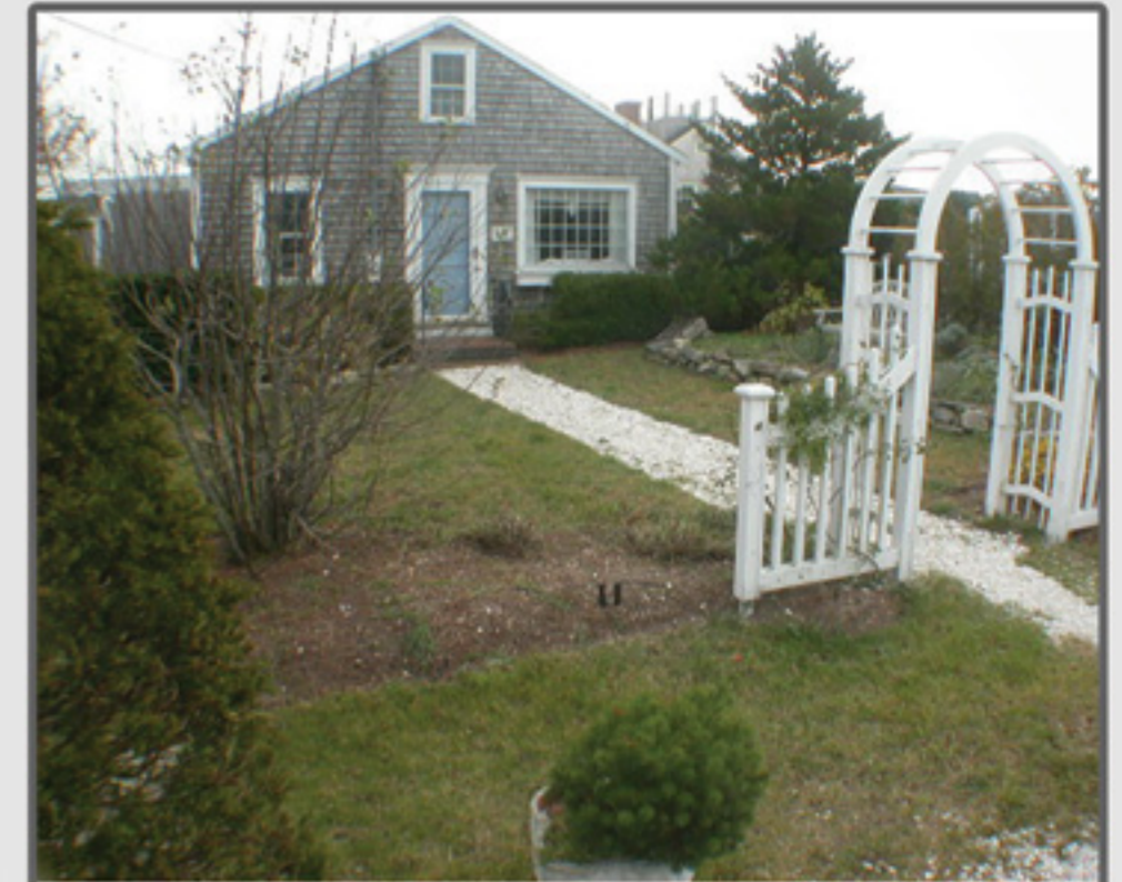
TOWN 10.5 Cherry Street $695,000