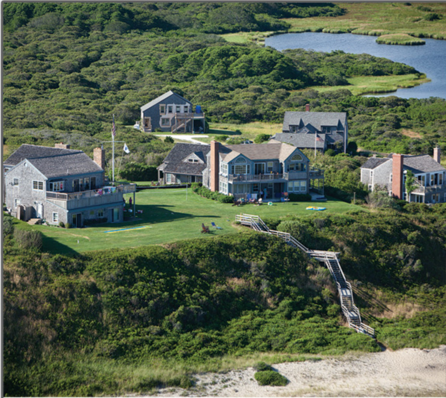
TOM NEVERS 1 & 3 Elliott's Way