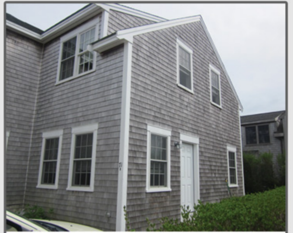
MID ISLAND 71B Hinsdale Road $475,000