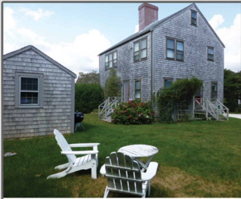
TOM NEVERS 20 Arlington Street $675,000