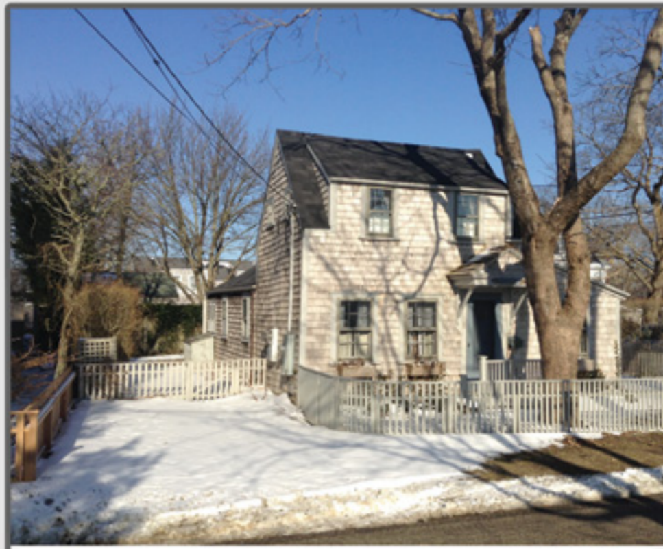
TOWN 1 Joy Street $850,000