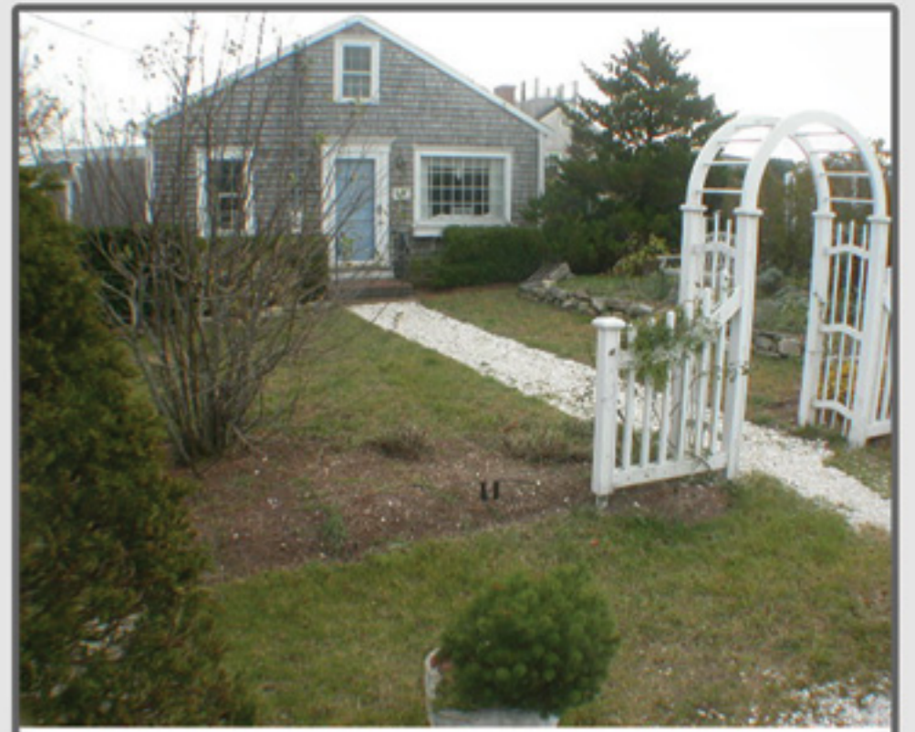
TOWN 10.5 Cherry Street $695,000