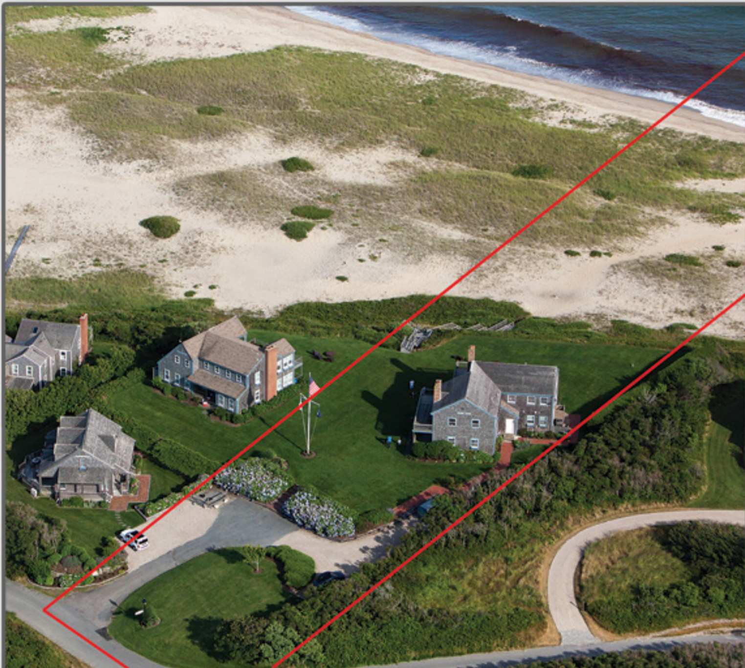
TOM NEVERS 1 Elliott's Way