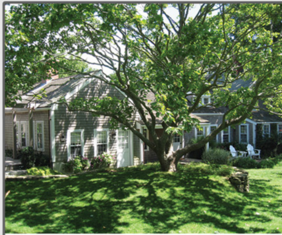
TOWN 3 Joy Street $2,800,000