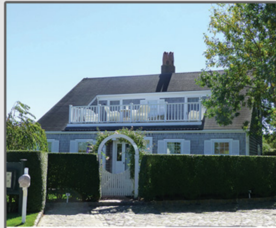
BRANT POINT 4 Stone Barn Way $2,260,000