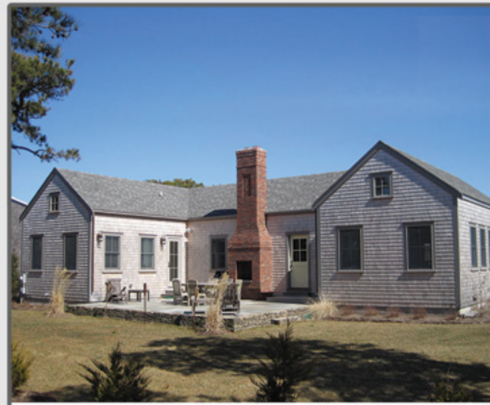
SURFSIDE 146 Surfside Road $1,875,000