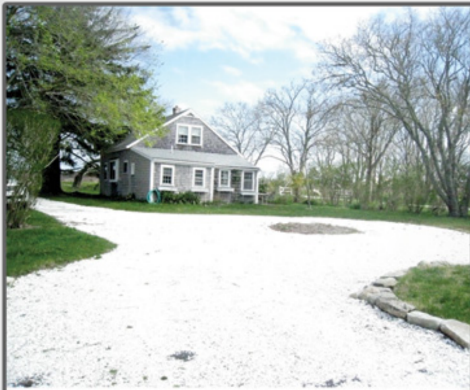
SCONSET 4 McGarveys Way $950,000