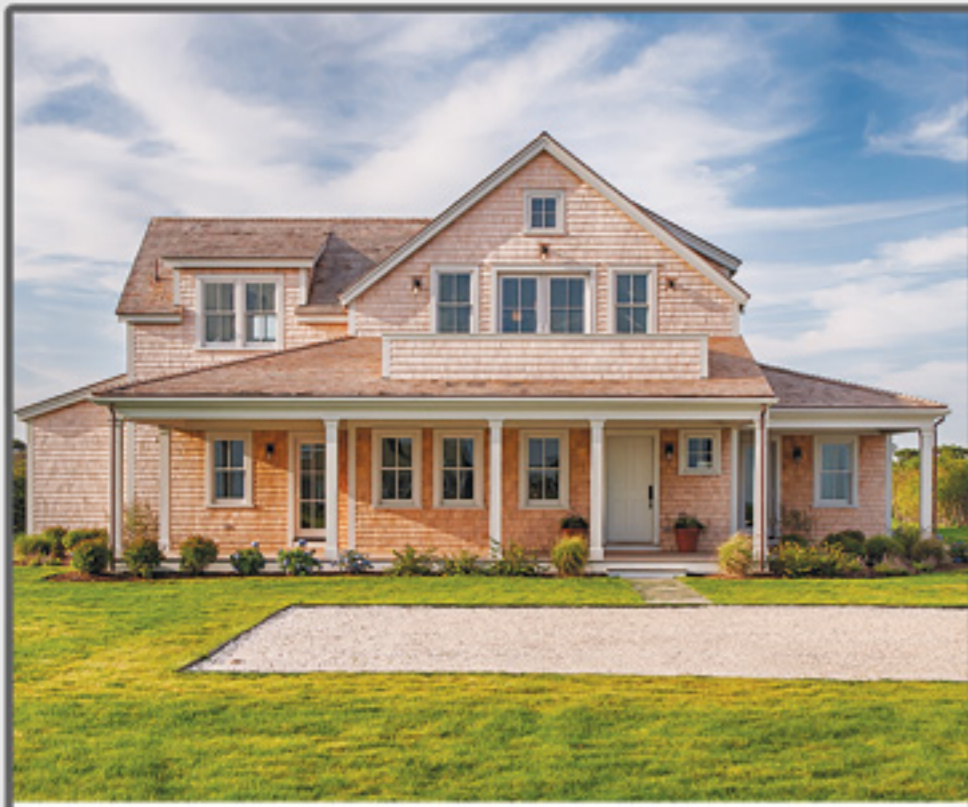
SURFSIDE 58 Nobadeer Avenue $3,495,000