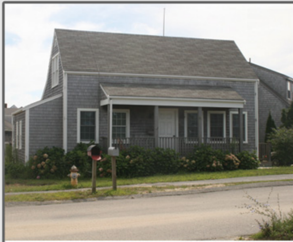
SURFSIDE 61 Surfside Road $499,000