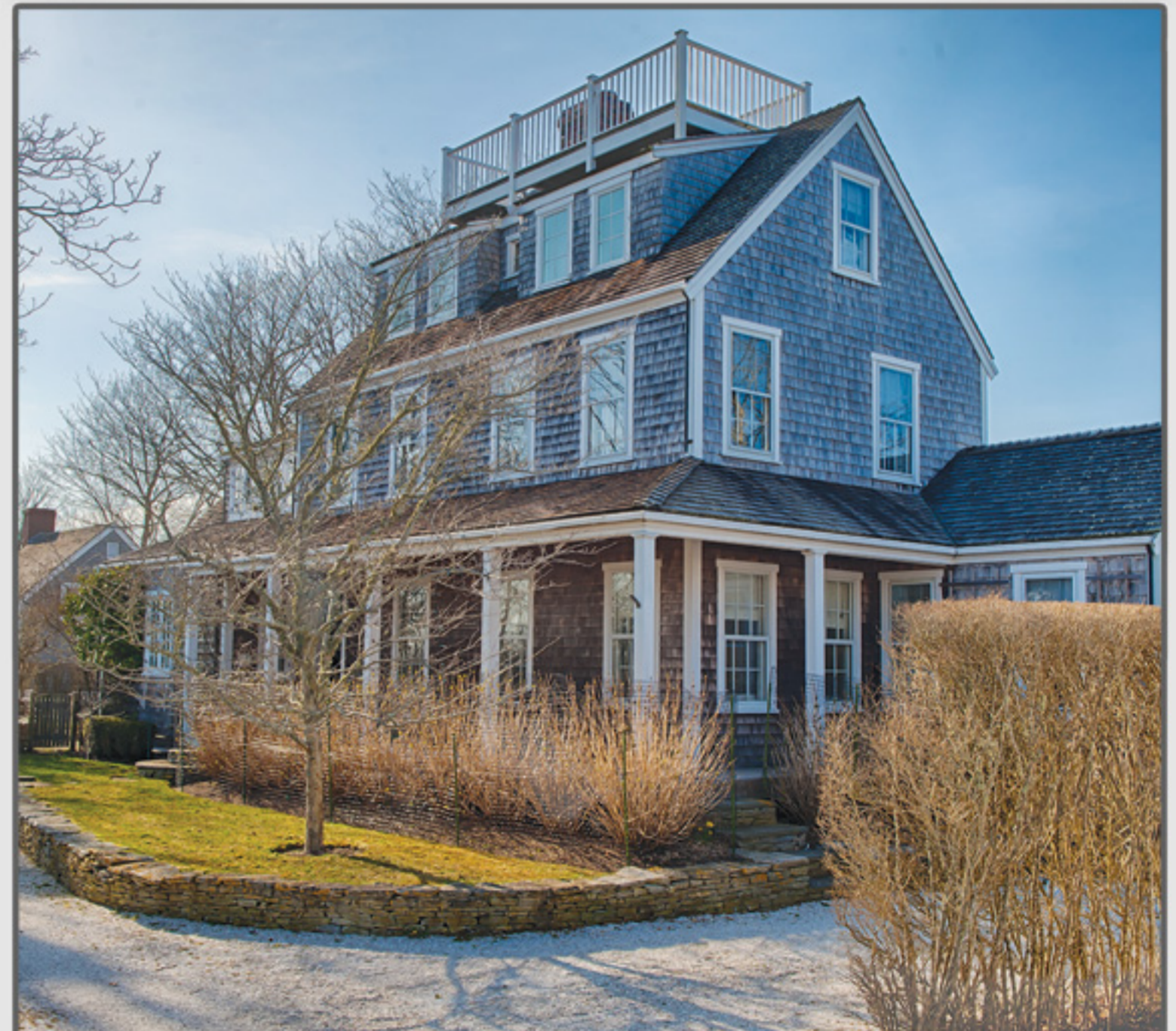
CLIFF 5 Kite Hill Lane