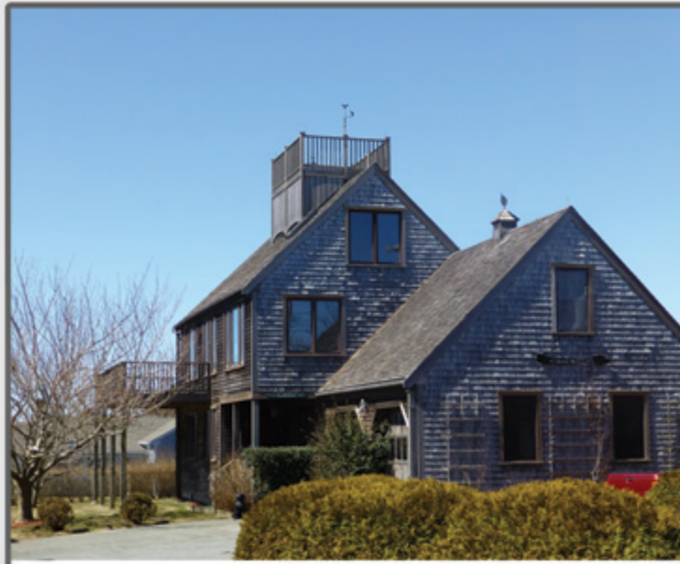
SCONSET 44 Sankaty Road $1,550,000