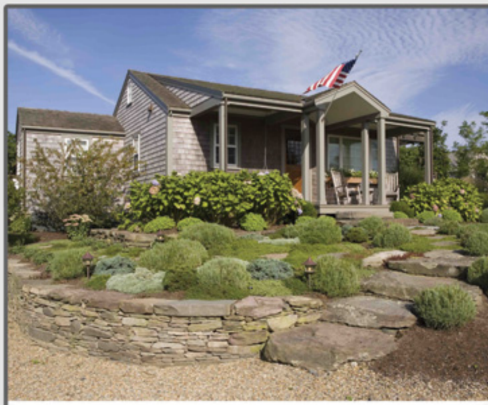
WEST OF TOWN 14 Dukes Road $1,079,000