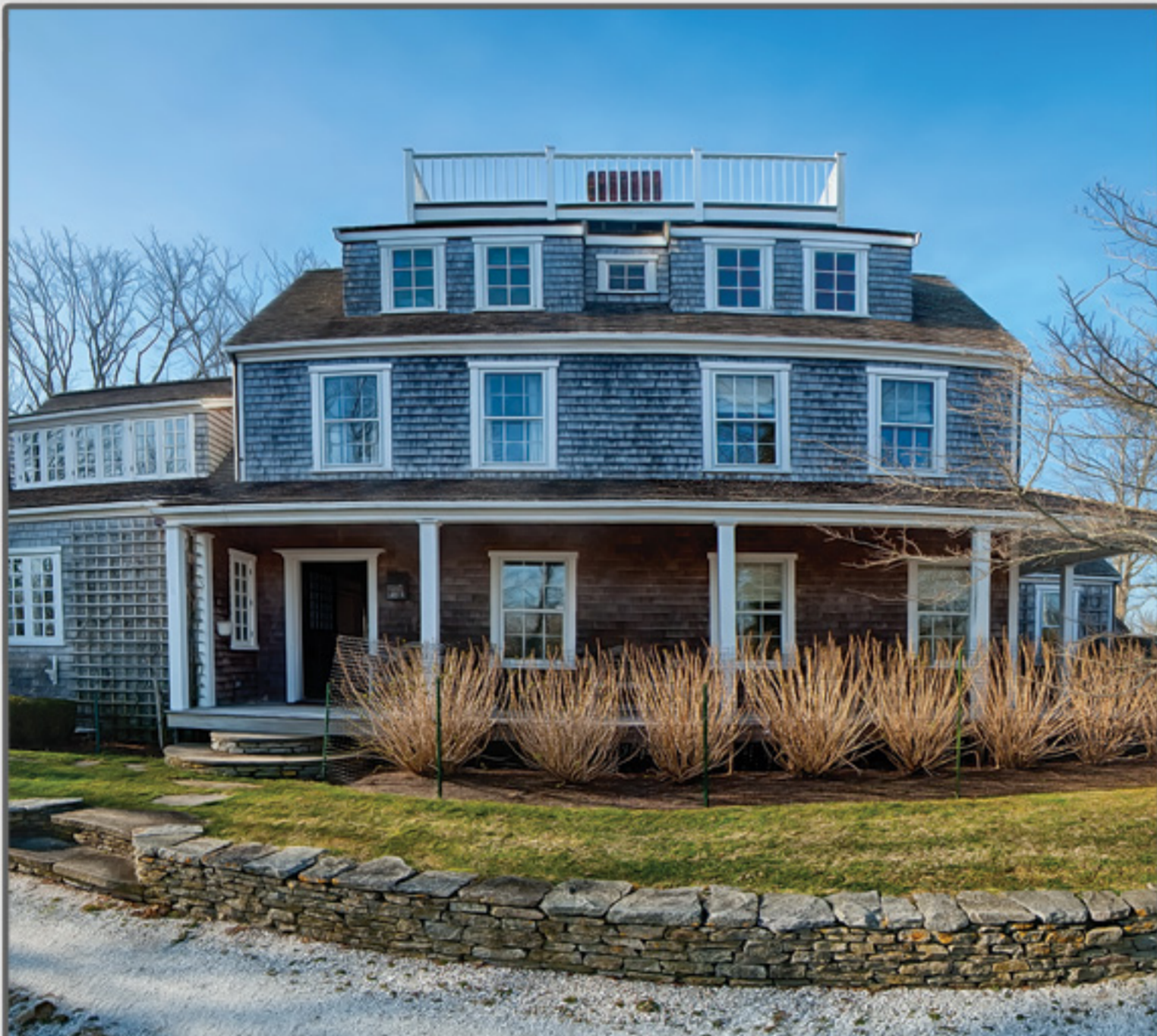
CLIFF 5 Kite Hill Lane