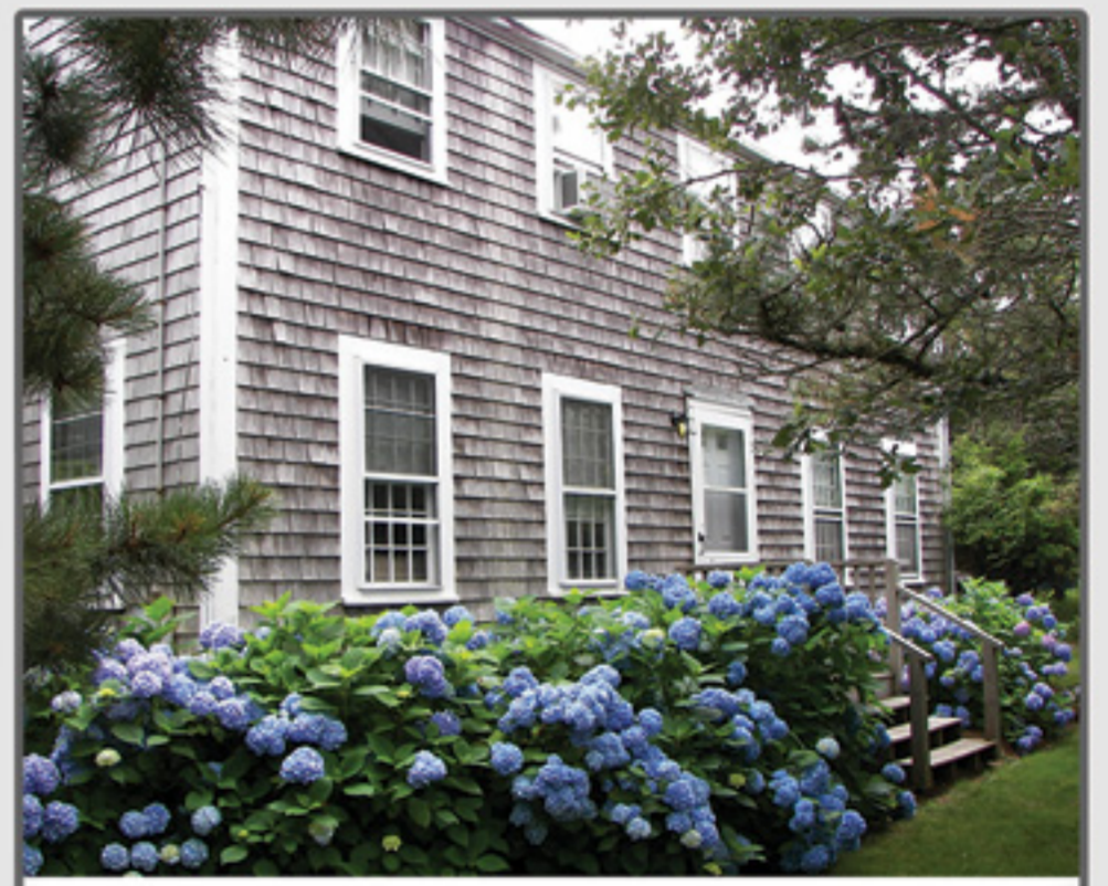
SURFSIDE 154 Surfside Road $1,050,000