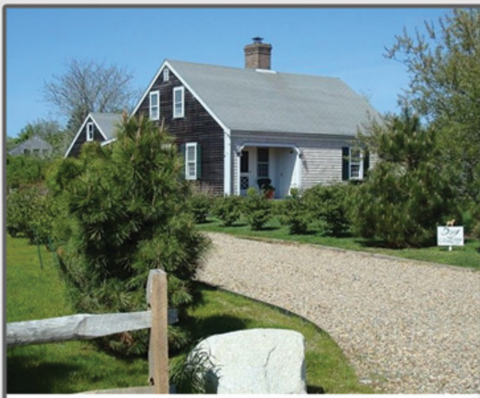
WEST OF TOWN 52 Meadow View Drive $1,150,000