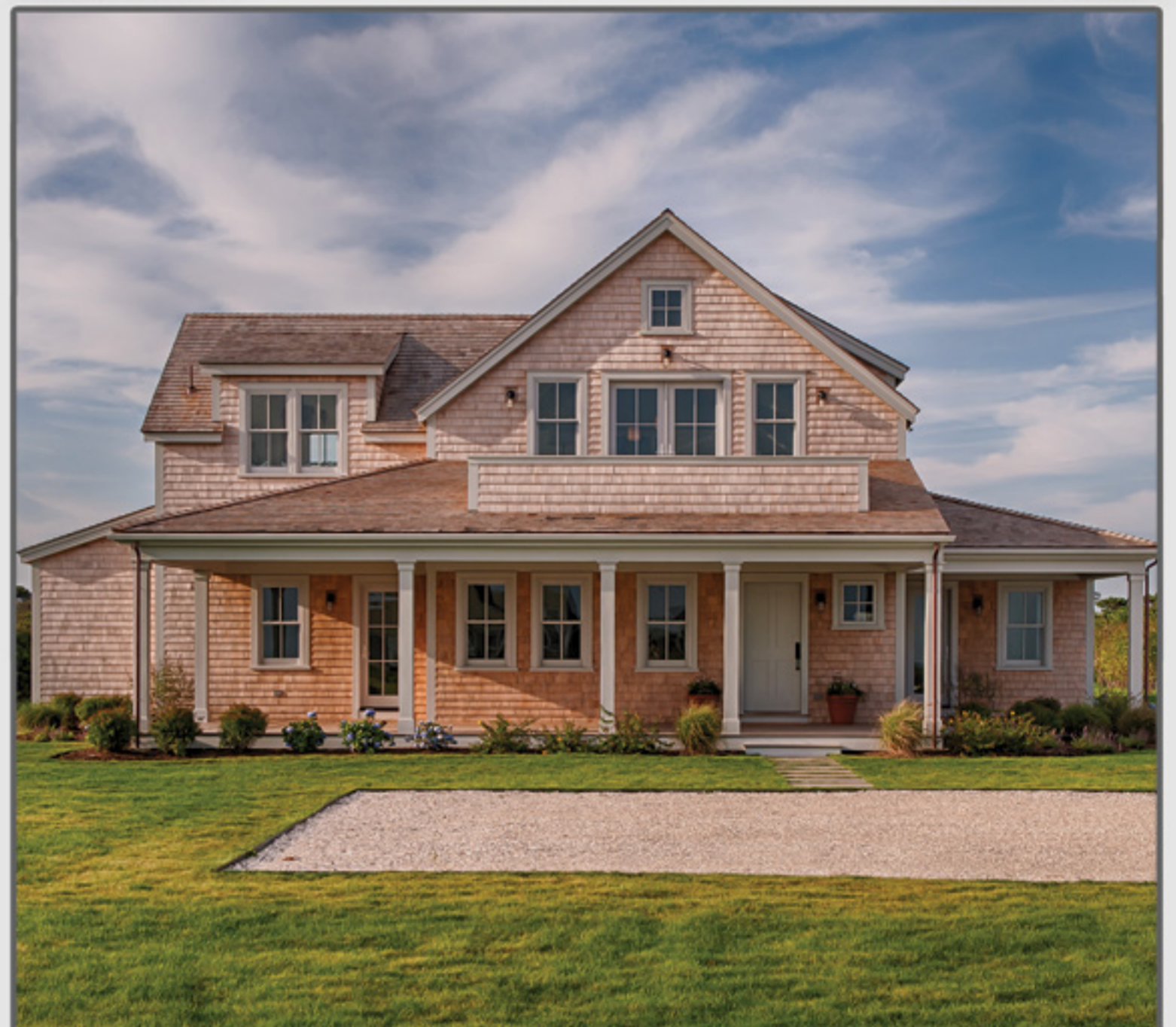
SURFSIDE 58 Nobadeer Avenue