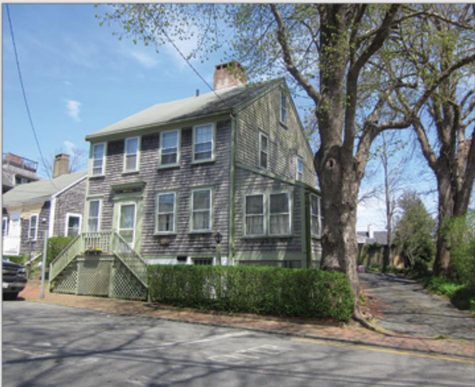
65 Centre Street