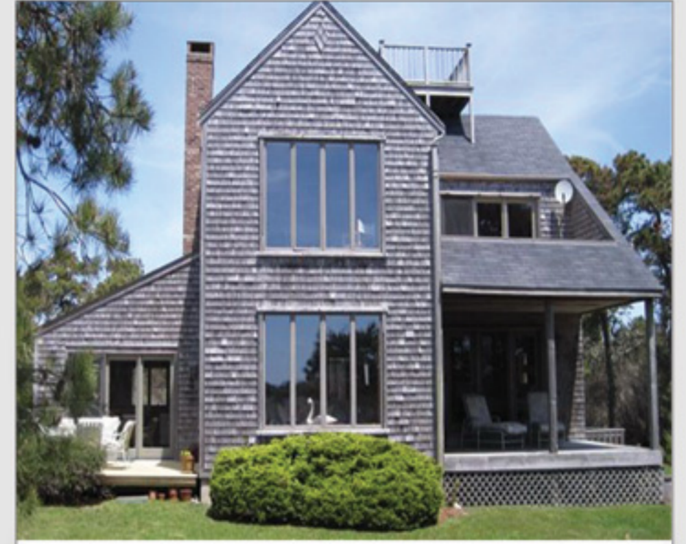
10.5 Cherry Street $695,000