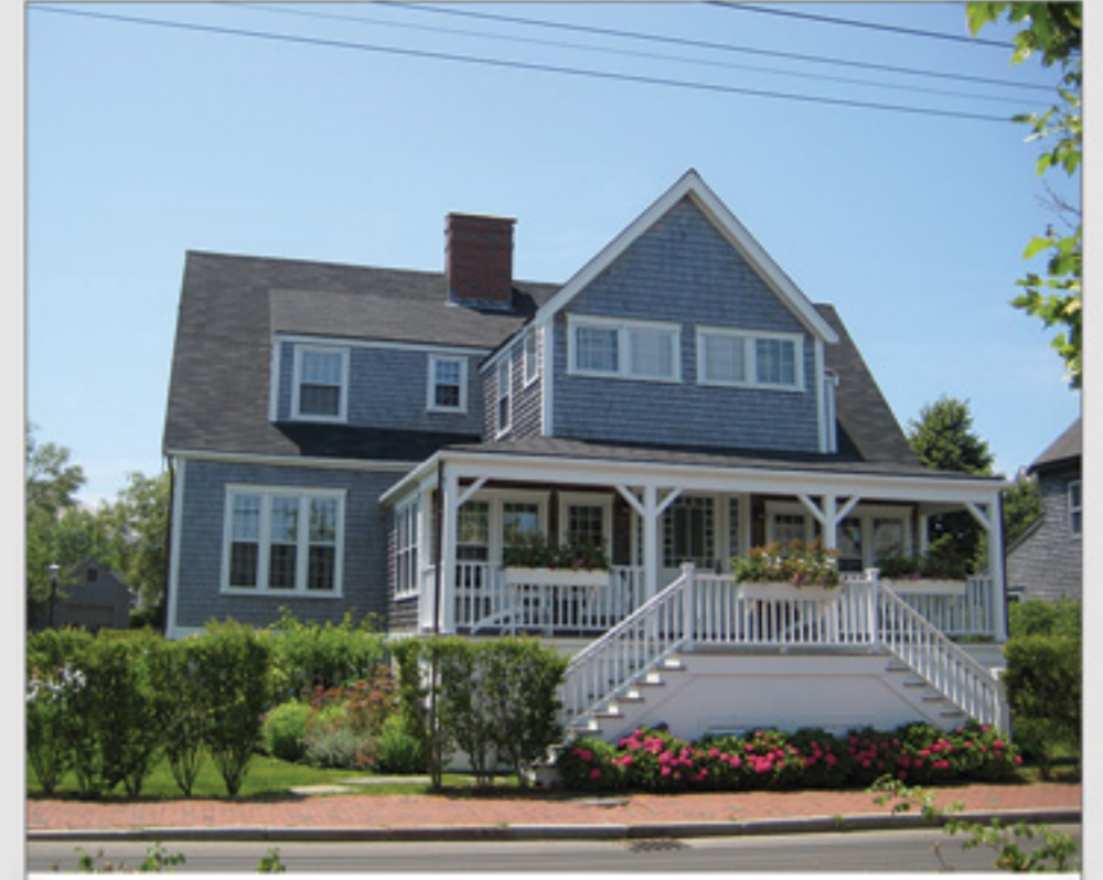
1 Dolphin Court