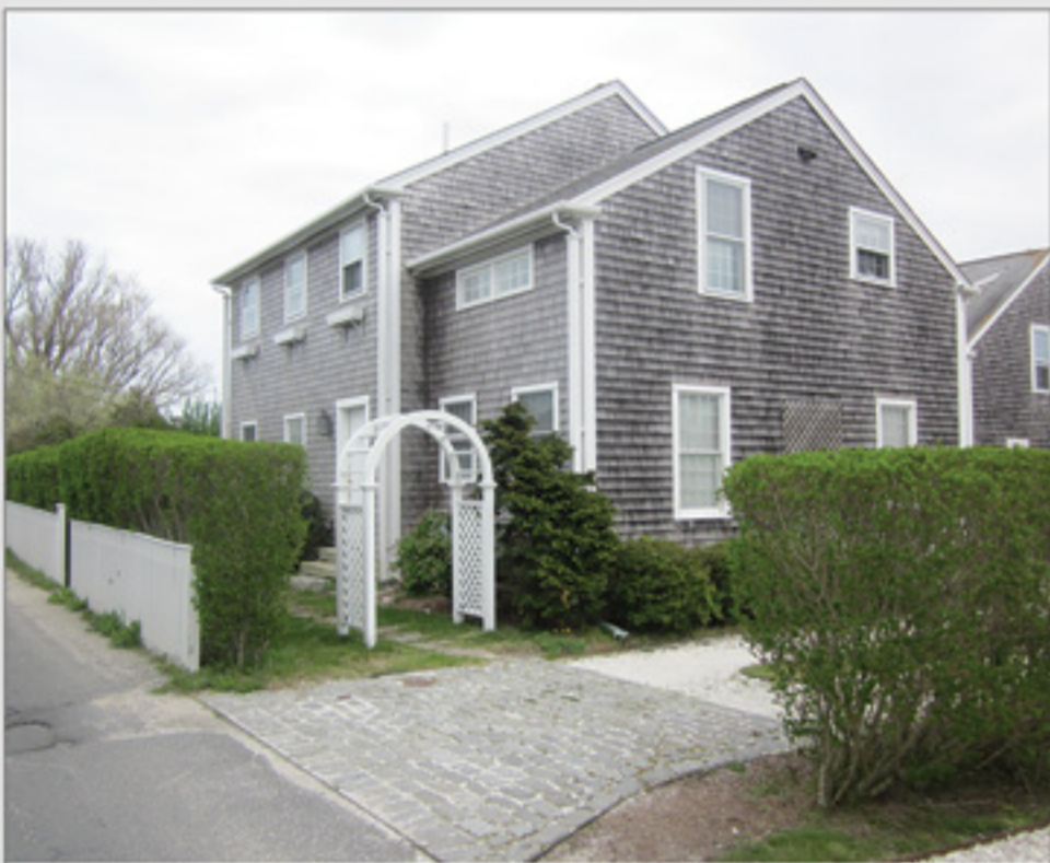
20 Arlington Street $675,000