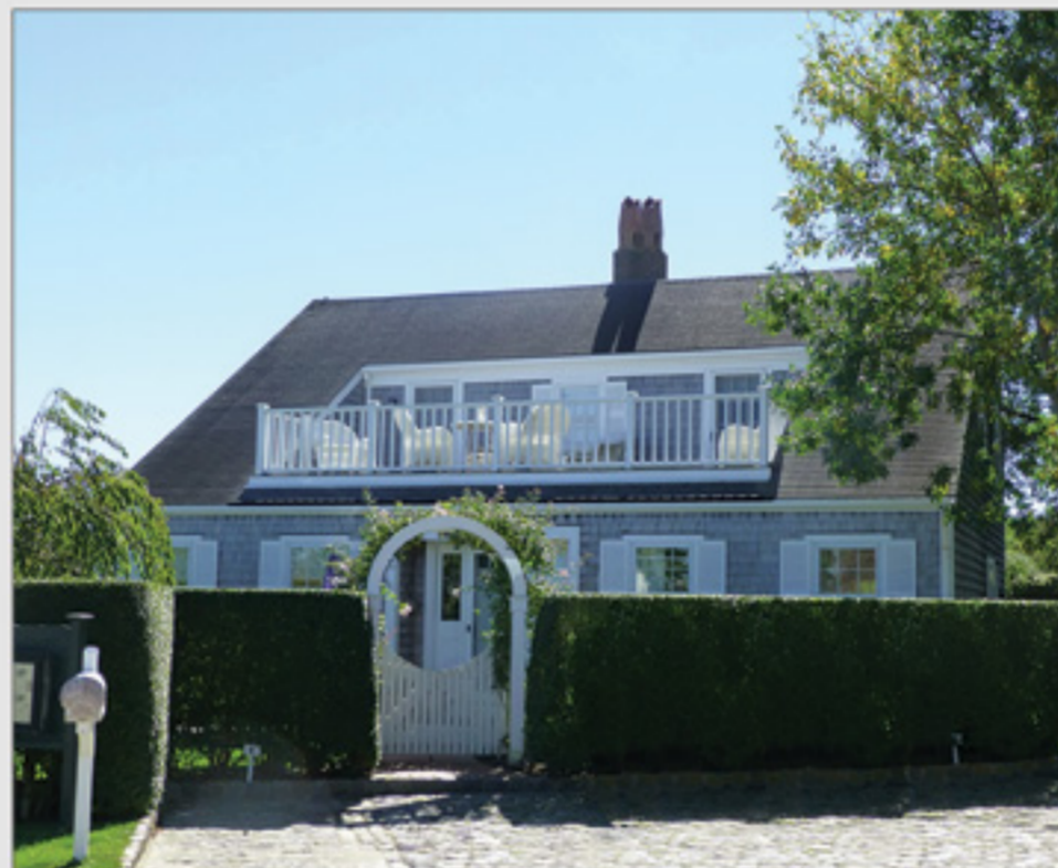
4 Stone Barn Way