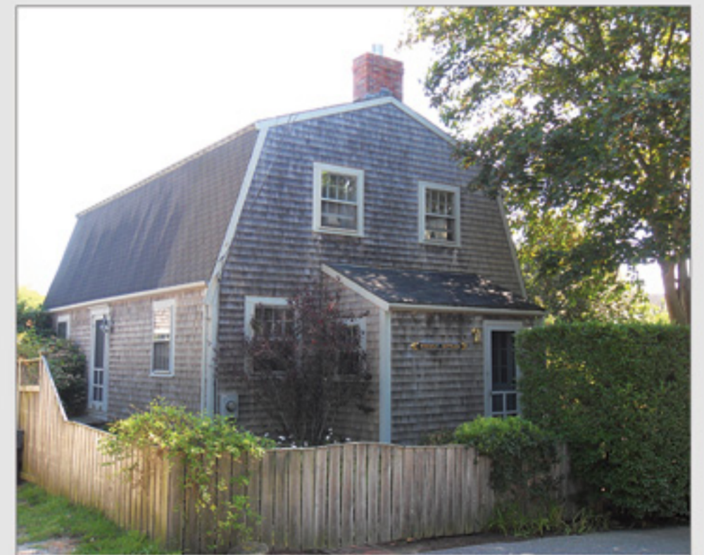
71B Hinsdale Road $475,000