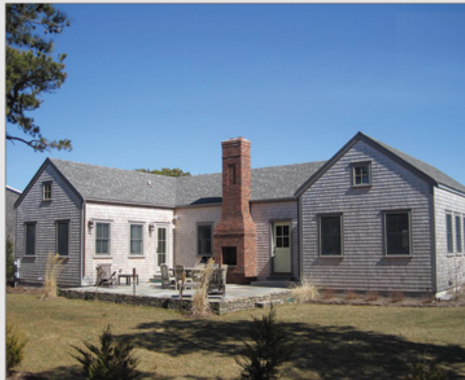
146 Surfside Road