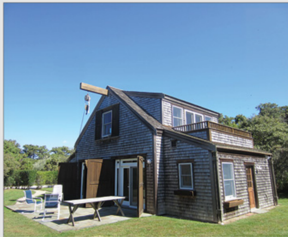
61 Surfside Road $499,000