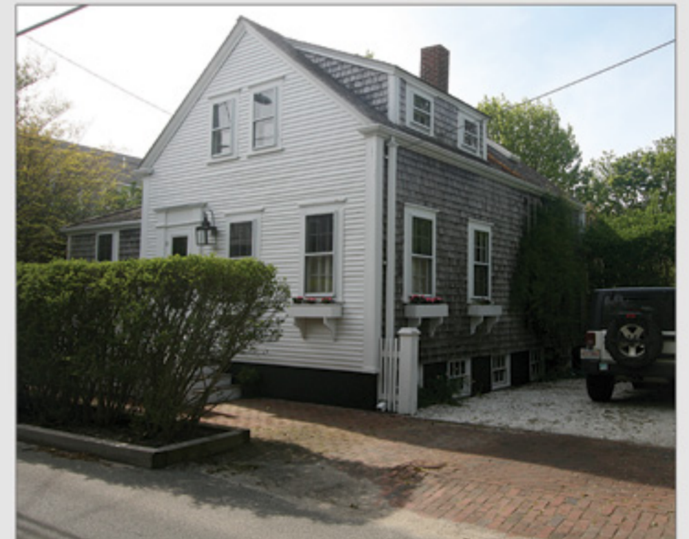
3 West Dover Street