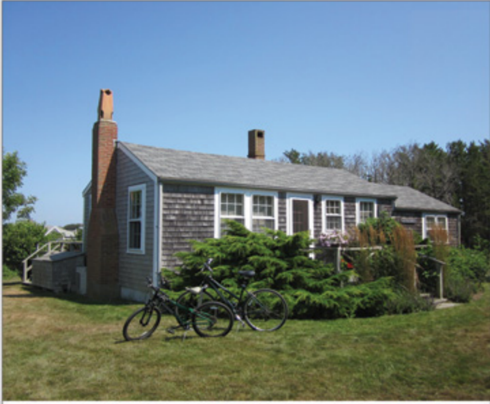
4 McGarveys Way $950,000