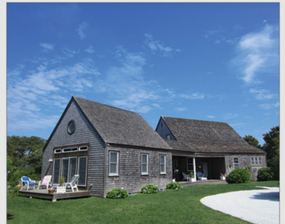
58 Pochick Avenue