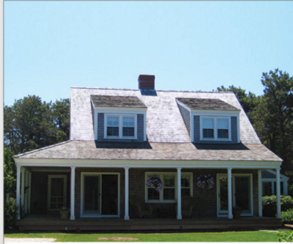
29B Brewster Road