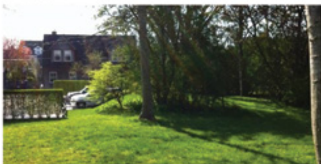
3 Joy Street (portion of) - Town - $ 999,000