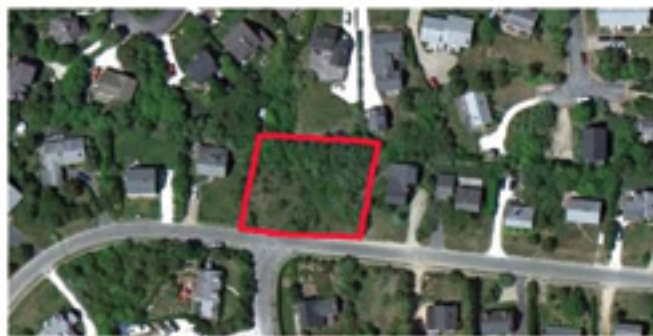
17 - 19 Tashama Lane - Mid Island - $ 419,000