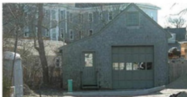
7 Dolphin Court - Brant Point - $ 1,550,000