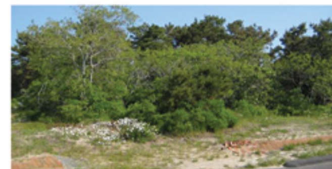
1 Cachalot Lane - Surfside - $ 599,000