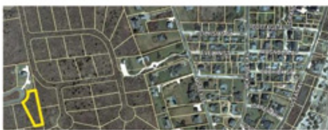
7 Westerwick Drive - Sconset - $ 875,000