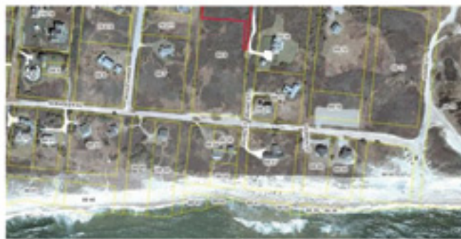
58 Nobadeer (LOT-C) TBD - Surfside - $ 895,000