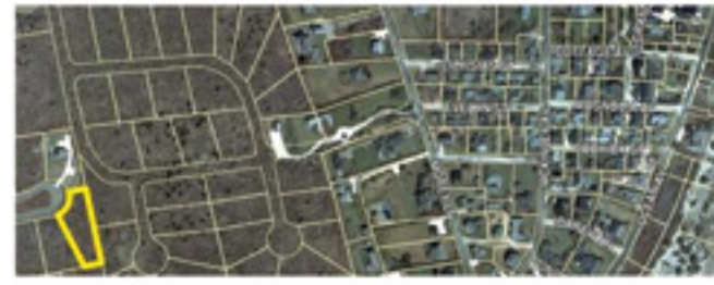
7 Westerwick Drive - Sconset - $ 875,000