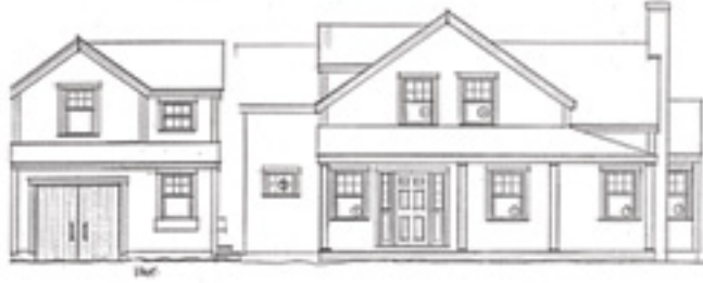
11 Aurora Way - Hummock Pond - $ 695,000