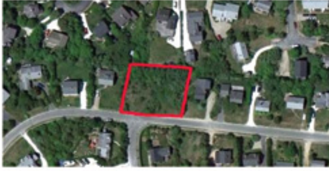
17 - 19 Tashama Lane - Mid Island - $ 419,000