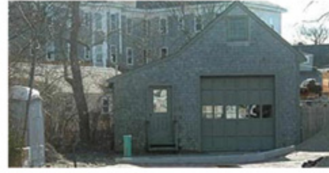
7 Dolphin Court - Brant Point - $ 1,550,000