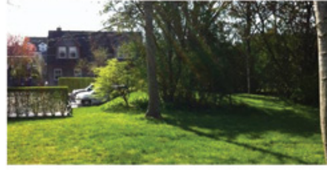
3 Joy Street (portion of) - Town - $ 999,000