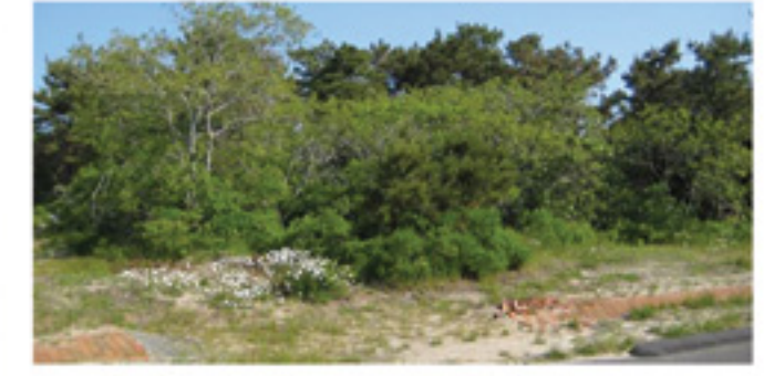
1 Cachalot Lane - Surfside - $ 599,000