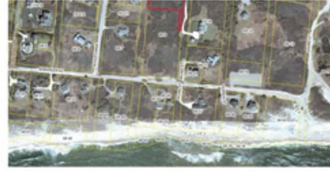
58 Nobadeer (LOT-C) TBD - Surfside - $ 895,000