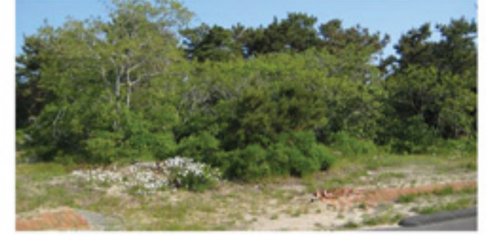
1 Cachalot Lane - Surfside - $ 599,000