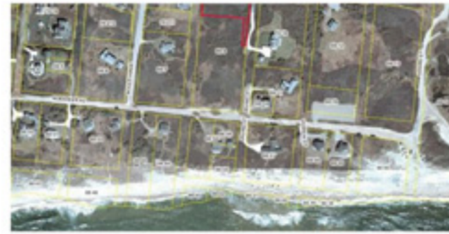
58 Nobadeer (LOT-C) TBD - Surfside - $ 895,000