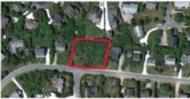
17 - 19 Tashama Lane - Mid Island - $ 419,000