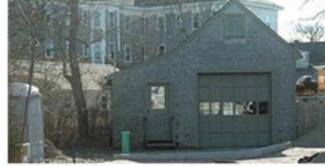
7 Dolphin Court - Brant Point - $ 1,550,000