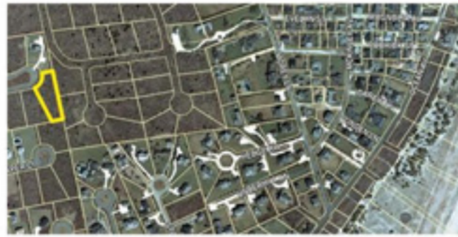
7 Westerwick Drive - Sconset - $ 875,000