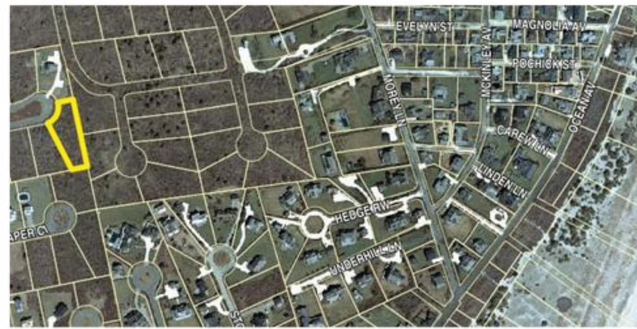
7 Westerwick Drive - Sconset - $ 875,000