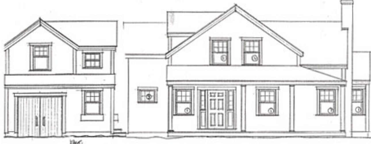
11 Aurora Way - Hummock Pond - $ 695,000