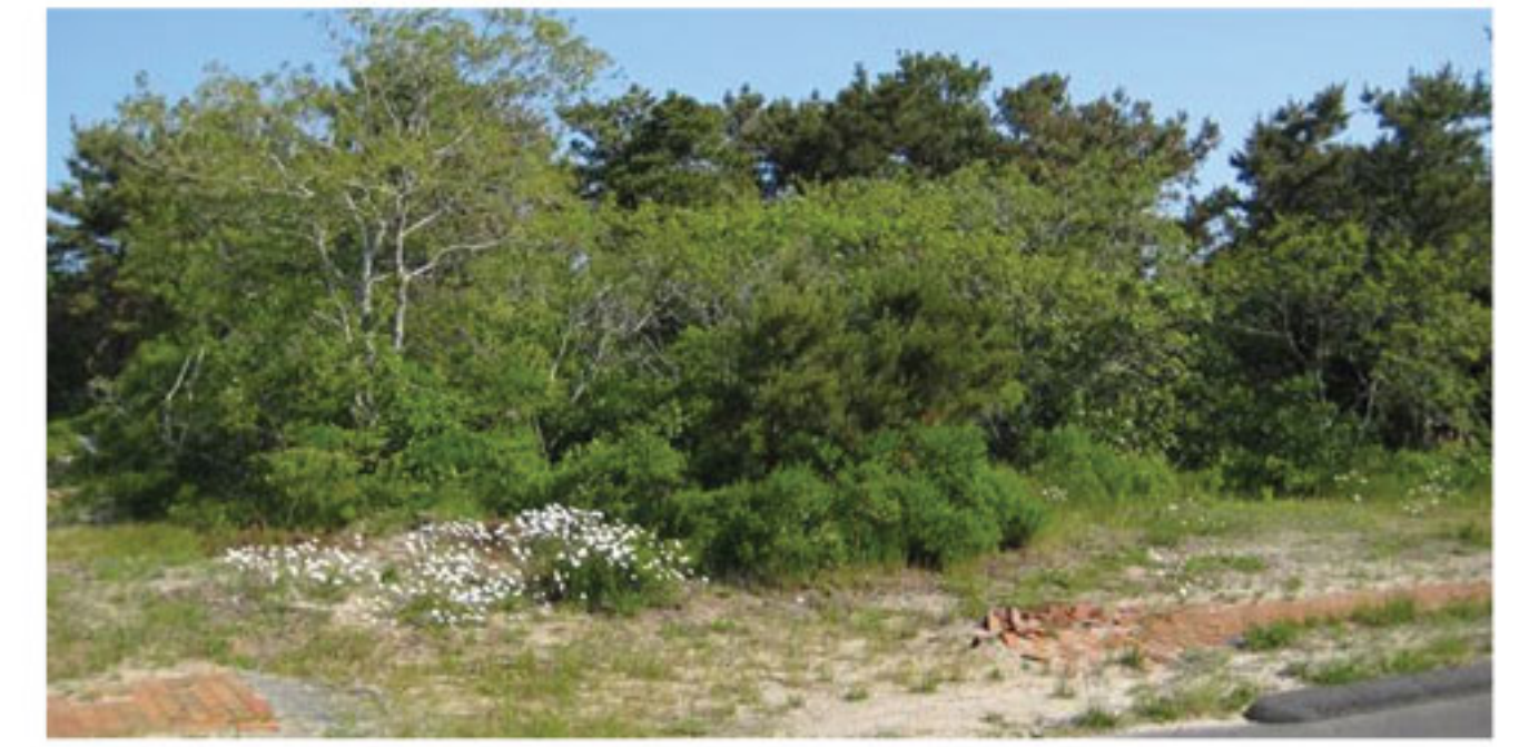
1 Cachalot Lane - Surfside - $ 599,000