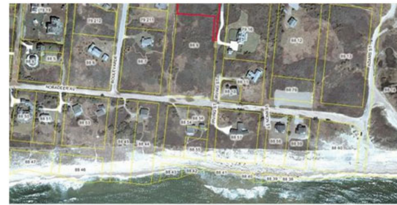
58 Nobadeer (LOT-C) TBD - Surfside - $ 895,000