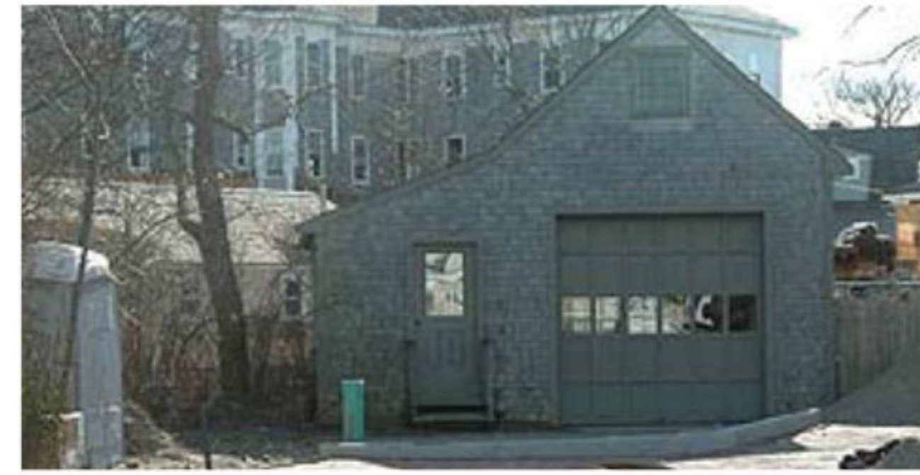
7 Dolphin Court - Brant Point - $ 1,550,000