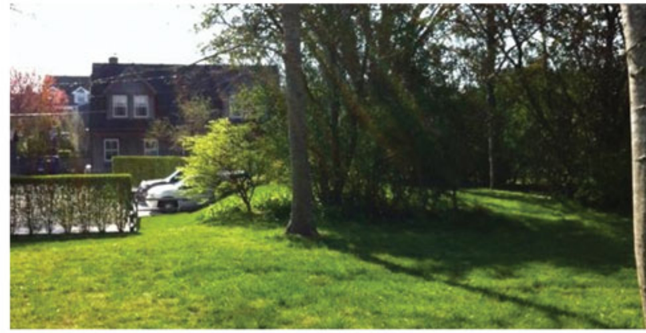
3 Joy Street (portion of) - Town - $ 999,000